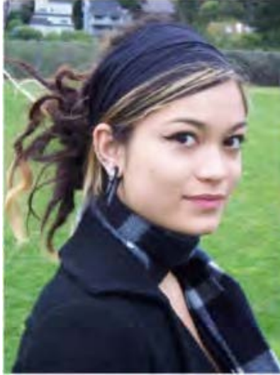
Figure 2 Robin Sage’s Profile Picture