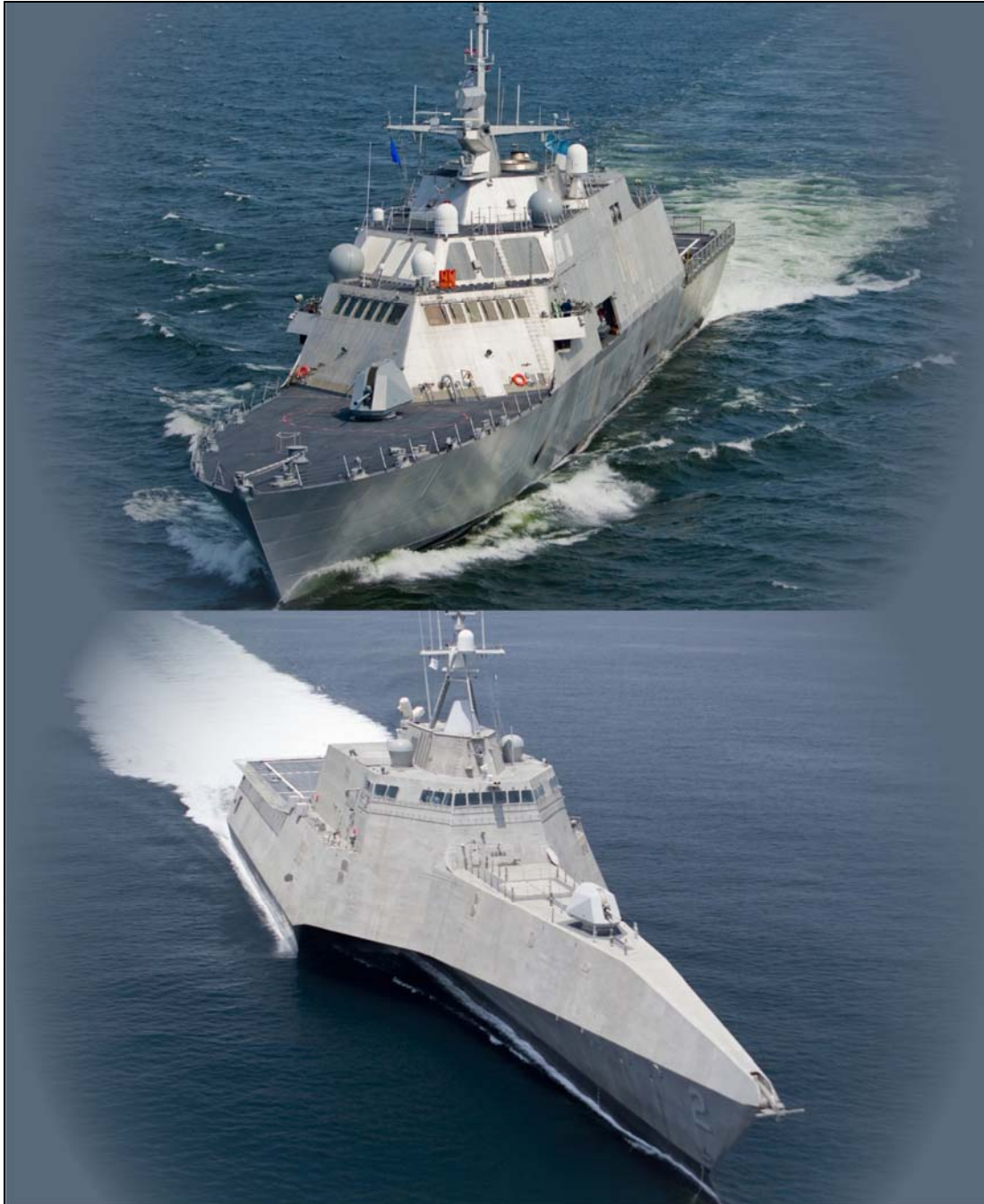
Figure 1. Lockheed LCS Design (Top) and General Dynamics LCS Design (Bottom)