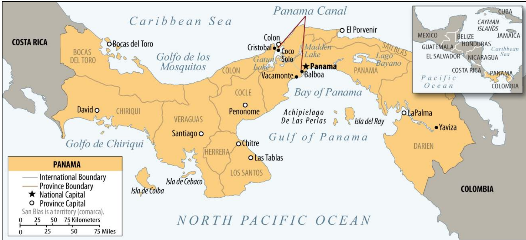
Figure 1. Map of Panama