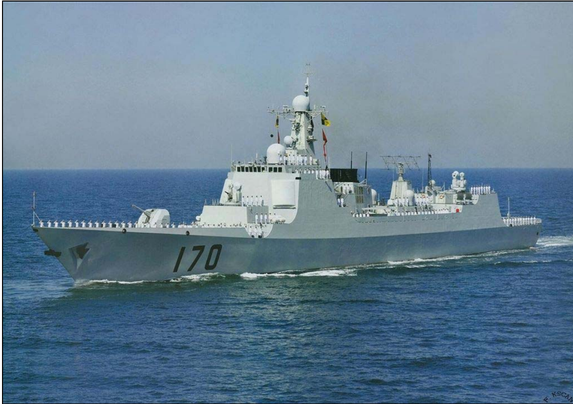
Figure 6. Luyang II (Type 052C) Class Destroyer