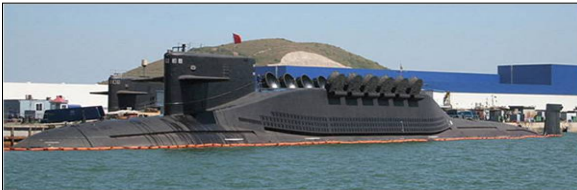
Figure 1. Jin (Type 094) Class Ballistic Missile Submarine