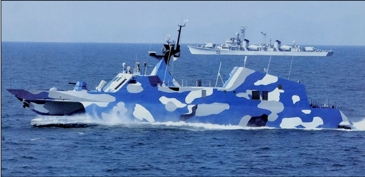
Figure 8. Houbei (Type 022) Class Fast Attack Craft With an older Luda-class destroyer behind