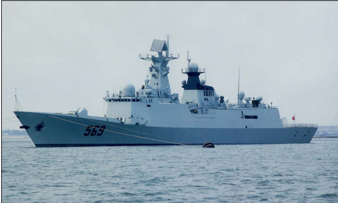
Figure 7. Jiangkai II (Type 054A) Class Frigate