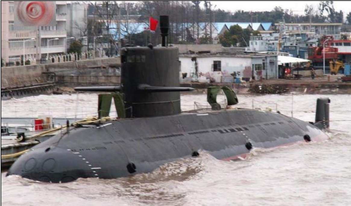
Figure 2. Yuan (Type 041) Class Attack Submarine