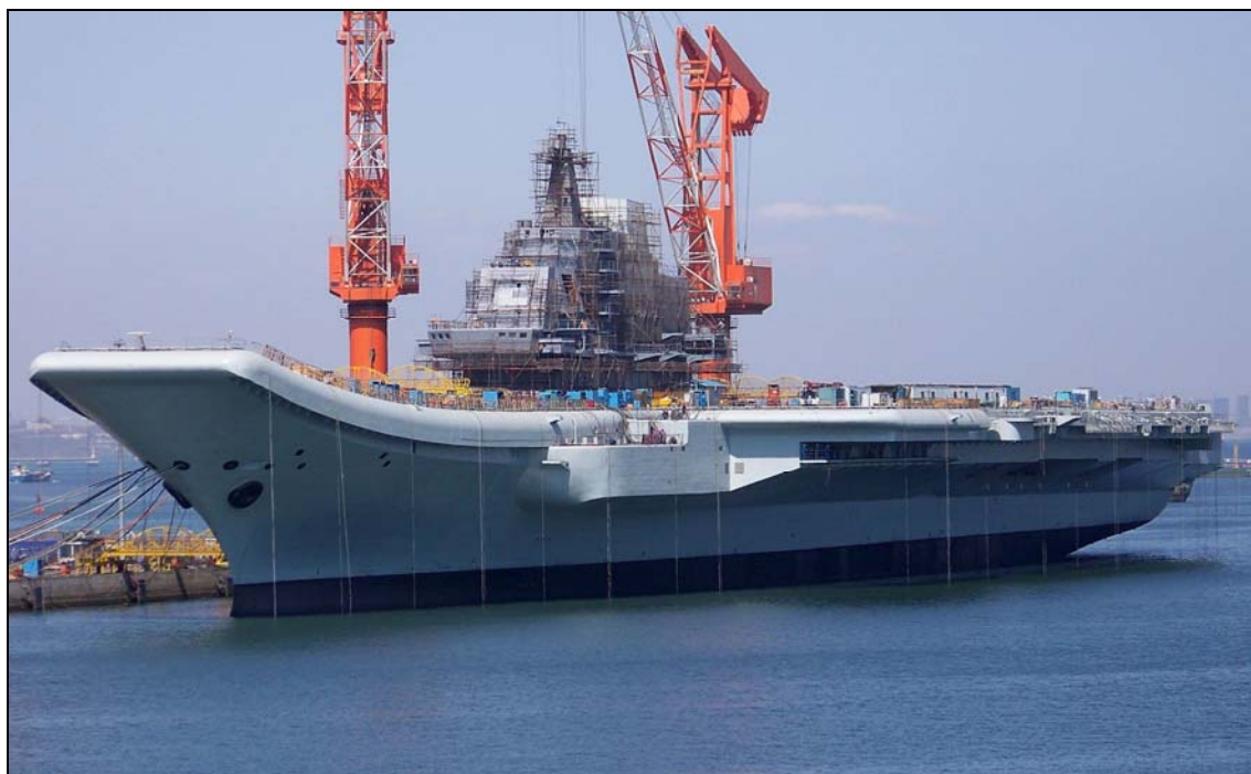
Figure 5. Ex-Ukrainian Carrier Varyag Being Completed at Shipyard in Dalian, China