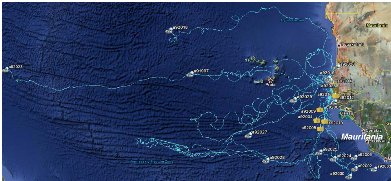
Figure 2. Trajectories of the SVP and CODE drifters in the eastern tropical Atlantic Ocean. Drifter identification numbers are posted at the end of the tracks. For units a92023, a92024, a92025 and a92028 they indicate the drifter positions on 30 September 2010.