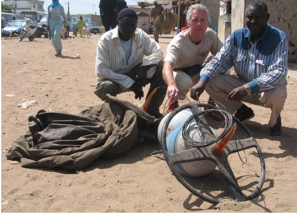
Figure 1. Picture of the P.I. and Senegalese collaborators with two SVP drifters recovered in a fisherman village in early March 2010.