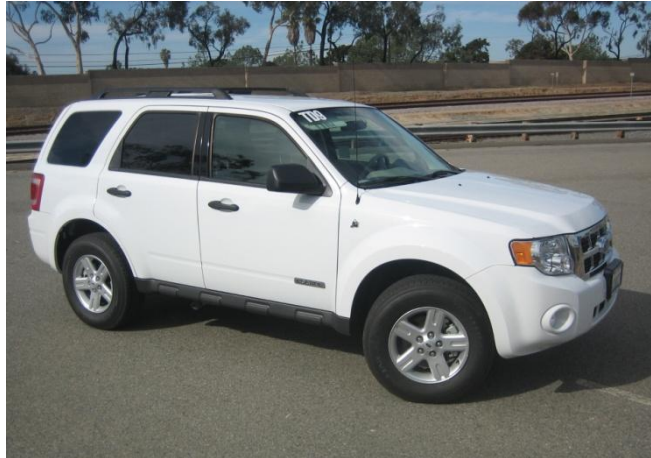
Figure 1 – A H2ICE Vehicle in Hawaii

The ten H2ICE vehicles were the standard model year 2008 Hybrid Gasoline Electric Sport Utility Vehicles (SUV). Figure 1 shows one of the H2ICE vehicles. The H2ICE vehicles have a full hybrid system capable of propelling the vehicle using, electric power, engine power, or both together. The system has an engine shut-off for when the vehicle is stopped and can go full electric up to roughly 25 miles per hour (40kilometers per hour) before the internal combustion engine is started. The standard vehicles underwent a conversion process where the 15-gallon gasoline fuel systems were replaced with type-IV carbon-fiber hydrogen tanks and appropriate fuel lines. The type-IV tanks have a service pressure of 350 bar and were connected in series with check valves that locked the tanks when the vehicle loses power. The replacement hydrogen storage system can hold 3.8 kg of gaseous hydrogen at a pressure of 350 bar.