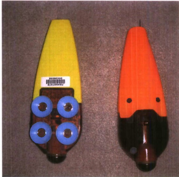
Figure 2. Photograph of two of the four Acousondes.