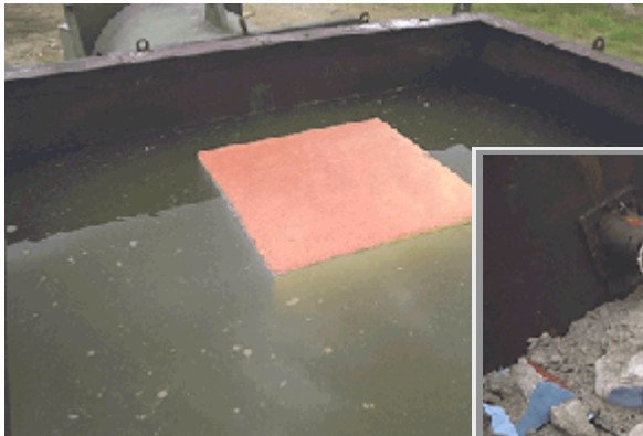
Water Level 1 Inch Below Top Surface