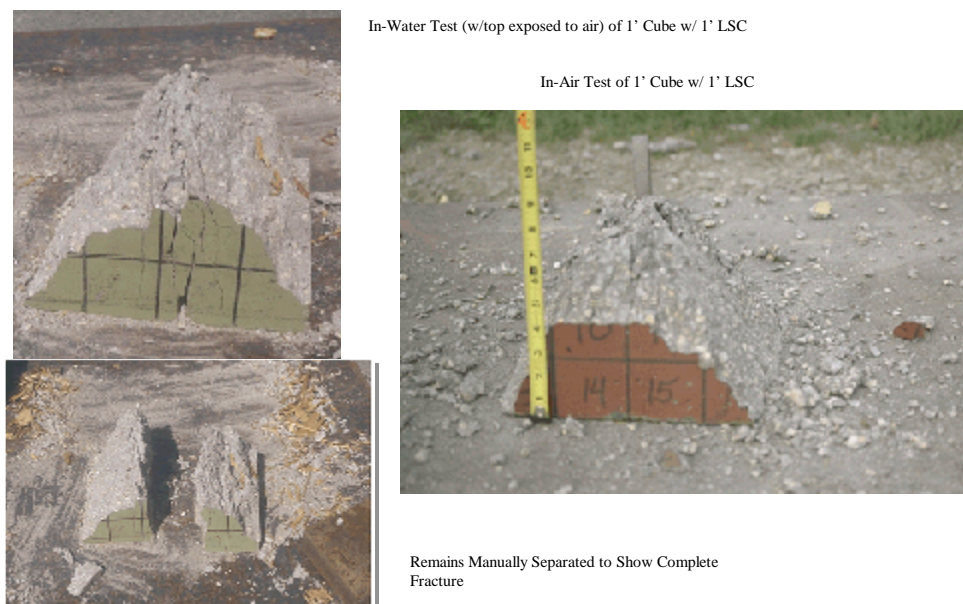
Figure 1. Results of LSC Tests on One-foot Cubes

Renzi, J.R., et al, 1998: "Concrete Obstacle Vulnerability," Naval Surface Warfare Center, Indian Head Division, IHTR 2126, 30 September. (In press.)