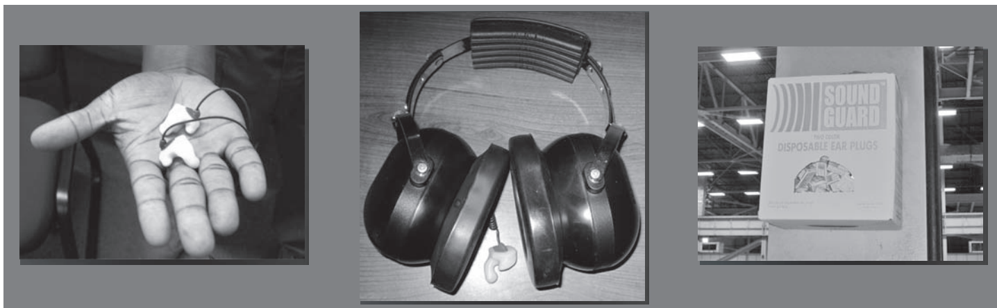
Figure 3: Examples of Hearing Protection Devices

services do not have an up-to-date list of approved equipment that units can choose from when purchasing hearing protection. They also said purchasers have little to no experience with hearing protection and we were told of a unit that, as a result, had purchased personal protective equipment without determining whether it would be effective. Hearing conservation personnel at one of the Army bases we visited recounted a story where one unit deployed using untested hearing protection that was later rejected. In addition, senior DOD officials also told us that some servicemembers bought their own hearing protection equipment that was below the required standards. Finally, we observed that servicemembers themselves are not necessarily using equipment provided to them or are not using the hearing protection equipment properly.