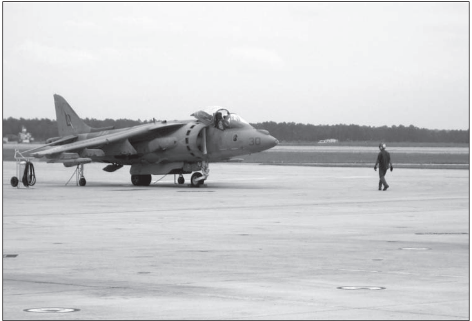
Figure 5: Example of the Proximity of Flight Line Personnel to Military Aircraft