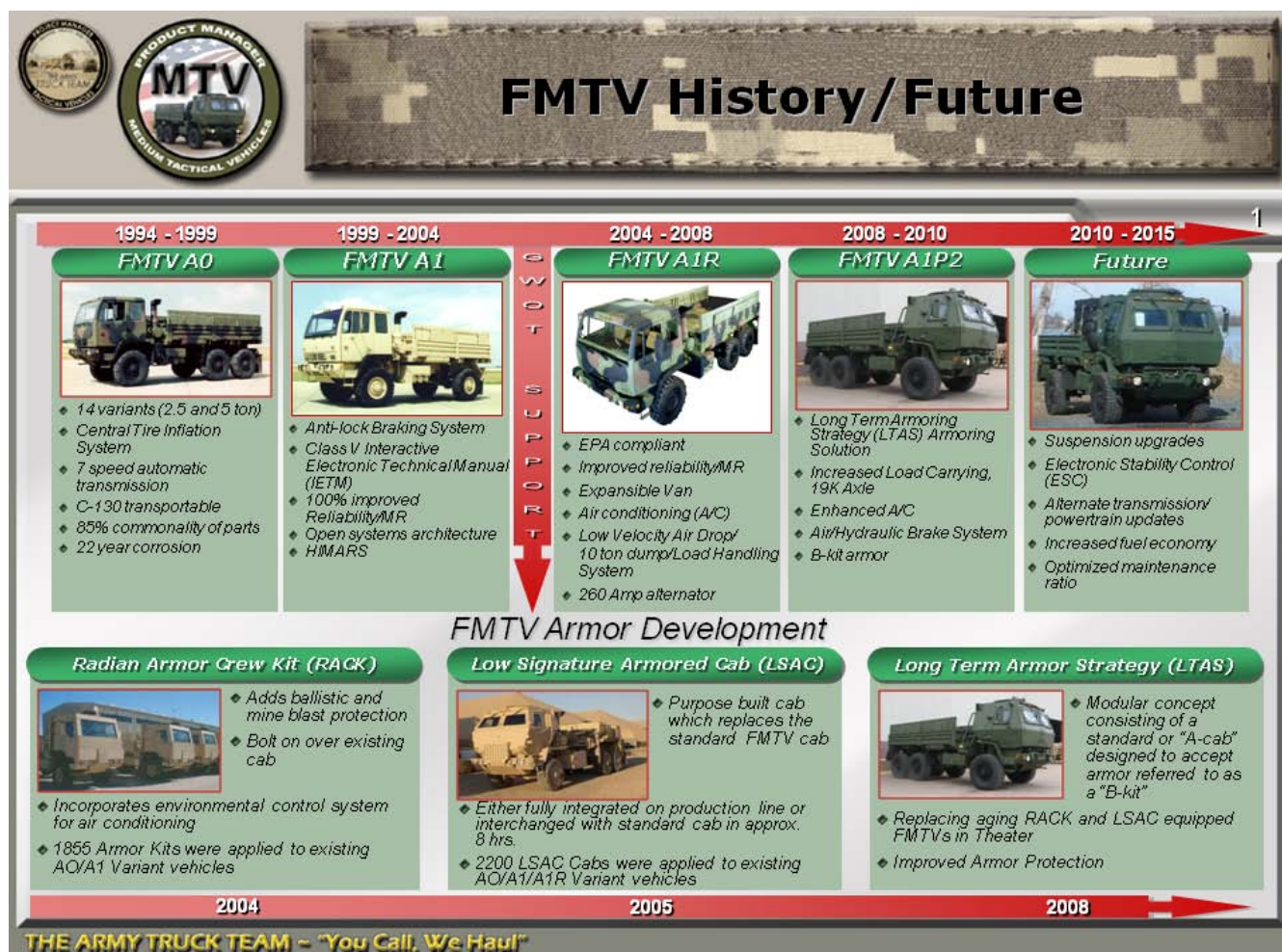
Figure 2. (FMTV Evolution)

Armor solutions and the trucks that they reside on have continued to evolve based on lessons learned from combat. In addition, the 23 June 2005 Joint Requirements Oversight Council Memorandum (JROCM) mandated that all manned vehicles from hence forth would have force protection and survivability Key Performance Parameters (KPPs). Figure 2 shows the evolution of the Family of Medium Tactical Vehicles (FMTVs) for both the truck and armor.