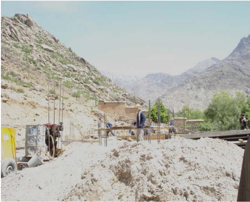
Site Photo 1: View of the challenging terrain where the Abdul Manan School is being constructed. Extensive grading work was required at this site prior to construction.

As part of this initiative, 12 school construction projects have been initiated over the past 18 months in Kapisa Province.