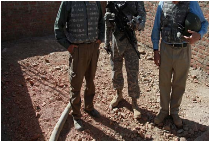
Site Photo 3: View of SIGAR inspectors with the PRT Quality Assurance Representative examining completed work. SIGAR found that the floor of the room had not been compacted to prepare it for the concrete slab-on-grade.