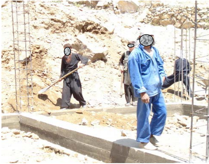
Site Photo 2: Laborers working on the project with no personal protective equipment such as hardhats, gloves or, in some cases, even shoes.