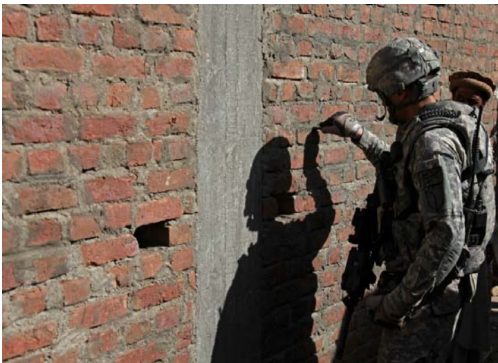
Site Photo 4: View of PRT Quality Assurance Representative testing the mortar work for durability. Such testing is critical to assess if the materials used meet the standards specified in the statement of work. In the case that materials do not meet these standards, the Quality Assurance Representative can order the contractor to redo the work which might involve tearing down already constructed sections of the project.