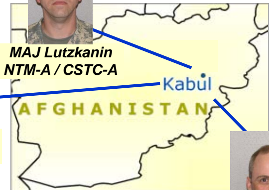
MAJ Lutzkanin NTM-A / CSTC-A