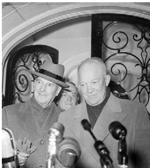
Ike meets the press after his meeting on 17 December 1952 with Douglas MacArthur. Secretary of State Dulles looks on.

The president-elect acted quickly on his campaign pledge to go to Korea, reaching Seoul on 2 December. During the next two weeks, he met with military commanders, Generals