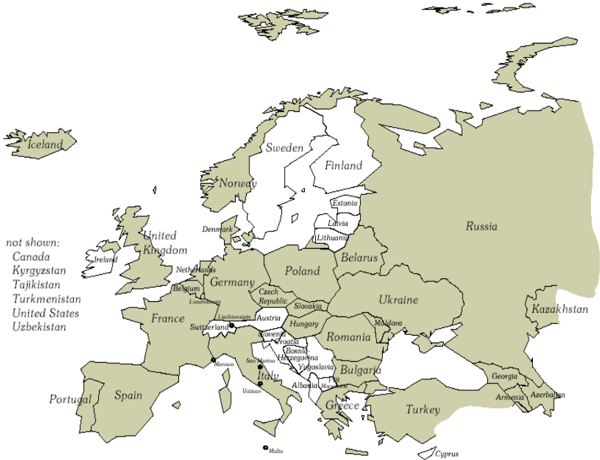
Chart 2: Map of CFE and Non-CFE countries in Europe 60

The Treaty on Conventional Armed Forces in Europe (CFE) remains the largest and, therefore, the most important conventional arms control treaty ever negotiated. The following map shows the signatories to the treaty.