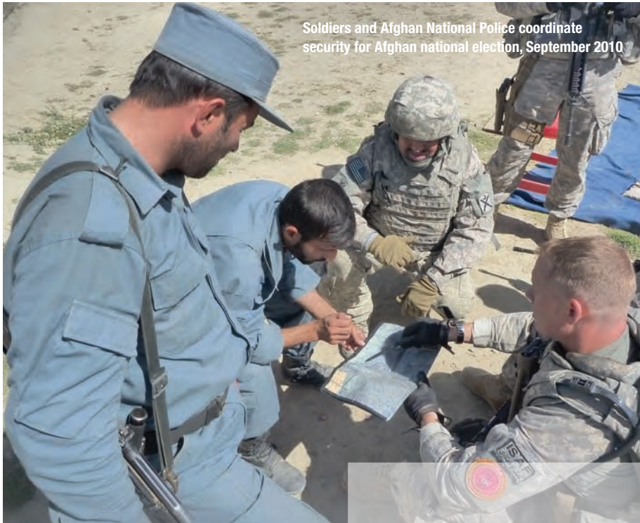
Soldiers and Afghan National Police coordinate security for Afghan national election, September 2010