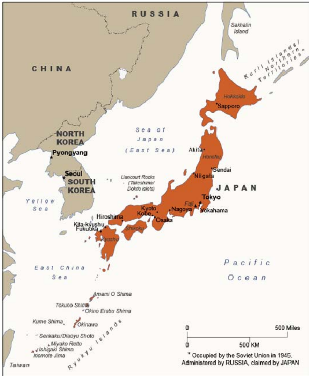
Figure 1. Map of Japan

Congressional powers, actions, and oversight form a backdrop against which both the Administration and the Japanese government must formulate their policies. In the 111 th Congress, Members' attention to Japan may be most concerned with the status of the military alignment plans in the region. In the 109 th and 110 th Congress, hearings and legislation concerning Japan focused on thorny history issues as well as the U.S. beef import ban.