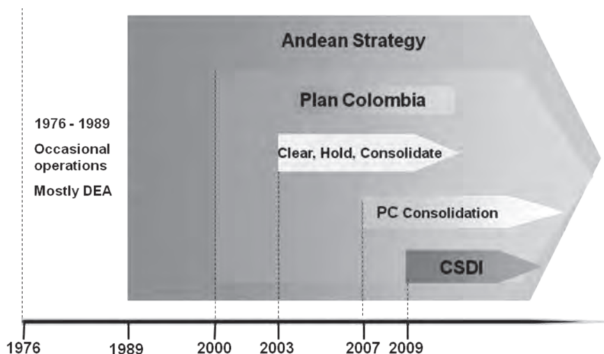
Figure 3-1. Timeline and Key USG-Colombia Strategies. 15

that have a stable security situation and an increased government presence in the form of police stations and small courts, the USAID takes the lead in providing necessary support to set up economic and community development projects alongside Colombian ministries and regional actors (see Figure 3-1).