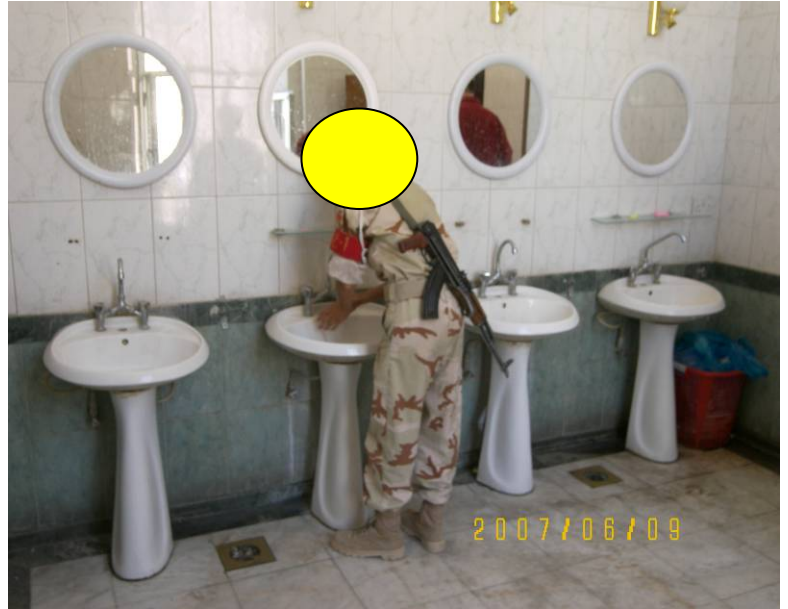
Site Photos 11 and 12. Newly installed toilets and sinks within the MOD HQ bathrooms

According to the contractor, prior to the installation of the WWTP, all waste water leaving the MOD HQ building was deposited directly into the Tigris River. In order to avoid continuing the practice of depositing untreated waste water into the Tigris River, the contractor-provided packaged WWTP appears to meet the MOD's needs in terms of total waste water volume. This packaged WWTP, located outside the MOD HQ building, captures and treats the waste water before it is discarded into the Tigris River. The design required that a wet-well collect all waste water from the entire building and a sewage lift station, with properly sized mechanical components and pipes, delivers effluent to the packaged WWTP for treatment. We inspected the installed packaged WWTP (Site Photo 13). We did not observe any abnormalities in the present operation of the WWTP nor did the WWTP exhibit any signs of malfunction. The WWTP appeared to be fulfilling its intended operational goals. According to the contractor's site photos, it appears the MOD personnel are performing adequate maintenance on the WWTP (Site Photo 14). Continual maintenance of the WWTP will prolong its life expectancy and effectiveness.