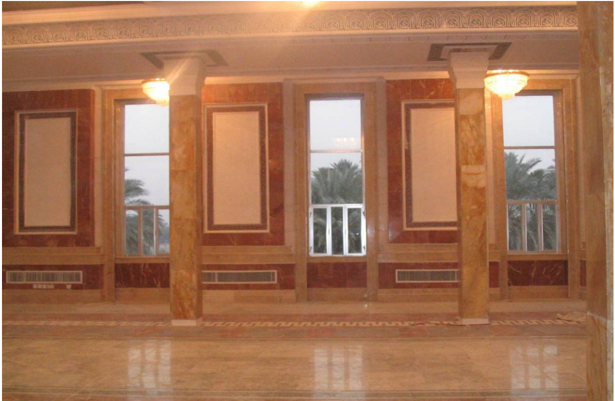
Site Photo 16. A finished interior ballroom within the MOD HQ building

According to the contractor and MOD officials, the current usage of the building far exceeds the original intent of providing working space for approximately 450 MOD personnel. It is currently estimated that more than 3,000 MOD personnel now work in the MOD HQ building on a daily basis. However, accommodations for the additional MOD personnel were made without major disturbance to the contractor's work. For example, large ballrooms were turned into office space through the use of cubicles (Site Photo 22).