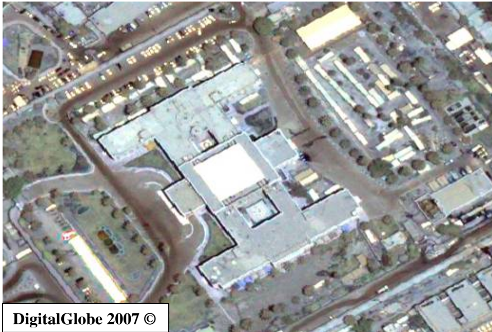
Aerial Image 1. Aerial view of MOD HQ complex

The renovation project was intended to provide working space for approximately 450 MOD personnel. The facility was occupied by MOD personnel during our site assessment.