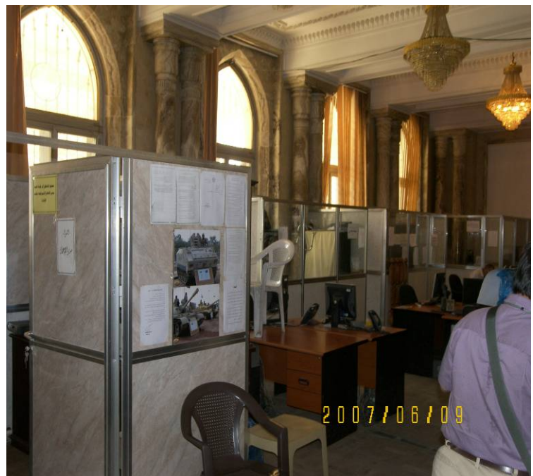
Site Photo 22. Interior ballroom turned into additional office space through the use of cubicles