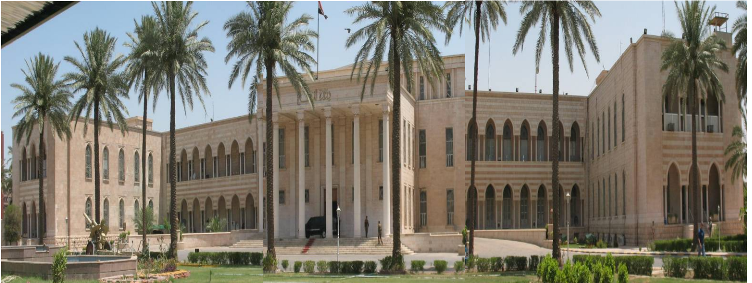
Site Photo 10. Exterior view of the renovated MOD HQ building

a representative of the contractor, Laguna Construction. During our site visit, we observed MOD HQ personnel conducting day to day business within the facility.