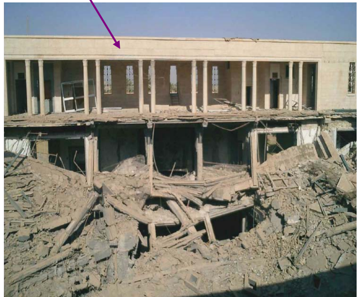
Site Photos 1 and 2. Interior and exterior JDAM bomb damage to the MOD HQ building