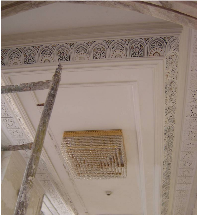
Site Photo 19. Installation of new ceiling tiles and fixtures