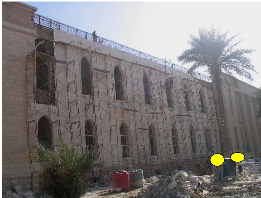
Site Photo 9. Near completion of the left wing of the MOD HQ building