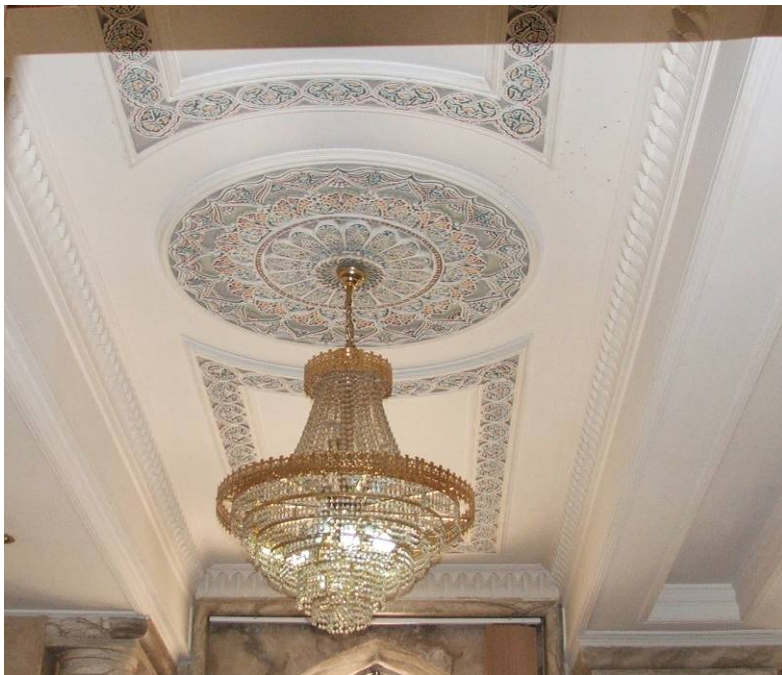
Site Photo 21. Ceiling tile and light fixture