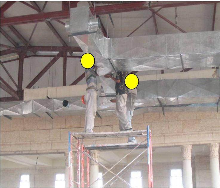
Site Photo 5. Installation of air conditioning duct work