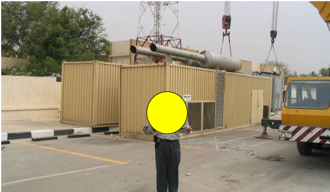
Site Photo 15. Contractor repositioning the refurbished two 2-MW generators

We inspected the MOD HQ building's major support systems, such as lighting, data and voice communication, HVAC, water pumps, and WWTP, all of which appeared to be functioning adequately. The primary source of all MOD HQ building power is the Baghdad power grid; however, it is also supported by two 2-Megawatt (MW) generators and other lesser capacity generator sets. The contract required the refurbishment of two existing large generators, which were successfully commissioned with the required automated controls and transfer switches (Site Photo 15). At the time of our visit, the MOD HQ building was operating off of the Baghdad power grid; consequently, we were unable to observe the functioning of special controls and transfer switches that bring the generators on line. However, MOD personnel stated that the generators and transfer switch system were operational and continuously used when the Baghdad power grid was down 1 .