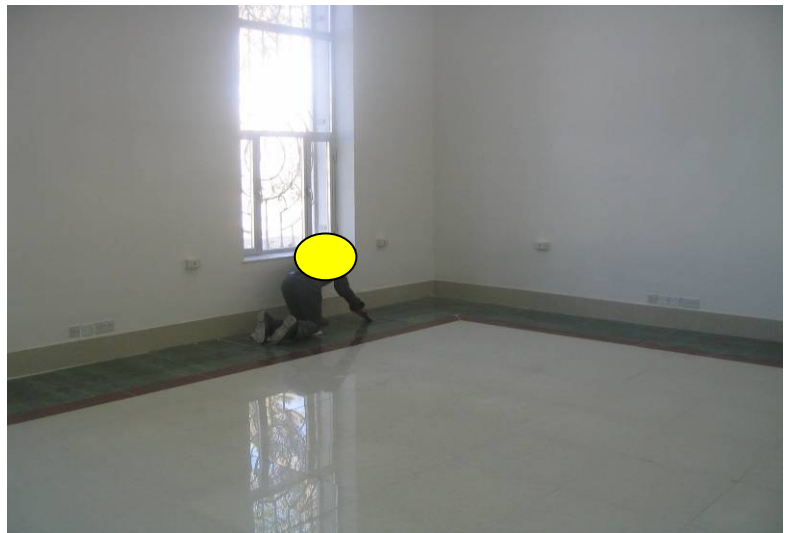
Site Photos 17 and 18. Quality workmanship done to the interior of the MOD HQ building