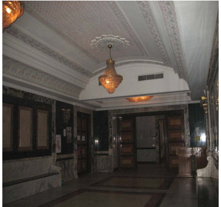
Site Photo 20. Newly renovated ceiling