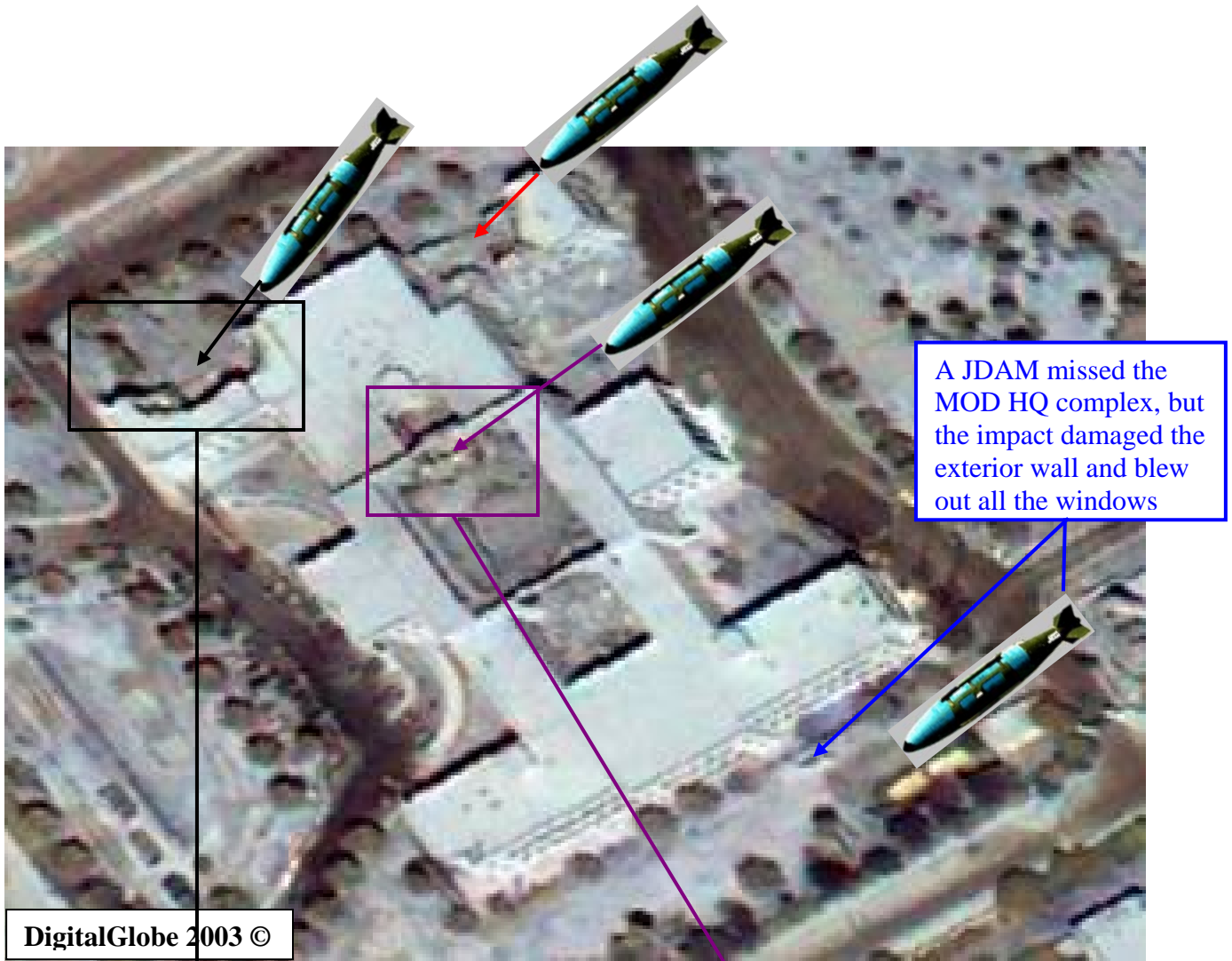
Aerial Image 2. Aerial view of 2003 JDAM bombing damage to the MOD HQ building