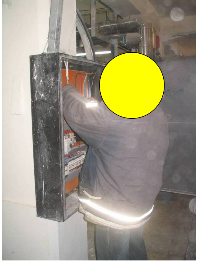
Site Photos 3 and 4. Installation of electrical wiring in the MOD HQ building