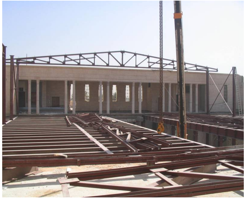
Site Photo 6. Construction of the third floor