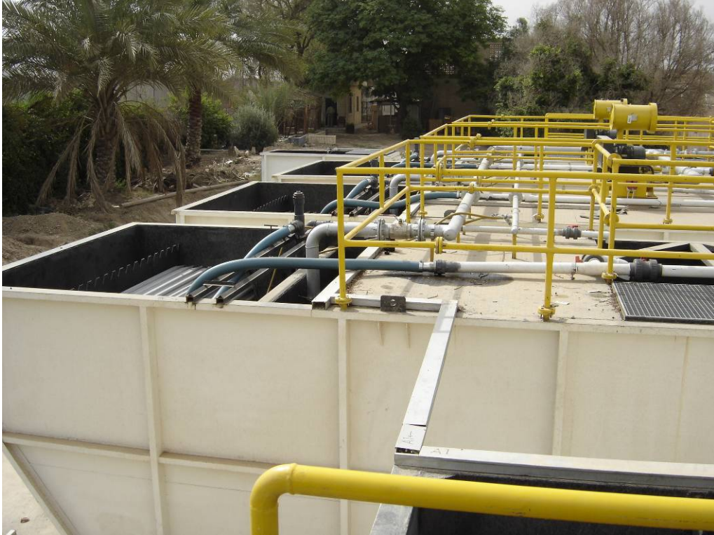
Site Photo 13. Packaged WWTP outside the MOD HQ building