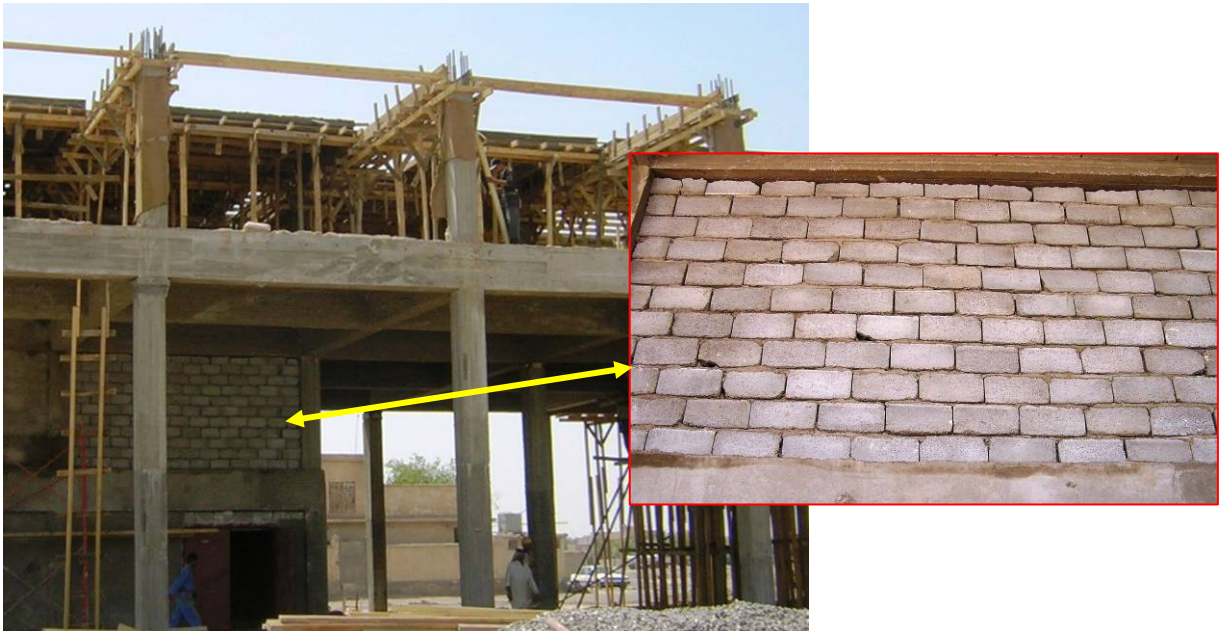
Site Photo 9. Block wall on mezzanine level

During the course of construction, the USACE QAR did identify poor workmanship in constructing one of the exterior walls. According to the Quality Assurance (QA) Deficiency Log, the wall shown in Site Photo 10 was identified as a problem in December 2005. Two weeks later, the deficiency had been corrected and the wall replaced.