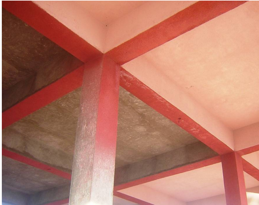
Site Photo 6. Reinforced columns and beams supporting level 3