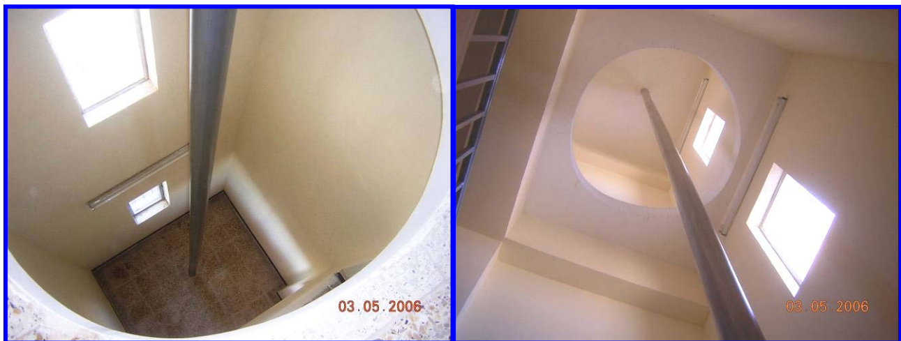
Site Photo 12. Top and bottom perspective of the fireman's pole

Another architectural feature in the building inherent with fire stations is the fireman's pole. The contractor's design showed a four inch diameter steel pole to provide direct access to the ground floor level from the living areas on the third level. Site Photo 12 shows two perspectives of the completed fireman's pole and the opening through the floor slab.