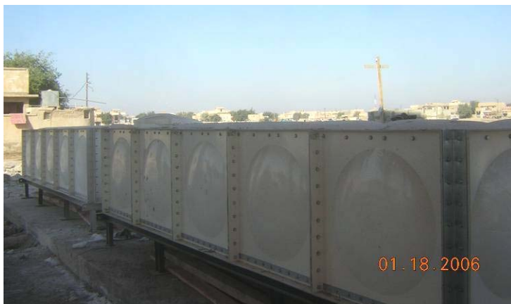
Site Photo 13. Surface level 10 m^3 water tanks

The contract design required two water storage tanks, each with a capacity of 10 cubic meters ( m^3 ) to be constructed at the ground level on one side of the station. In addition, the design included eight, one m^3 roof top water tanks. Through a review of the construction progress photos, we verified the installation of the two ground level tanks, and five roof top tanks, although we could not determine their capacity. Site Photos 13 and 14 show the two types of water tanks installed at the fire station.