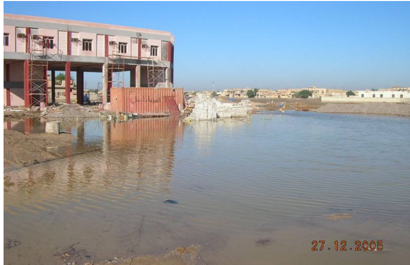
Site Photo 1. Standing water on the front side of the of the fire station

plain and the topography of the fire station site is level. The site does not drain very well since it is relatively flat. Site Photo 1 shows standing storm water runoff in front of the fire station site. The city street is located approximately 125 meters (m) away from the fire station.