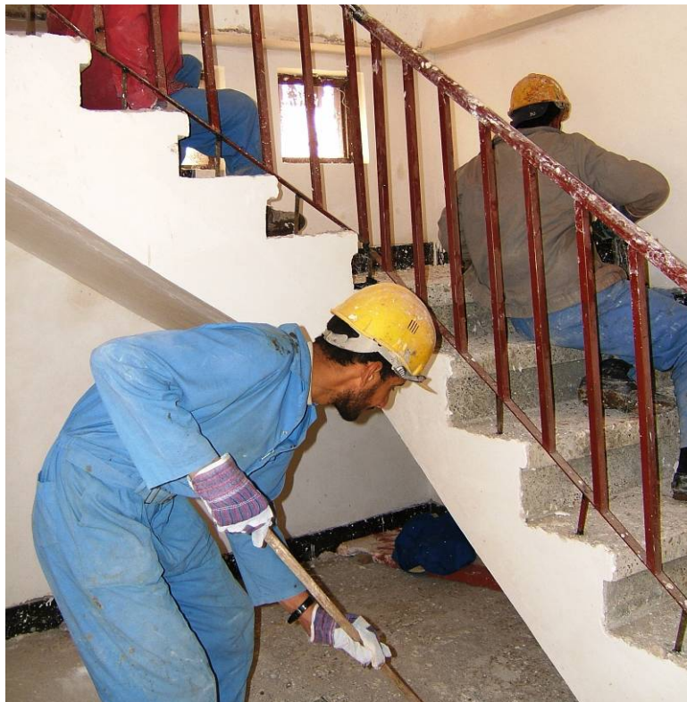
Site Photo 7. Concrete stairs at ground level