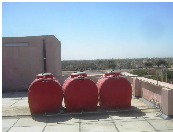
Site Photo 14. Roof top water tanks

The design drawings showed a third level locker room for males with space for lockers, as well as five toilets, five wash basins, and five showers. In addition, the design included a mezzanine level female locker room that included lockers, two washbasins, and two toilets. On the third level, the fire chief's bedroom contained a bathroom with a washbasin and toilet. Based on the review of the QA reports and the QA deficiency log, there were no issues regarding the construction of the bathroom and shower facilities, including the plumbing and installation of the bathroom fixtures.