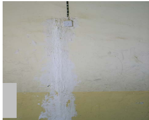
Site Photo 18: Patching of wall at Project 10630