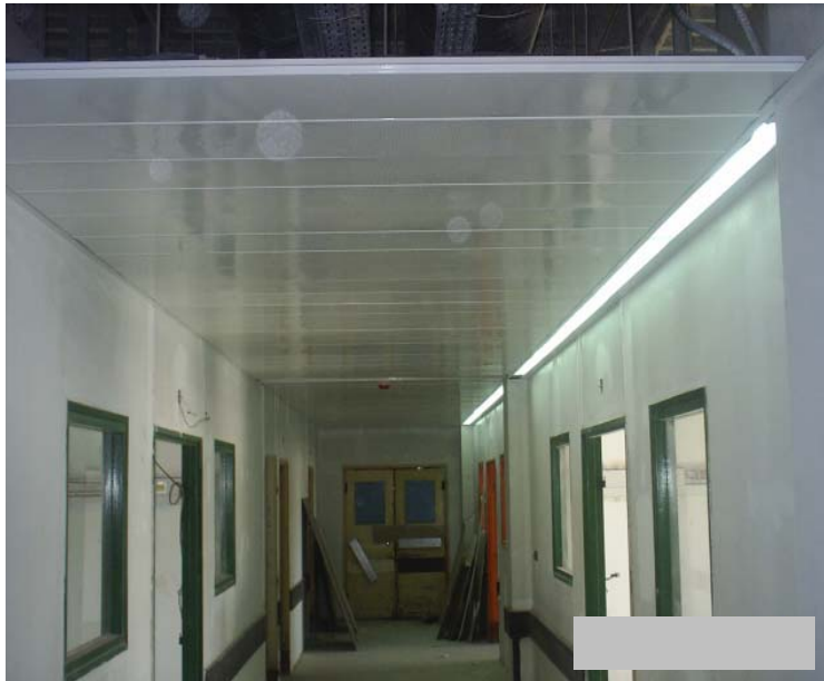
Site Photo 20: Renovated hallway at Project 10318

throughout the facility. Site Photo 20 shows a renovated hallway. Construction of a new sewer is underway; however, there were concerns about the elevated groundwater level and the direction of drainage relative to the road.