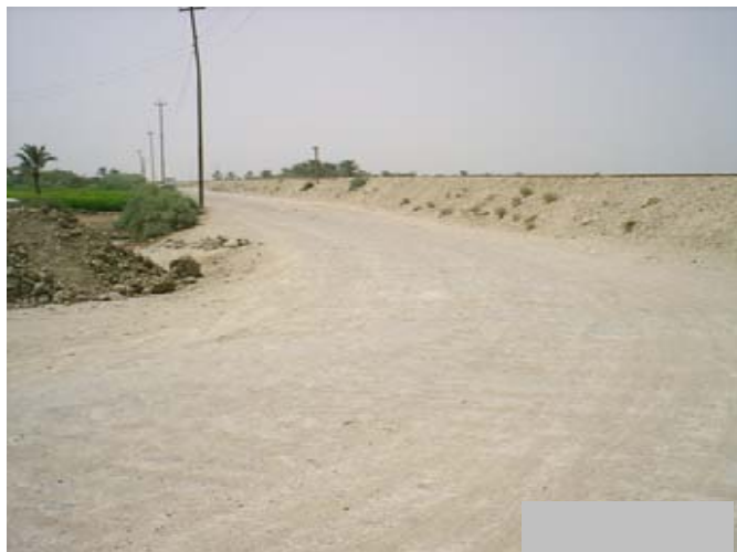
Site Photo 55: Road surface at the location of Project 17867

Although the IRMS database listed the project as 100 percent complete, the site visited by the survey team was not a completed road. The site visited was within 725 m from the reported location and intersected the location of the road as shown in the contract. The site visited consisted of 3.5 km of road, with recent sub base installed and no culverts or shoulders. No section of road contained any asphalt pavement. Site Photo 55 shows new road base at the location of Project 17867.