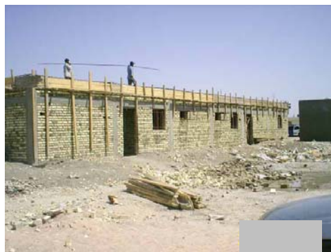
Site Photo 52: Building under construction at Project 20347

The IRMS database listed the project as 68 percent complete on 10 September 2005. New construction and renovation of buildings was in progress at the time of the site visit. Buildings were in different stages of completion from initial framing to nearly complete. The perimeter appeared complete with concertina wire, entrance gates, and guard towers. Several buildings showed installation of interior electrical components and lights, although the electrical system was not completed. We did not note any significant deficiencies. Site Photo 52 shows a building under construction and Site Photo 53 shows the perimeter security wall and guard tower at Project 20347.