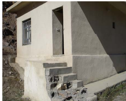
Site Photo 12: Concrete steps at Project 20569