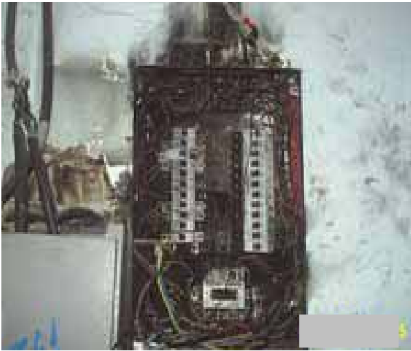
Site Photo 28: Electrical circuit breaker panel at Project 18223