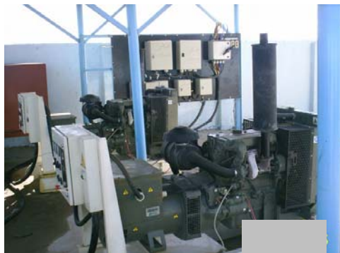
Site Photo 42: Two 30 kVA generators at Project 19220