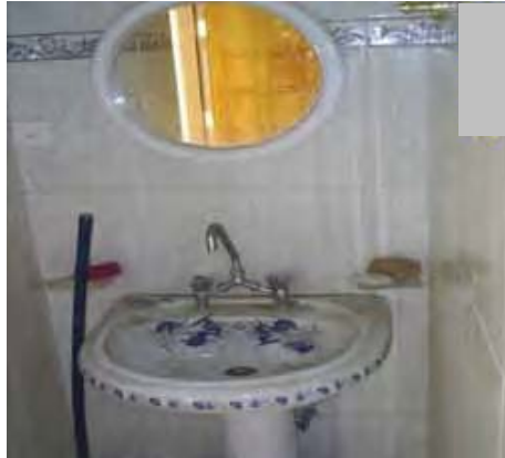
Site Photo 44: Interior bathroom fixtures at Project 19221

The IRMS database listed the project as 100 percent complete on 20 August 2005. The construction appeared complete at the time of the site visit. The site contained perimeter security walls with entrance gates and the main building included guard towers and security lighting. Two 30 kVA generators were located on site. Nine security checkpoints with jersey barriers were located outside of the perimeter walls along the roadway. The quality of materials was good, and the installation of the plumbing and tile appeared professional. The QCQA team learned during the site visit that there were some problems with the generator and external lighting. Site Photo 44 shows interior bathroom fixtures and Site Photo 45 shows tile work at Project 19221.