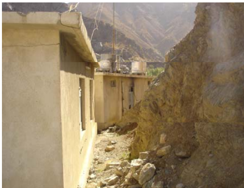
Site Photo 11: Behind border post at Project 20569