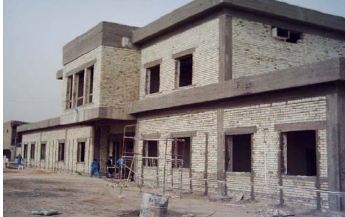
Site Photo 21: Exterior front of Project 11897