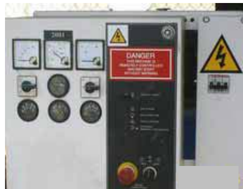
Site Photo 31: Generator electrical panel at Project 18243