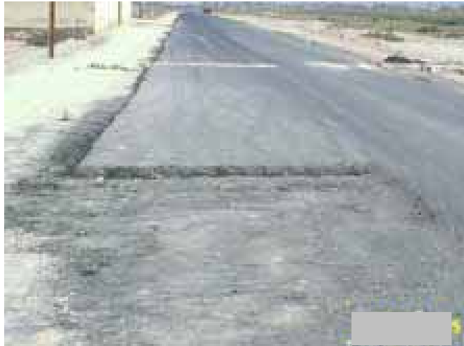
Site Photo 54: Asphalt surface of Project 17783