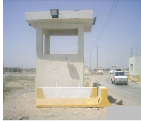
Site Photo 41: Checkpoint at Project 19218