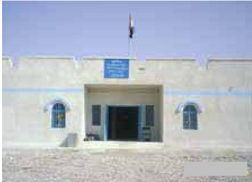
Site Photo 1: Exterior view of Project 12137 Border Denial Post