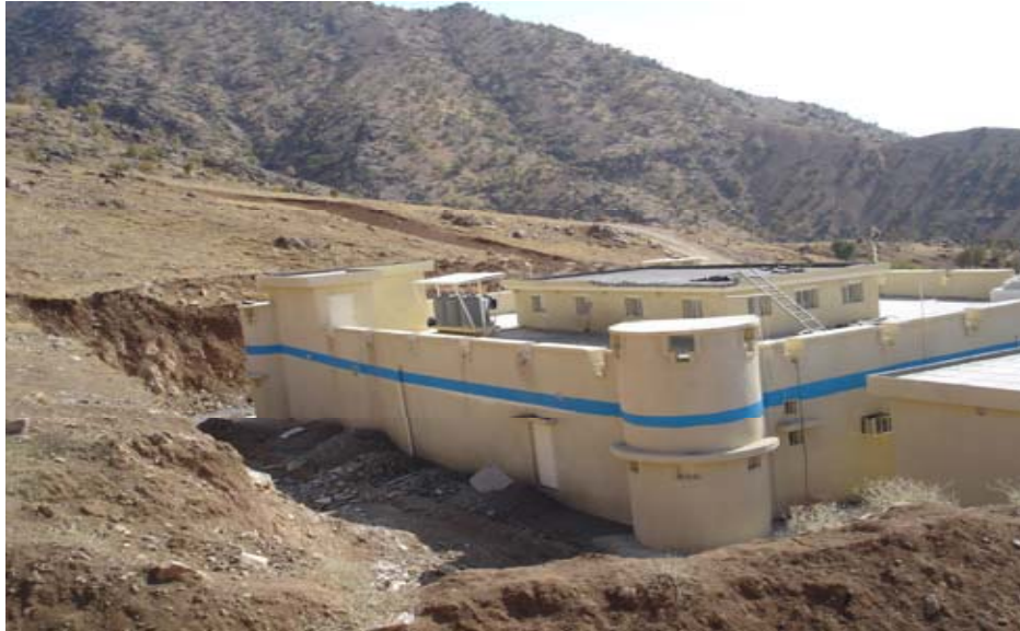
Site Photo 5: Cut bank with no stabilization Project 12800