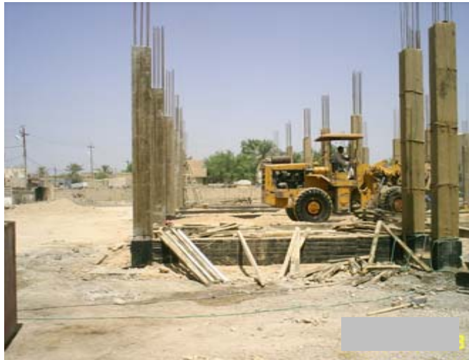
Site Photo 22: Construction of columns and footers at Project 11941

The project was in-progress at the time of the site visit. The QCQA teams observed completed concrete footers and ground level reinforced concrete columns. Burlap surrounded several columns, presumably used to keep the surface moist for curing purposes. Several construction workers were on site during the site visit. Site Photo 22 shows construction of columns and footers.