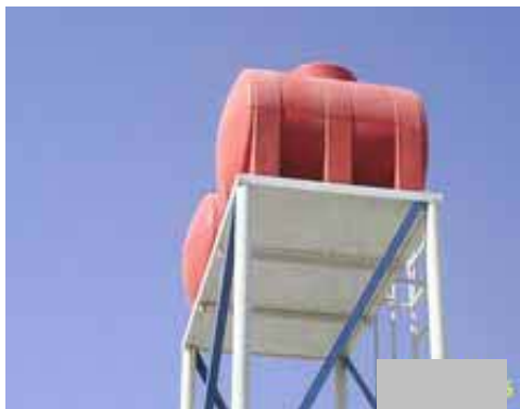
Site Photo 30: Water tanks installed on tower at Project 18243

The IRMS database listed the project as 100 percent complete on 3 May 2005. The site contained a perimeter security wall and gates, along with a generator with what appeared to be a correctly installed modern circuit breaker box and system. The site also contained a completed steel frame constructed parking area with a corrugated roof and elevated water tanks located on the roof on top of a tower. We observed some deterioration of plastering on exterior surfaces of the facility but did not note any significant deficiencies. Site Photo 30 shows water tanks installed on towers and Site Photo 31 shows the generator electrical panel at Project 18243.