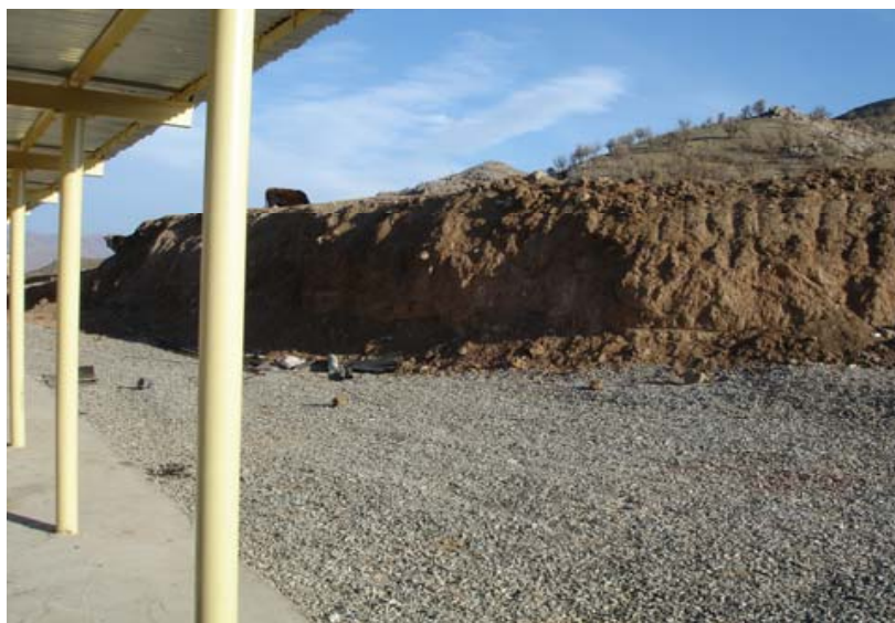
Site Photo 4: Cut bank with no stabilization Project 12787