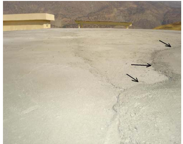
Site Photo 7: Concrete atrium roof showing uneven texture at Project 12840