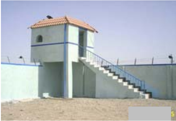
Site Photo 34: Perimeter Security wall with concertina wire and guard post at Project 18268