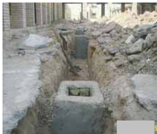
Site Photo 57: Manholes and excavation at Project 21251