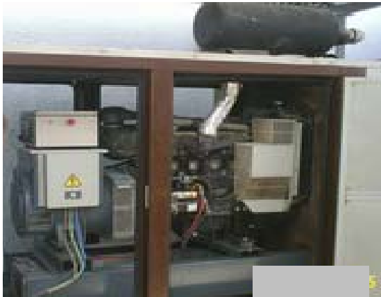
Site Photo 36: Generator at Project 18273