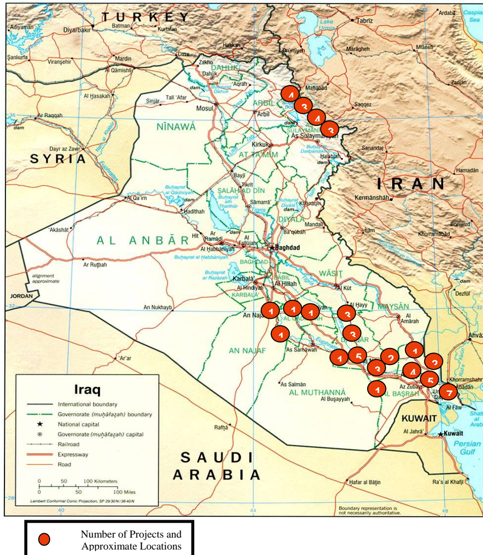
Figure 1: Iraq map indicating selected Ground Project Survey sites