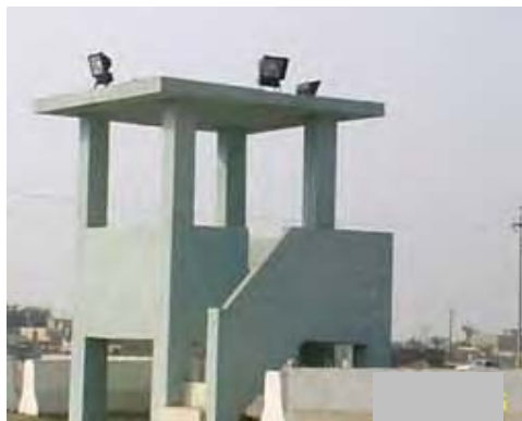
Site Photo 46: Checkpoint at Project 19222