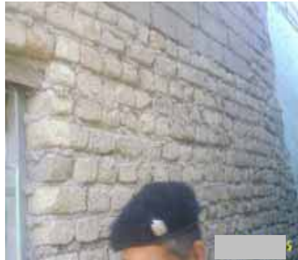
Site Photo 29: Unfinished exterior wall at Project 18223