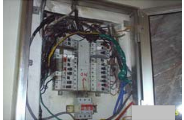
Site Photo 35: Electrical circuit breaker panel at Project 18268