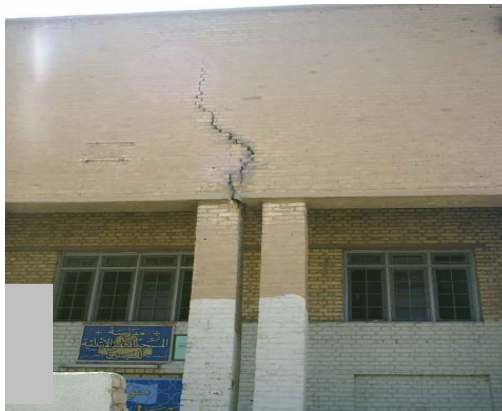
Site Photo 17: Crack in outer wall of Project 10630