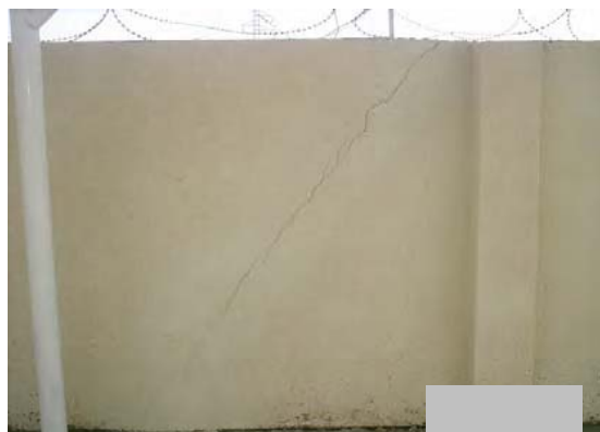
Site Photo 39: Cracks in perimeter security wall at Project 19217