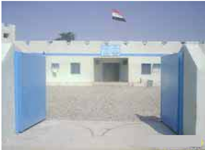
Site Photo 3: Front entrance gate and border post Project 12161

A review of the report and photos provided by the QCQA teams determined that overall, the site associated with Task Order 0034, Project 12161, appeared to be complete and consistent with contract requirements. A perimeter wall surrounded the post, containing the parking area and above ground fuel tank. In addition, there were security bars on the first floor windows and a security cage enclosed the generators. The site also contained above ground water tanks, set on a concrete base, with additional water tanks located on the roof. A septic tank appeared to be located between the berm and outer wall of the post. Site Photo 3 shows the front gate and border post.