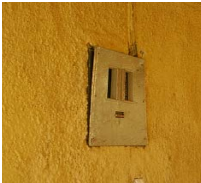
Site Photo 13: Electrical circuit breaker panel at Project 10588