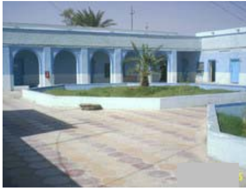
Site Photo 32: Courtyard at Project 18248