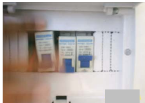
Site Photo 43: Circuit breakers at Project 19220