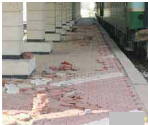
Site Photo 56: Installation of brickwork at Project 21251