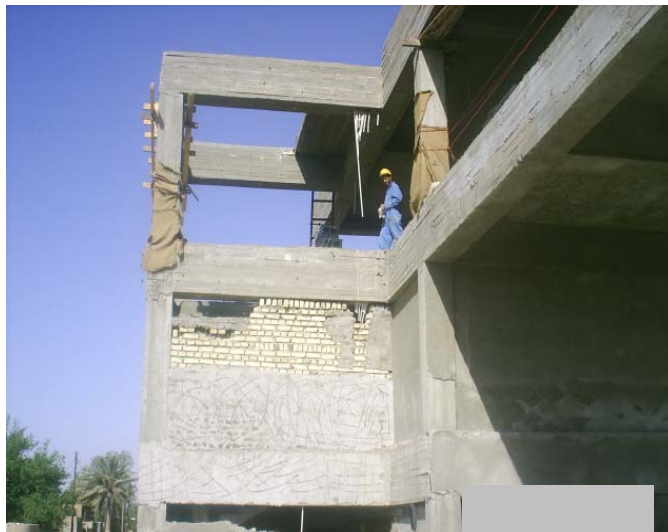
Site Photo 25: Project 10072 under construction

Construction of the facility was on-going at the time of the site visit. The QCQA team observed constructed structural concrete columns, beams, and elevated slabs on the ground, first, and second floor. Several columns were wrapped with burlap, presumably for curing purposes. Review of photos showed no areas of segregation, although we did not document the entire facility. Interior and exterior block walls were partially complete with external plastering in progress. Installation of window frames on the first floor rear of the building was on-going. We noted no discrepancies. Site Photo 25 shows Project 10072 under construction.