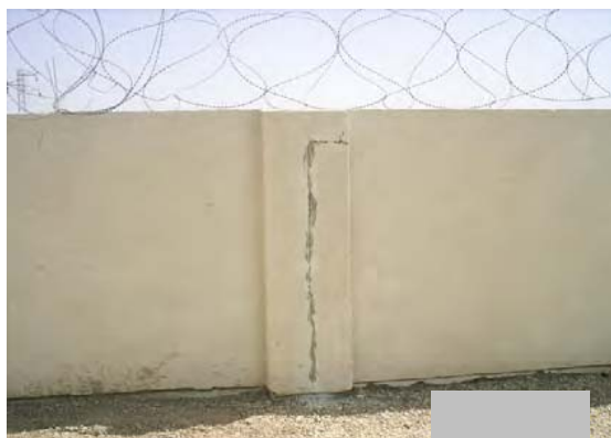
Site Photo 38: Cracks in perimeter security wall at Project 19217