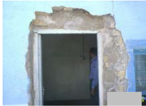
Site Photo 33: Exterior doorway with incomplete finishing work at Project 18248