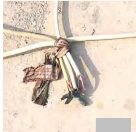
Site Photo 49: Electrical wires without proper connections at Project 19223