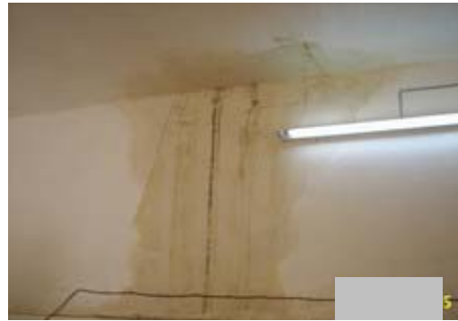
Site Photo 27: Interior staining due to roof leak at Project 18223