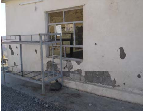
Site Photo 9: Exterior wall at project at Project 20568