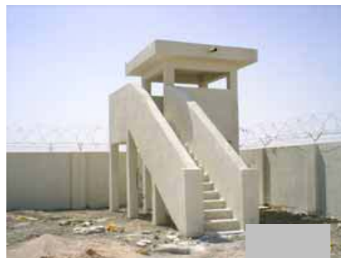
Site Photo 53: Perimeter security wall and guard tower at Project 20347