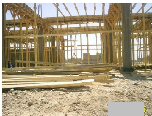
Site Photo 23: Form work at Project 11943