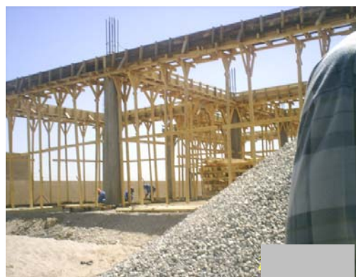
Site Photo 24: Aggregate stockpile at Project 11943