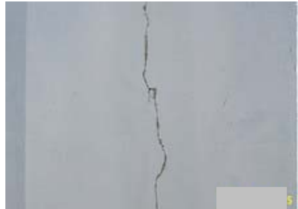
Site Photo 37: Cracks in exterior wall at Project 18273