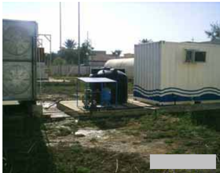
Site Photo 19: Containerized reverse osmosis unit with exterior pumps and storage tanks at Project 1270