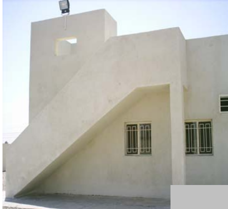
Site Photo 40: Exterior of building at Project 19218