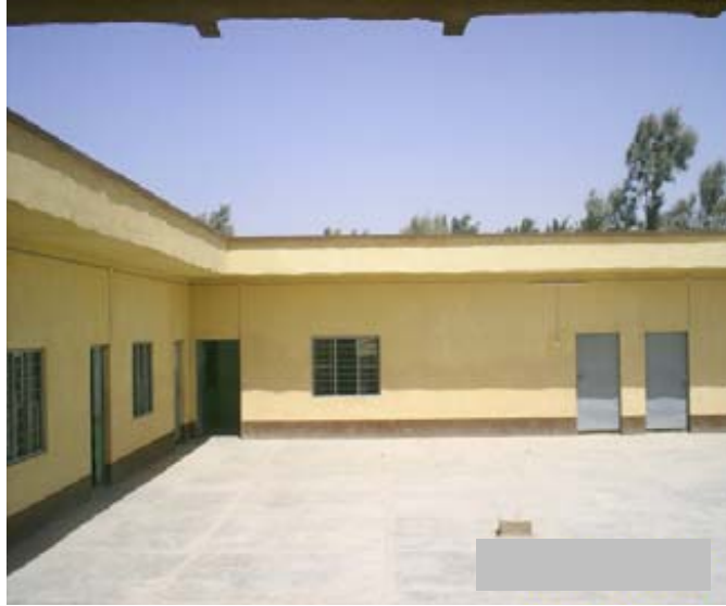
Site Photo 14: Concrete courtyard at Project 10613

With the possible exception of a new concrete area outside, recent renovations were not obvious. Site Photo 15 shows the concrete courtyard area. We noted the following discrepancies: