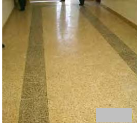
Site Photo 45: Interior tiles at Project 19221