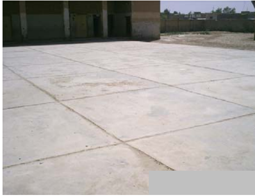
Site Photo 15: Concrete courtyard at Project 10630