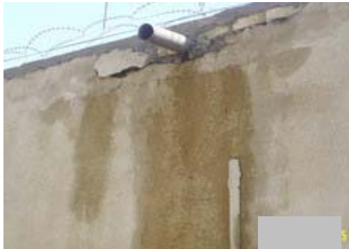
Site Photo 26: Exterior roof drain and deteriorated parapet at Project 18223