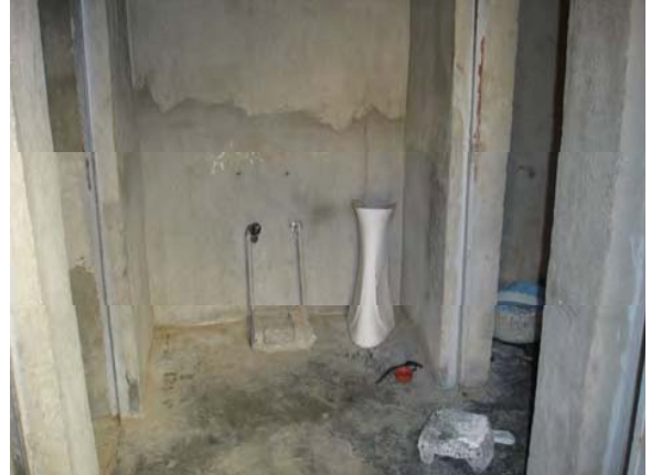
Site Photo 10: Bathroom fixtures at Project 20568