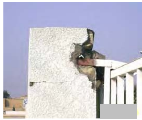
Site Photo 47: Wall damage at Project 19222