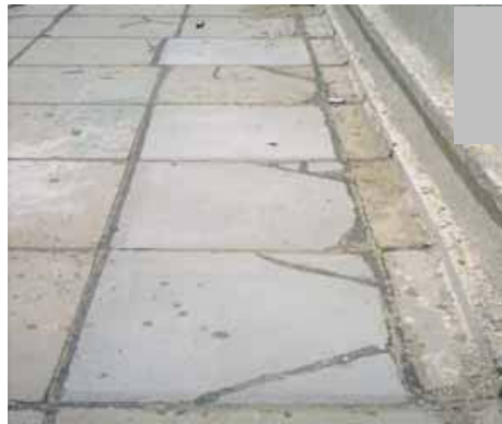
Site Photo 50: Broken roof tiles at Project 20333