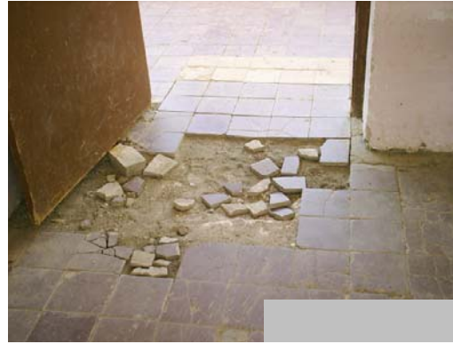
Site Photo 16: Broken tiles at Project 10630