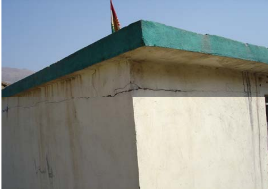
Site Photo 8: Cracks in exterior wall at Project 20565