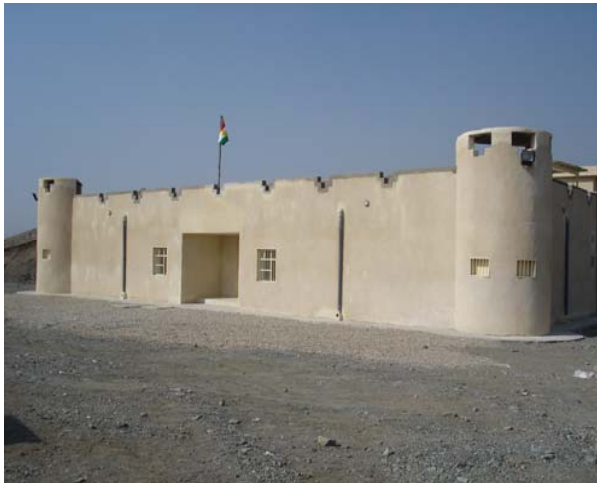
Site Photo 6: Front view of Project 12840