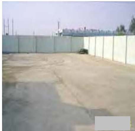
Site Photo 48: Perimeter security wall and concrete pad at Project 19223