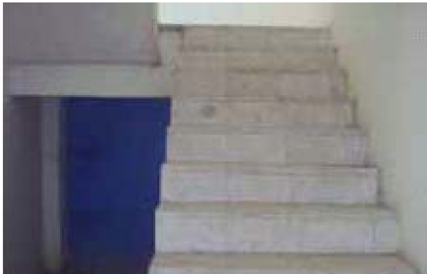
Site Photo 2: Interior stairwell without handrails at Project 12144