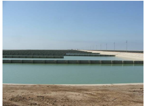
Site Photo 22. Settling basins