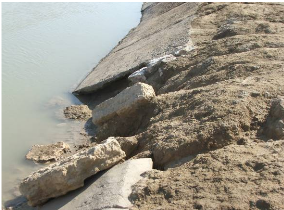
Site Photo 13. Example of concrete liner failure at km 168 repair area