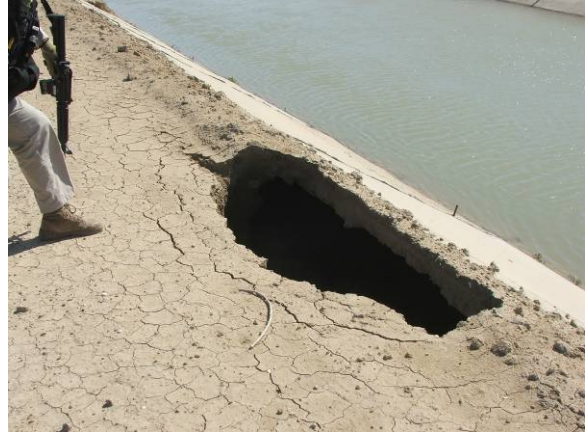
Site Photo 8. Example of under-cutting of canal