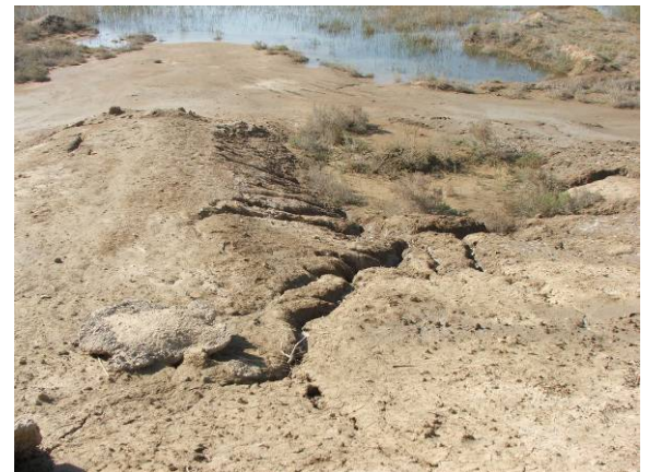
Site Photo 16. Surface erosion of canal banks at km 188 repair area