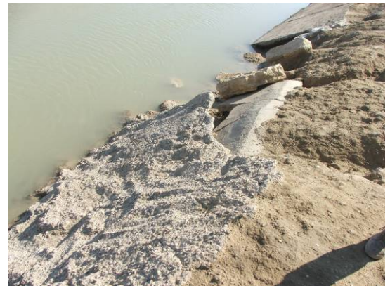
Site Photo 14. Repair of concrete liner with concrete slurry at km 168 repair area