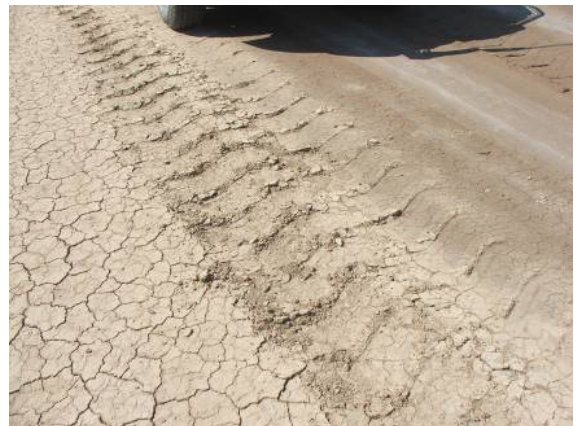
Site Photo 19. Recent tire tracks from heavy equipment vehicle