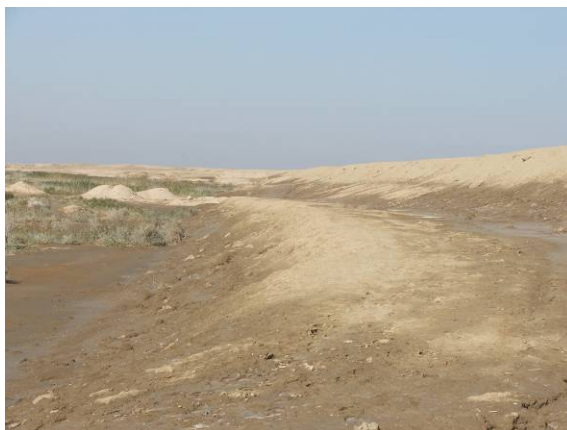
Site Photo 15. km 188 repair area