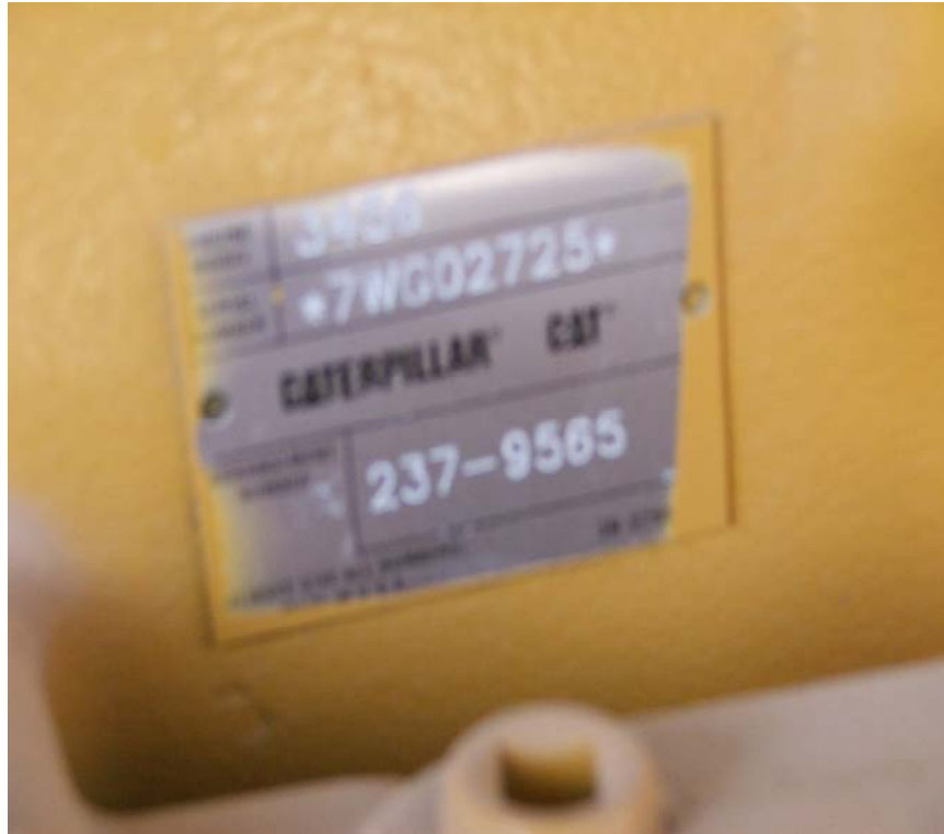
Site Photo 19. Engine Block Factory Nameplate