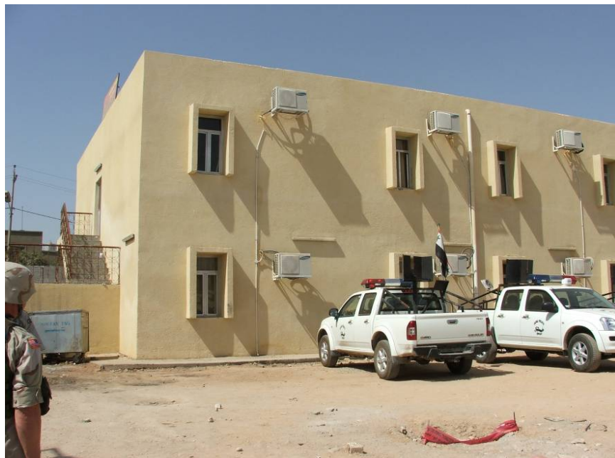
Site Photo 1. Exterior Front of Two-Story Sleeping Quarters Building

The contract and design required the construction of a two-story facility with reinforced concrete footings, reinforced concrete slab, reinforced concrete columns and beams, and stucco over block exterior. The building design required a 28.78 M (94 feet (ft)) by 13.66 M (50 ft) facility with two external stairways, one on each end of the building. Each floor included three large open rooms and a common lavatory. The contract required the facilities to include A/C units. The site visit verified the building was constructed and currently occupied. We observed the A/C, lights, and fans to be operational. For an illustration of the external front of the two-story sleeping quarters building, see Site Photo 1.