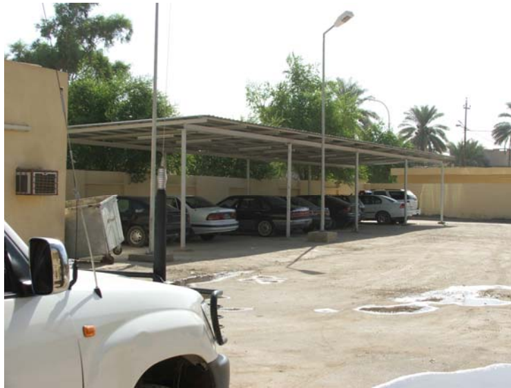
Site Photo 16. Eight-Bay Carport Located Adjacent to Main Entrance

The contract and design required the construction of two covered areas for automobile parking: one 16-bay and one 10-bay carport. During the site visit, we verified that four covered metal-framed carports were located on site, all of which appeared to be new construction. A single eight-bay carport was located adjacent to the Vehicle Affairs building, and another eight-bay carport was located adjacent to the main entrance. Two additional carports were also located near the front entrance. During the site visit, we noted no discrepancies of the carport steel frame construction. For an illustration of the eight-bay carport located adjacent to the main entrance, see Site Photo 16.