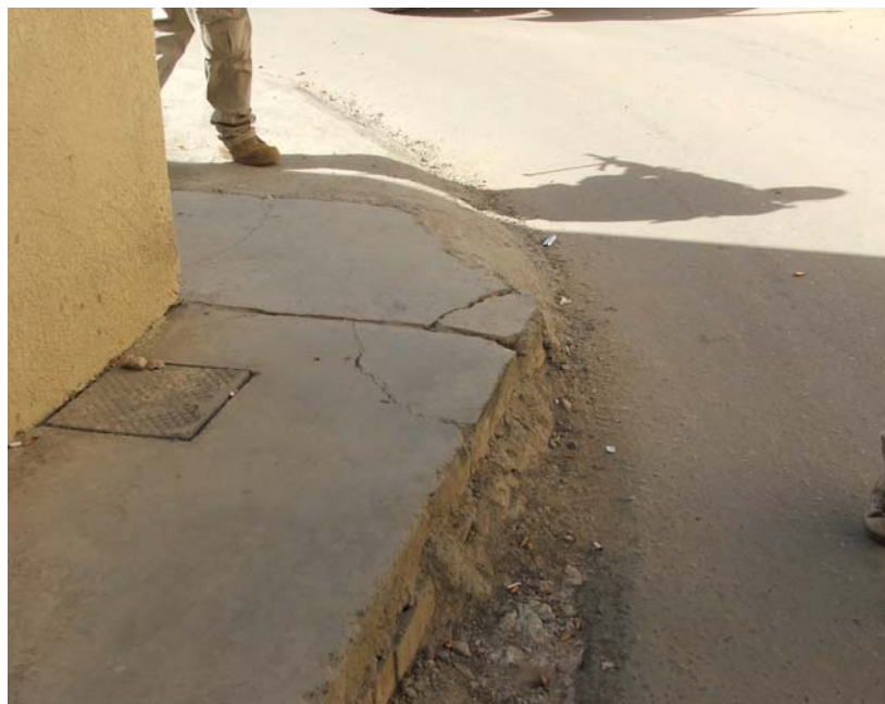
Site Photo 15. Sidewalk of Vehicle Affairs Building