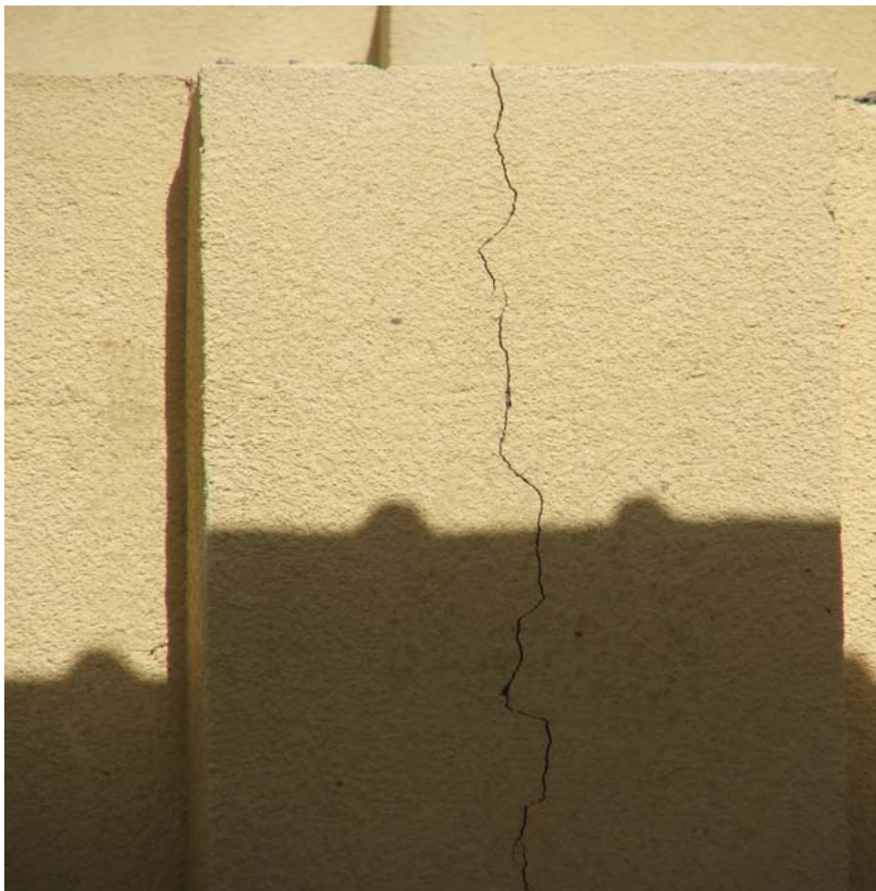
Site Photo 21. Cracks in Stucco of Interior Security Wall