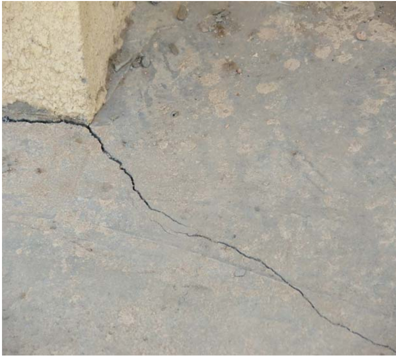
Site Photo 20. Cracks in Concrete Sidewalks of Renovated Building #2

Photos 20 and 21, respectively. Site Photo 22 illustrates exposed electrical wires located in the exterior of renovated building 10.