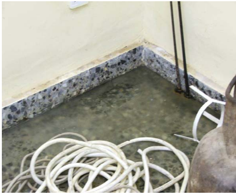
Site Photo 8. Standing Water Located in the Corner of the Dining Facility's Food Storage Room