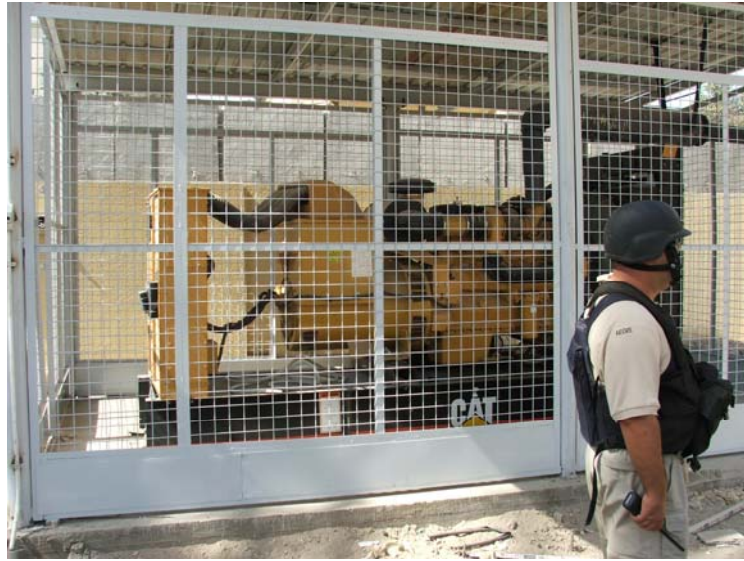
Site Photo 17. Generator Unit with Mesh Enclosure

The engine block factory nameplate showed the Engine Serial Number as 7WG02725, although the engine block serial number was partially painted over. For illustrations of the paper copy of the generator nameplate and the engine block factory nameplate, see Site Photos 18 and 19, respectively.