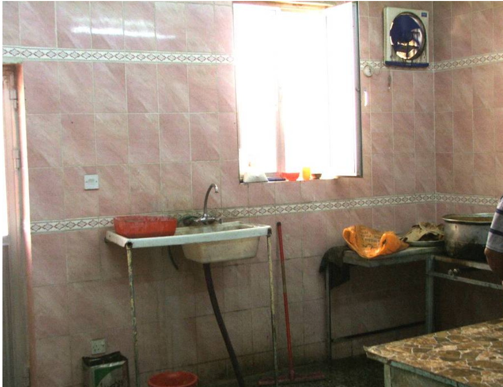
Site Photo 7. Interior of Kitchen Area

During the site visit, we noted discrepancies, including the quality of appliances in the food preparation area. The contract required “catalog cuts” for all types of equipment installed under this contract. The contract stated, “[c]uts shall include the manufacturers name, address and telephone number, rating and physical size of equipment.” The contractor did submit catalog cuts in the design submittal but the equipment currently installed in the kitchen does not match the equipment listed in the catalog cuts. Currently there is a small sink, worktable, and cooking stove located in the food preparation room. For an illustration of the dining facility’s interior food preparation room, see Site Photo 7.