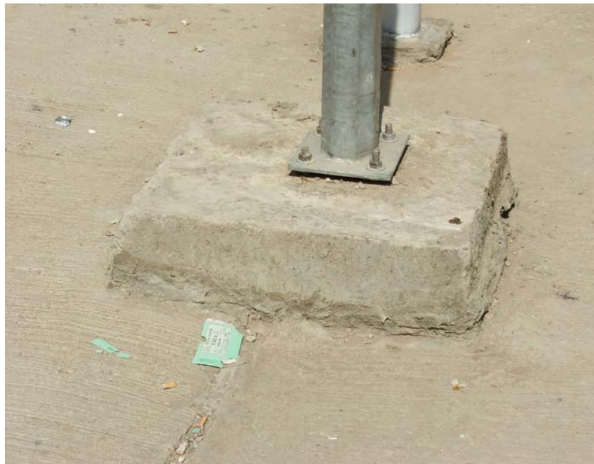
Site Photo 11. Concrete Footing and Light Post Base

The contract required that the contractor provide a complete design illustrating all existing and proposed new work for the outward oriented perimeter lighting and exterior lighting system. The contractor did not submit lighting plans as part of the design submittal. During the site visit, we noted that the light posts around the helicopter pad were not plumb, and the bases of the lighting poles were not flush with the concrete footings. For an illustration of the light pole concrete footing and light pole base, see Site Photo 11.