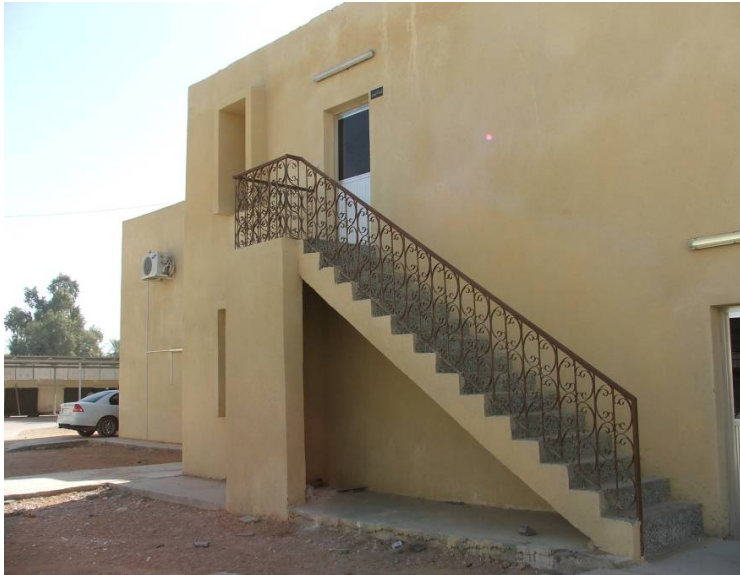
Site Photo 12. Exterior of Operations Room Building

The contract and design required the construction of a two-story facility with reinforced concrete footings, reinforced concrete slab, reinforced concrete columns and beams, and stucco over block exterior. The building design required a 5.99 M (19.7 ft) by 14.51 M (47.6 ft) facility with one external staircase. The contract required the facility to include A/C units. During the site visit, we verified the building was constructed; however, we did not assess the interior of the facility. For an illustration of the exterior wall of the Operations Room facility and the external staircase, see Site Photo 12. During the site visit, we noted discrepancies in the construction of the handrails of the external staircases. The handrails discrepancies of the Operations Room facility are identical to those of the Sleeping Quarters facility. For an illustration of the external stairwell, and a close-up of the lower rail embedded into the concrete steps, see Site Photo 13.