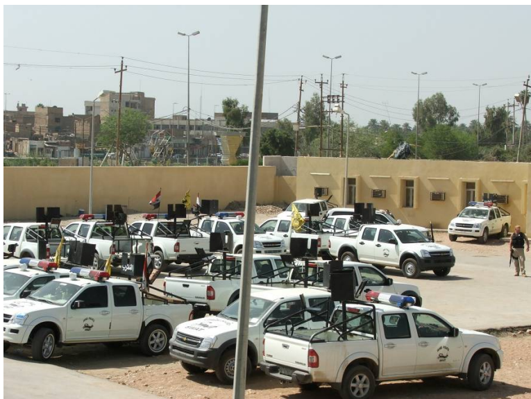
Site Photo 9. Helicopter Pad Area with Non-Plumb Light Poles

The contract's SOW did not specifically address the requirement for a helicopter pad; however, a 26 January 2005, USACE Memorandum for Record stated, "The contractor was aware of the requirement for a heli [helicopter] pad and included it in the initial bid for the project." At the time of the site visit, the helicopter pad was in place, but was of poor quality. The construction of the pad consisted of a concrete base overlaid by an asphalt surface. For illustrations of the helicopter pad area with vehicles parked on top of the pad and the edge of the helicopter pad surface, see Site Photos 9 and 10, respectively. The edge of the pad shows that concrete has broken away from the pad. The USACE Area Engineer stated he is in discussions with the contractor to repair or replace the helicopter pad.