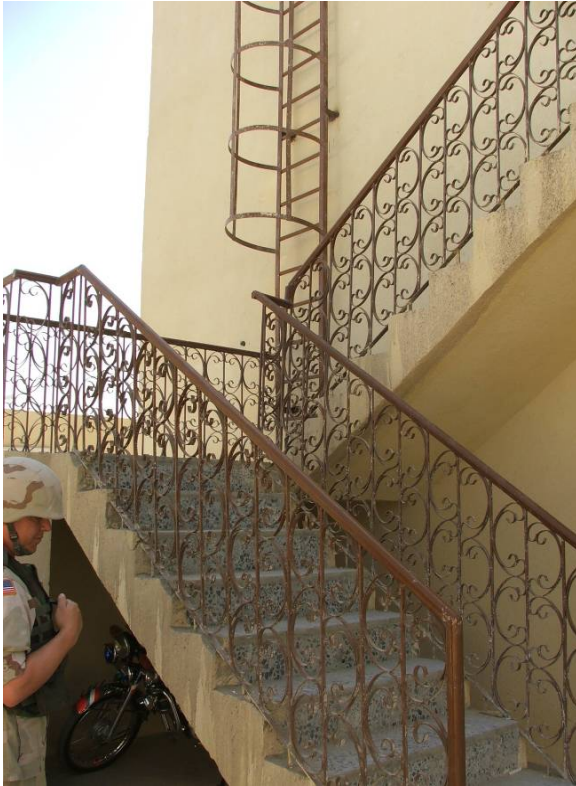
Site Photo 2. Sleeping Quarter's External Staircase