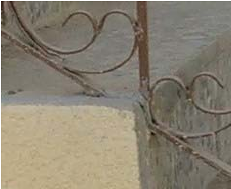
Site Photo 13. Lower Stairwell Railing of Operations Room