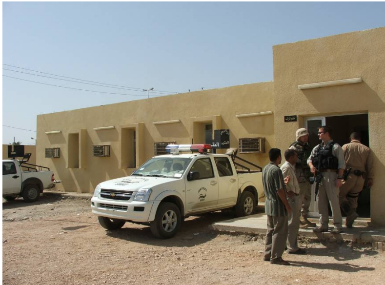
Site Photo 5. Exterior View of Dining Facility

The contract and design required the construction of a one-story facility with reinforced concrete footings, reinforced concrete slab, reinforced concrete columns and beams, and stucco over block exterior. The building design required a 16.93 M (55.5 ft) by 16.61 M (54.5 ft) facility. The building included one large area for dining, one room for food preparation, two rooms for storage, and a common lavatory. The contract required the facility to include A/C units. During the site visit, we verified the building was constructed and used as a dining facility. For an illustration of the exterior front of the dining facility, see Site Photo 5. For an illustration of the dining facility's interior dining room, see Site Photo 6. We observed A/C, lights, and fans to be operational.