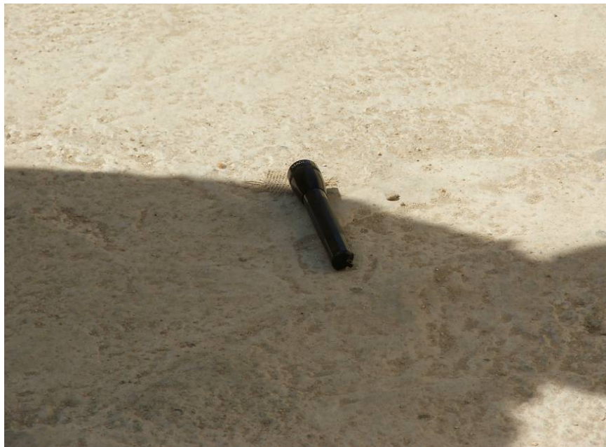
Site Photo 4. Concrete Surface Adjacent to Sleeping Quarters Building