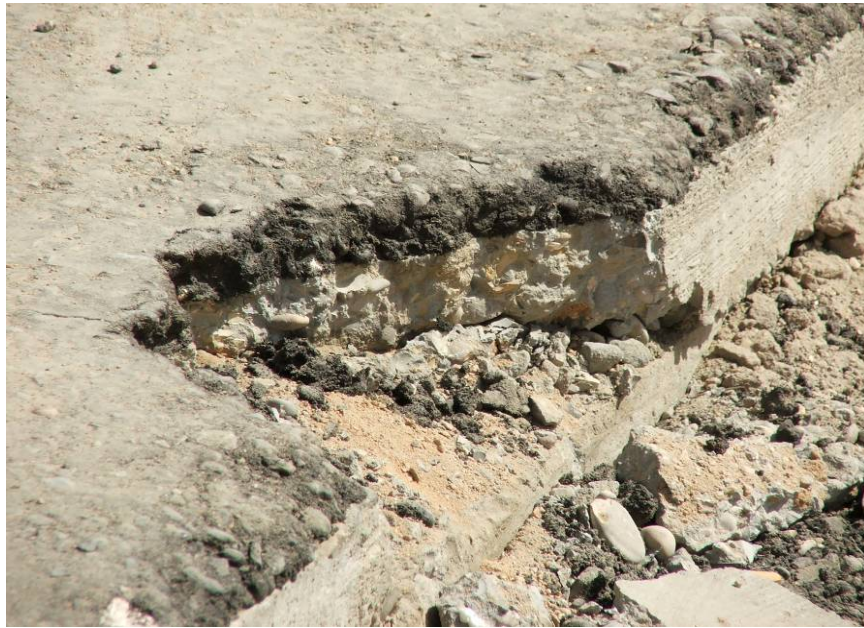
Site Photo 10. Edge of Helicopter Pad

The contract required that the contractor provide a complete design illustrating all existing and proposed new work for the outward oriented perimeter lighting and exterior lighting system. The contractor did not submit lighting plans as part of the design submittal. During the site visit, we noted that the light posts around the helicopter pad were not plumb, and the bases of the lighting poles were not flush with the concrete footings. For an illustration of the light pole concrete footing and light pole base, see Site Photo 11.