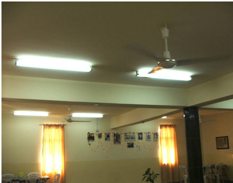
Site Photo 6. Interior of Dining Area