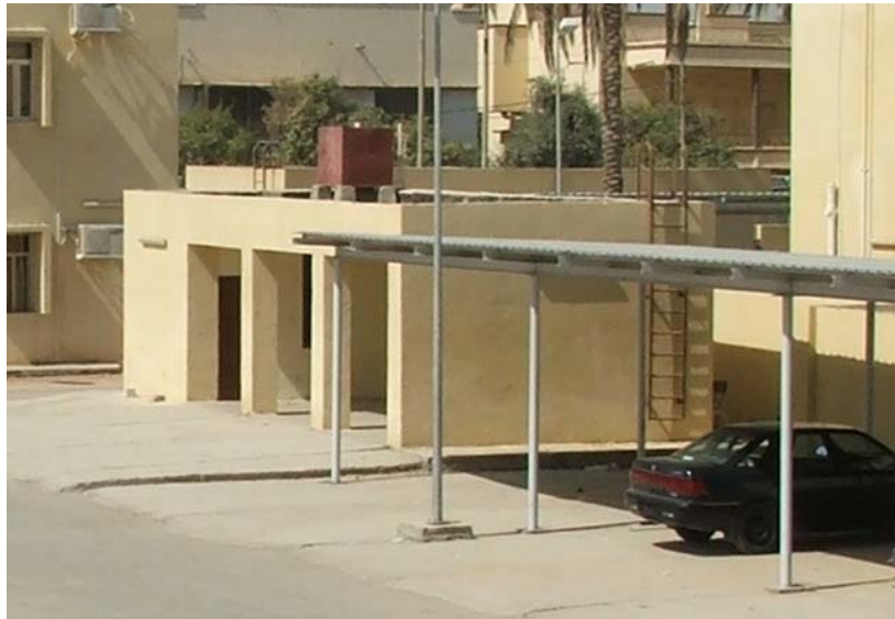
Site Photo 14. Vehicle Affairs Building

The contract and design required the construction of a one-story facility with reinforced concrete footings, reinforced concrete slab, reinforced concrete columns and beams, and stucco over block exterior. The building design required a 4.75 M (15.6 ft) by 12.25 M (40.2 ft) facility consisting of a small office, lavatory, and three-open vehicle bays. During the site visit, we verified the building was constructed. For an illustration of the exterior of the Vehicle Affairs building, see Site Photo 14. During the site visit, we noted that the concrete sidewalk adjacent to the Vehicles Affairs building was cracked. For an illustration of the cracks in the sidewalk at the Vehicle Affairs building, see Site Photo 15.