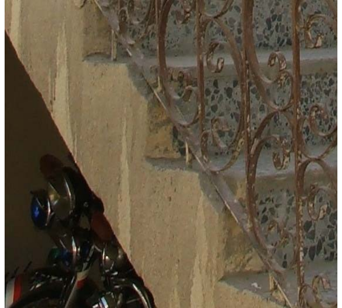
Site Photo 3. Close-Up of Stairwell