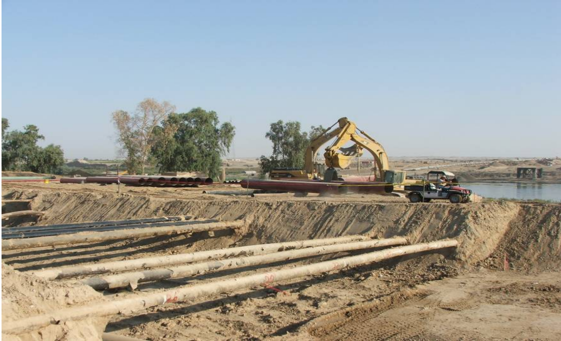
Site Photo 3: Excavation of Baiji (west side) manifold site

are existing pipelines that were not part of this project. The excavation appears consistent with design requirements.