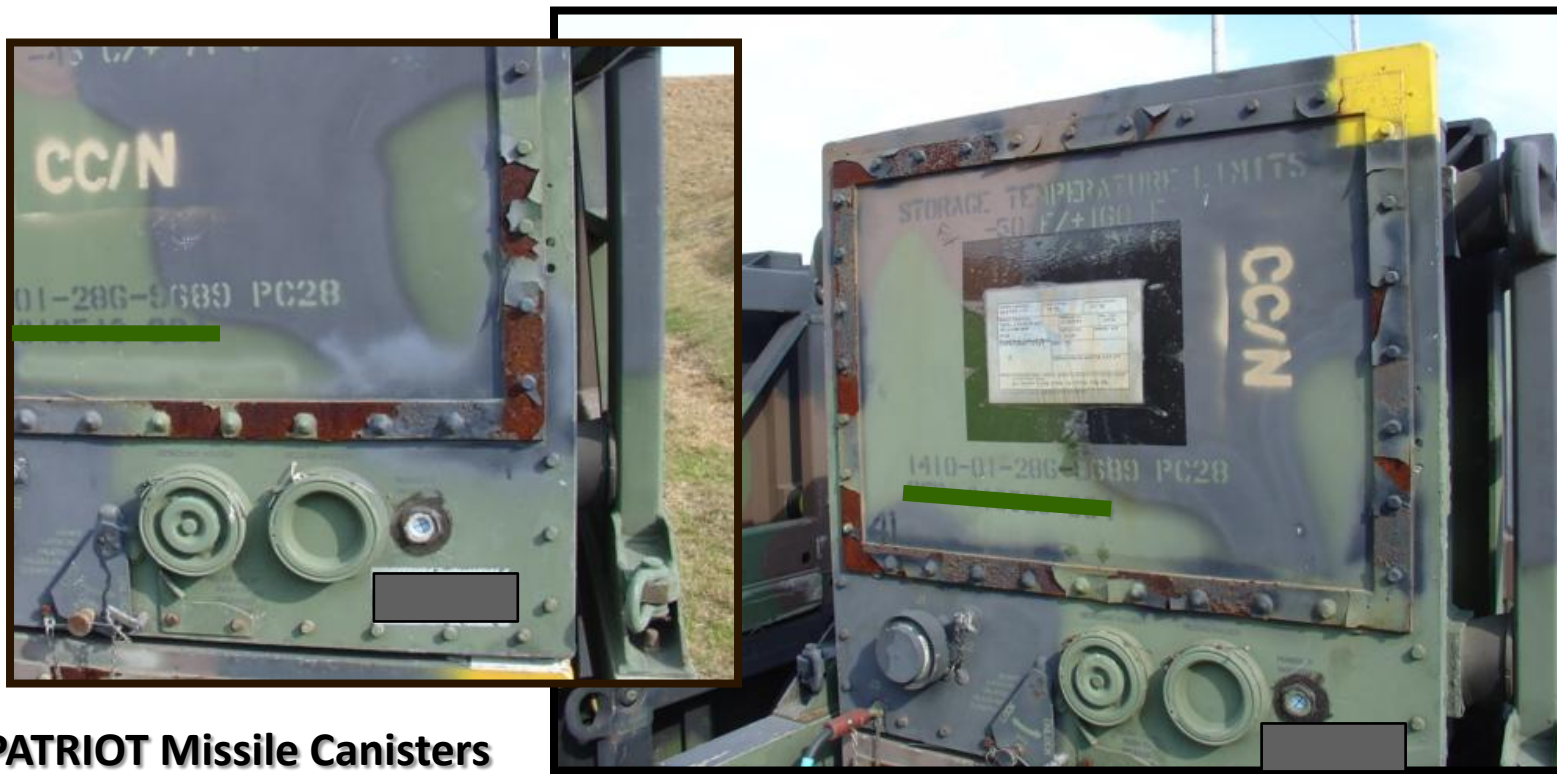
PATRIOT Missile Canisters