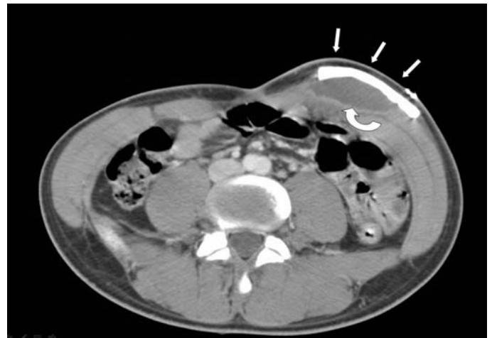
Figure 2. Note the skull cap (arrows) with the posterior homogeneous attenuating fluid collection (curved arrow) in left anterior abdominal wall.

For providers that have not heard of banking the skull cap in the abdomen, this type of finding can be perplexing. This procedure became common in recent military combat operations; however, the trend may change due to unique infection potential in other continents.