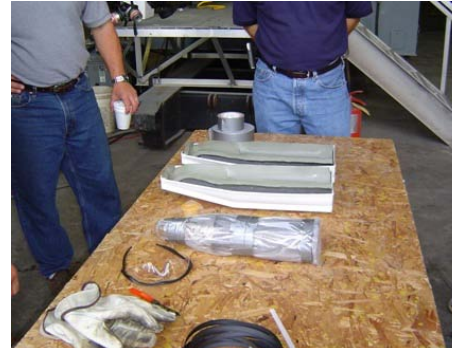
Preformed RDX Donor