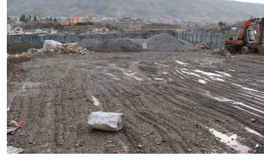
Site Photo 11. Play yard area site location