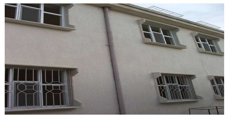
Site Photo 8. Exterior showing painted cement finish and windows