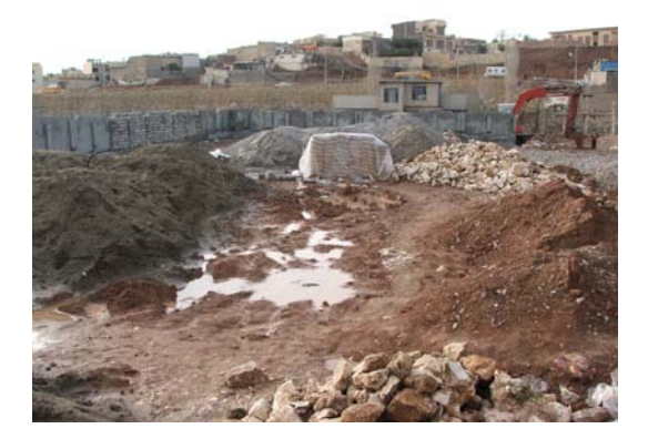
Site Photo 10. Garden area location

The play yard and garden were still being excavated at the time of our assessment. The area was being used as a material staging area. Site Photos 10 and 11 show the garden and play yard status respectively.