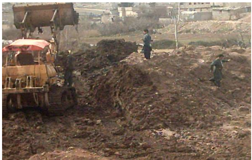
Site Photo 1. Initial site preparation work

At the time of our assessment, site preparation for the buildings was completed. The garden areas in front of the school and the play yard were still being used as a staging area for construction materials and had not been completed. Site Photo 2 shows the condition of the garden area (with the play yard in the background) at the time of the assessment.