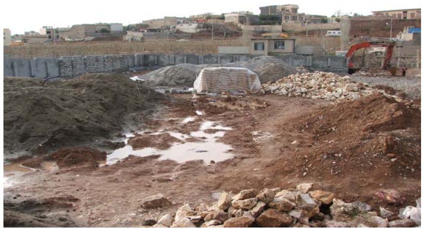
Site Photo 2. Garden area at the time of the assessment on January 24, 2006.

At the time of our assessment, site preparation for the buildings was completed. The garden areas in front of the school and the play yard were still being used as a staging area for construction materials and had not been completed. Site Photo 2 shows the condition of the garden area (with the play yard in the background) at the time of the assessment.