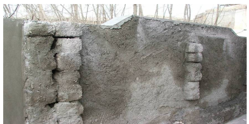
Site Photo 12. Unfinished perimeter wall