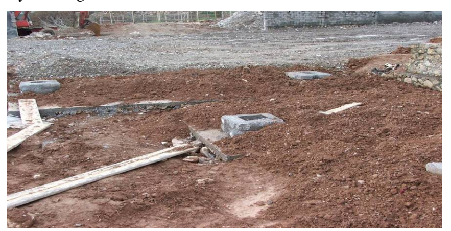
Site Photo 14. Septic tank location and manholes in front of school

The contract required construction of two septic tank systems, one for the main school building and the other for the latrines in the auxiliary building. The septic tank systems were substantially complete with buried sanitary sewer lines already connected. The main school building septic system is located near the front entrance of the building beneath the garden as shown in Site Photo 14. The other separate septic tank system has also been constructed and is adjacent to the auxiliary building.