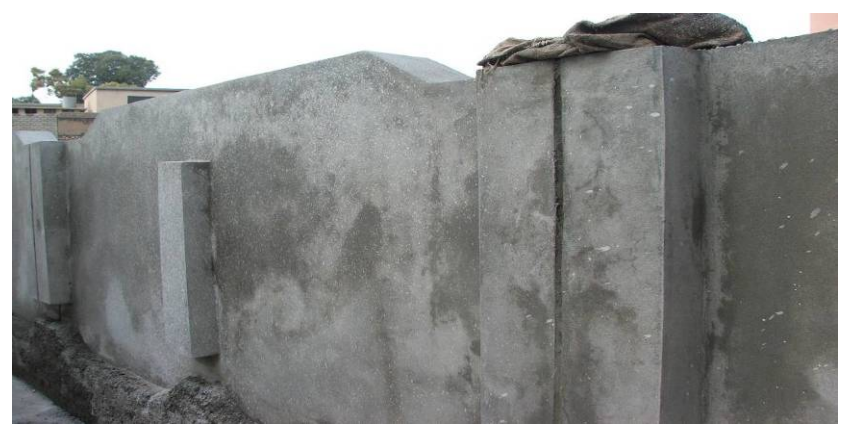
Site Photo 13. Perimeter wall with unpainted cement finish