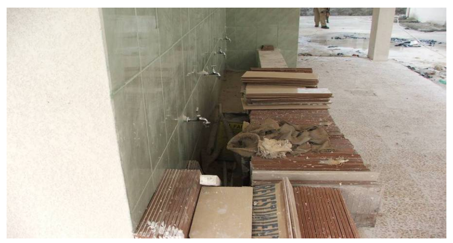
Site Photo 5. Handwash stations outside boy's bathroom

The interior classrooms and the assembly room were complete. Terrazzo tile flooring was installed and walls were gypsum plastered and painted. Electrical outlets, light fixtures, and ceiling fans were installed in each classroom and workroom as shown in Site Photo 6.