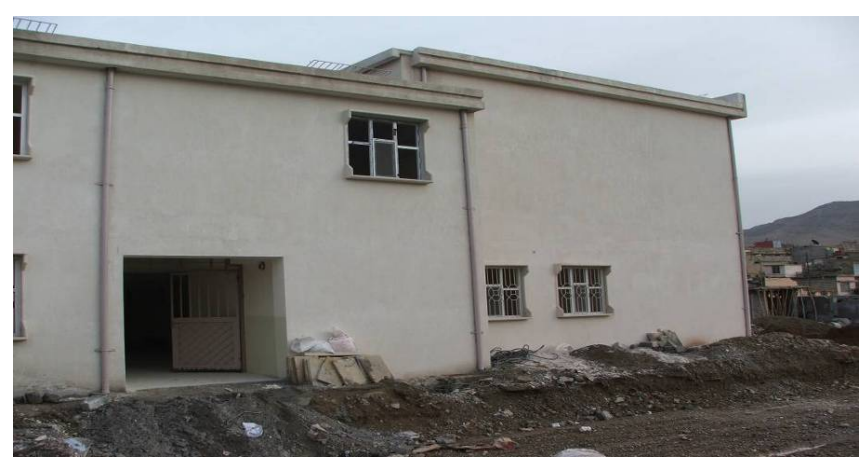
Site Photo 7. Exterior showing painted cement finish