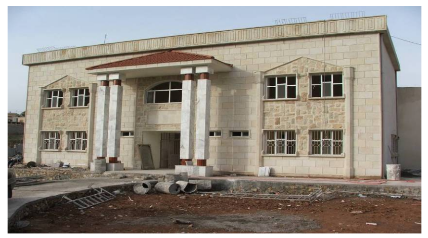
Site Photo 3: Front of the building at the time of the assessment

Water tanks, plumbing, electrical circuitry, and associated fixtures were installed but not yet operational because the electricity had not been connected. Ten water tanks were installed on the top of the auxiliary building and connected to the main water supply from the city (Site Photo 4). Six eastern style toilets were installed in both the girl's and boy's restrooms and four faucet handwash areas were installed outside each restroom. Three additional water tanks, also connected to the city water supply, were installed on the roof of the main building to provide service to the faculty restrooms. The men's and women's restrooms are furnished with two water closets each. Ceiling fans and lights were installed in each room. Site Photo 5 shows the handwash areas outside the boy's bathroom in the auxiliary building.