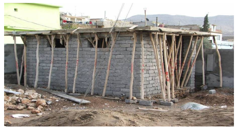
Site Photo 9. Generator building