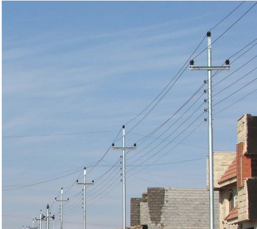
Site Photo 4. Pole line with medium and low voltage conductors

The design sets maximum pole spacing for pole lines parallel to the road. The maximum spacing for low voltage conductors on 9 m poles is 45 m. For combination poles with 11kV conductors and low voltage conductors, the maximum spacing is 35 m. Based on our observations, the pole lines in the Hasarok area met the requirements for pole spacing.