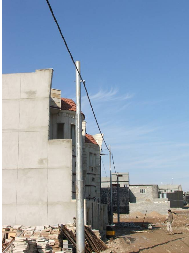
Site Photo 6. ABC line in Hasarok area in Erbil