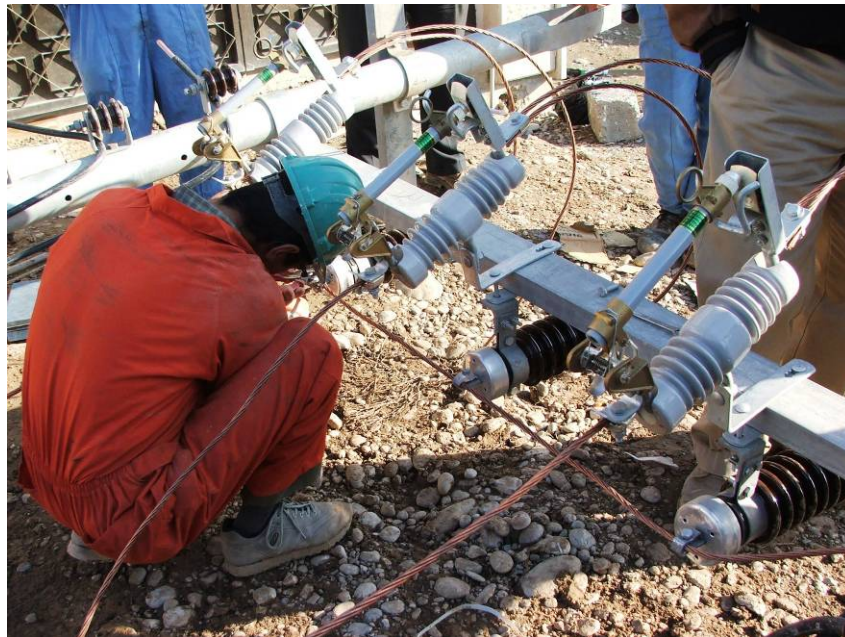
Site Photo 9. Preparing fuse cutouts on H-Pole prior to setting

During our site visit, the contractor was preparing one H-pole on the ground prior to setting it in place. Site Photo 9 shows the contractor working on the three fuse cutouts. The contractor at that time was also tying off the insulated low voltage cable to each of the two sides of the H-pole.