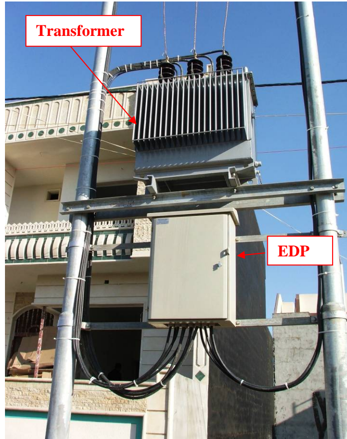
Site Photo 7. Transformer and low voltage electrical distribution panel (EDP)

The design for installation required the 11kV - 400V/230V transformer to be supported and attached to two steel channels that form a mounting platform. The design also required the low voltage distribution panel to be mounted directly to one of the steel tubular poles. The installation of the low voltage distribution panel did not adhere to the design drawings. However, the installation method utilized by the contractor as shown in Site Photo 7, appeared to be sufficient to carry the weight of the panel and also facilitated the running and connection of low voltage cable to and from the panel.