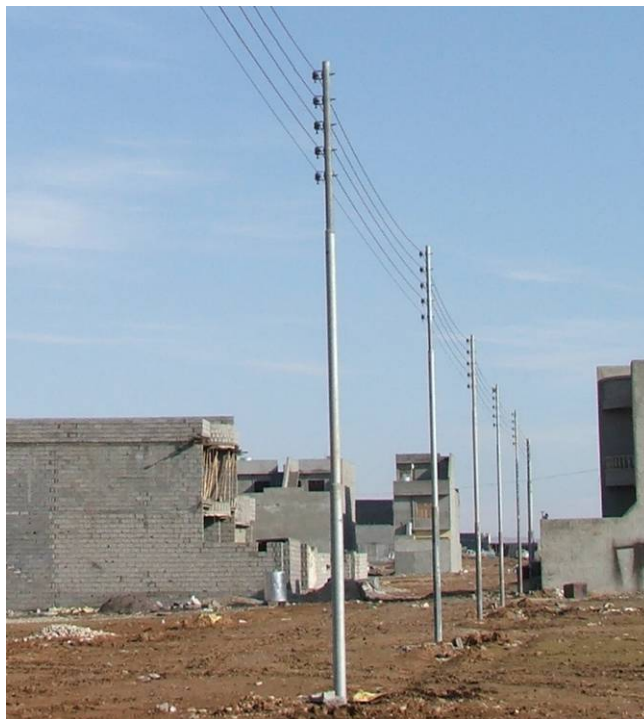
Site Photo 3. 9 meter poles with low voltage conductors attached

In the Hasarok area, we observed both pole sizes and verified the poles were the appropriate types for the medium and low voltage conductors. Site Photo 3 shows a 9 m pole line partially constructed, carrying low voltage conductors. Site Photo 4 shows a series of 11 m poles that carry 11kV conductors supported by the cross arm near the pole cap. The poles in Site Photo 4 are also carrying 400V/230V conductors attached just below the cross arm.