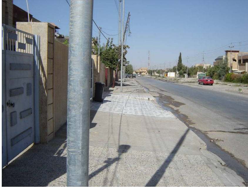
Site Photo 1: Pole line location along city street in Erbil