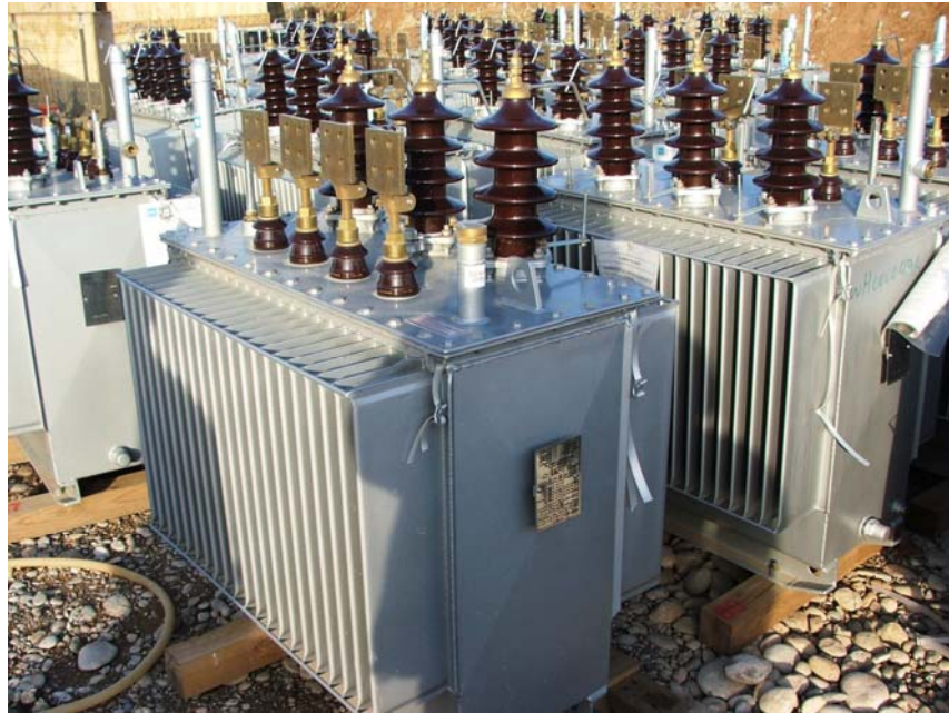
Site Photo 10. 11kV - 400V/230V transformers at contractor's storage facility

In addition to Hasarok, the assessment team also visited the contractor's material storage facility located in another area in Erbil. There, we viewed the remaining transformers as seen in Site Photo 10. We examined transformer factory plate data, and verified that the transformers met contract requirements.