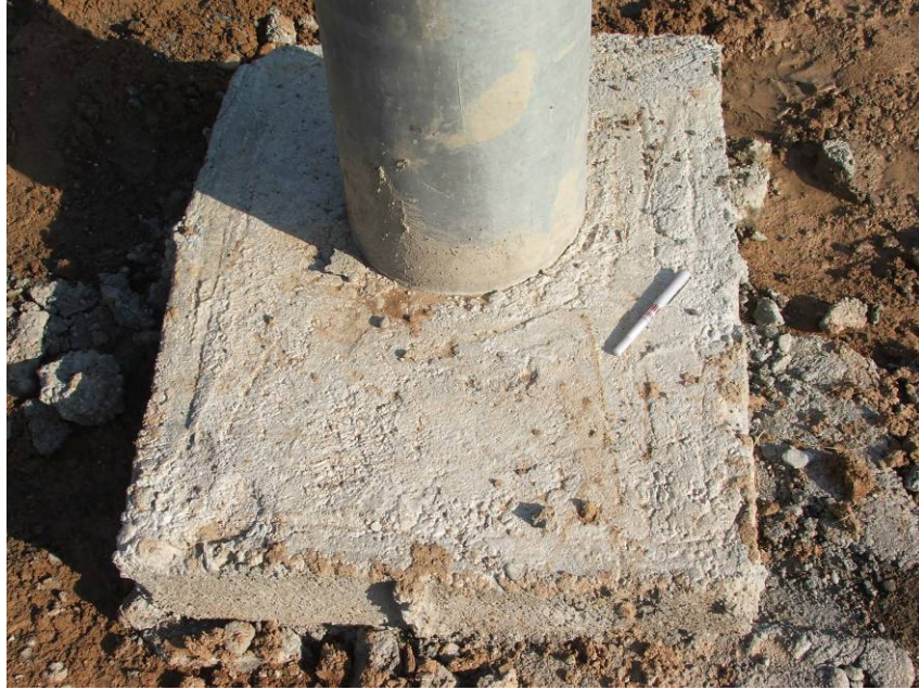
Site Photo 2. Concrete base encasing the steel tubular pole

In the Hasarok area, we observed both pole sizes and verified the poles were the appropriate types for the medium and low voltage conductors. Site Photo 3 shows a 9 m pole line partially constructed, carrying low voltage conductors. Site Photo 4 shows a series of 11 m poles that carry 11kV conductors supported by the cross arm near the pole cap. The poles in Site Photo 4 are also carrying 400V/230V conductors attached just below the cross arm.