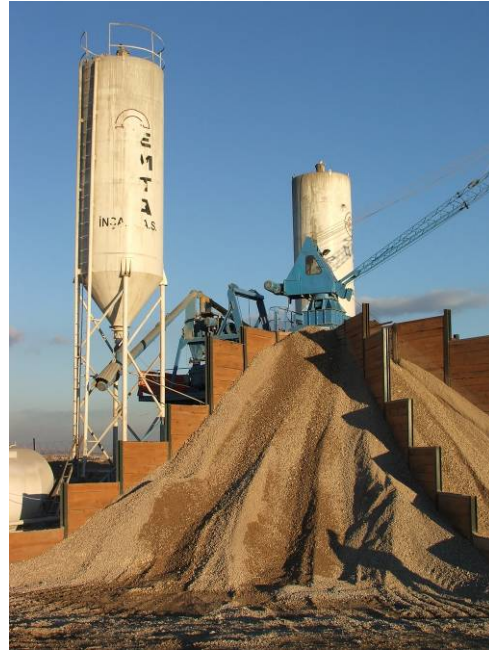
Site Photo 17. Aggregate stockpiles

In addition to a batch plant, the contractor had drilled and developed a well adjacent to the batch plant to provide a ready source of suitable water for concrete. The contractor also set up a lab for compressive strength testing and sieve analysis. The contractor's process controls at the batch plant and their on-site testing program have resulted in the production of high quality concrete used to construct the ATC Tower facility.