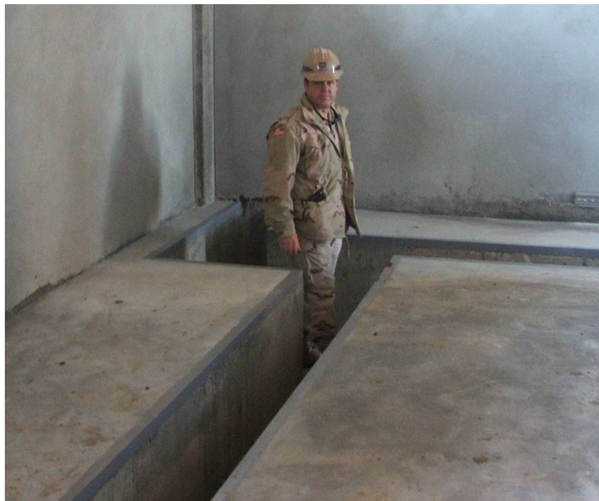
Site Photo 12. Recessed cable raceways in the substation

The floor plan included a room for electrical switchgear, as well as separate rooms for controls, a transformer, and a generator. To accommodate the placement of electrical cables and connection to equipment, recessed raceways were located in the concrete floors. Site Photo 12 shows the raceways.