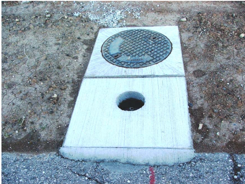
Site Photo 14. Hand hole installed along taxiway edge of pavement