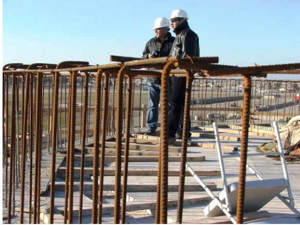
Site Photo 6. ATC tower concrete base

At the time of our site visit, the reinforced concrete base supporting a portion of the tower cab including the walkway was in place, but the cab had not yet been installed. Site Photos 6 and 7 show the concrete base for the tower cab and the walkway that will circle the cab. The reinforcing steel shown in each picture is part of the 1 m high reinforced concrete base that will support another part of the tower cab.