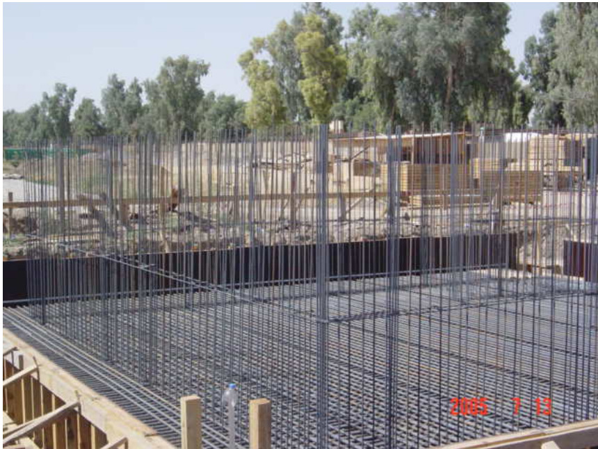
Site Photo 2. Reinforcement installation for foundation