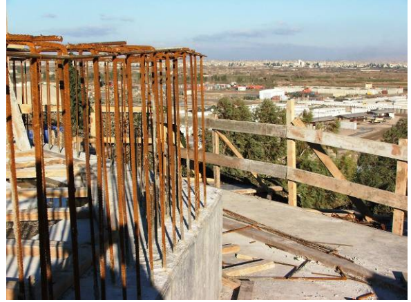
Site Photo 7. Concrete walkway