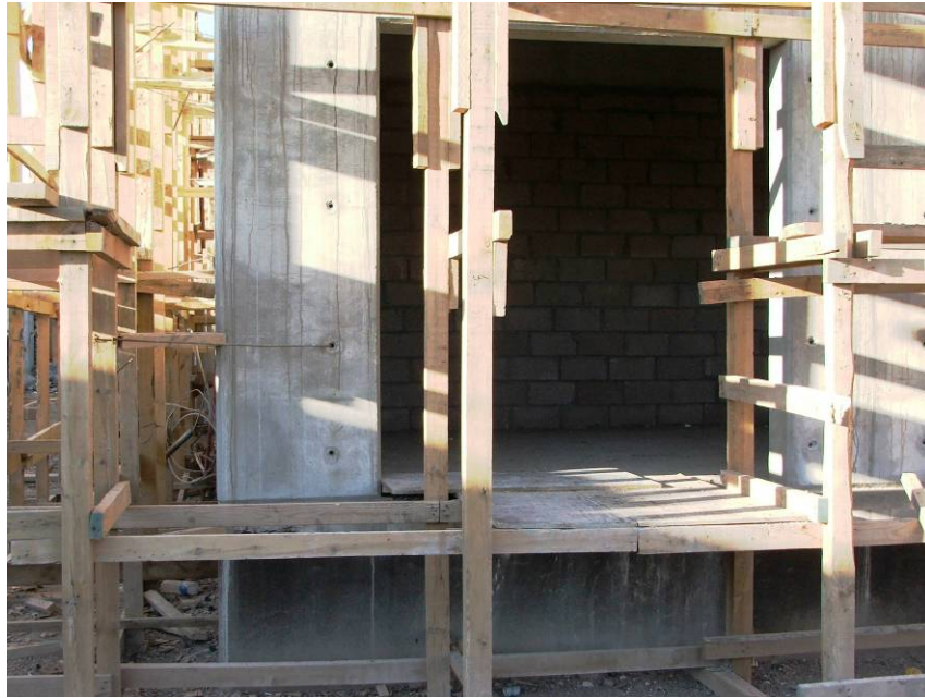
Site Photo 4. Ground floor electrical room in the ATC tower building

For an example of the ground floor construction, refer to Site Photo 4, which shows the door opening into the ground floor electrical room. For an example of the interior construction on one of the upper floors, refer to Site Photo 5, which shows the reinforced concrete walls and ceiling slab typical of what we found in the tower.