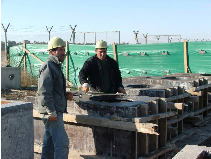
Site Photo 13. Pre-cast concrete hand holes being constructed

lighting systems. Site Photo 13 shows the pre-cast operation for constructing the hand holes and Site Photo 14 shows a hand hole in place along the taxiway and also shows the mounting enclosure for the taxiway luminaries.