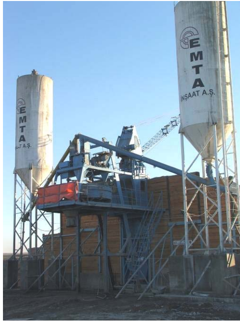
Site Photo 16: Concrete batch plant