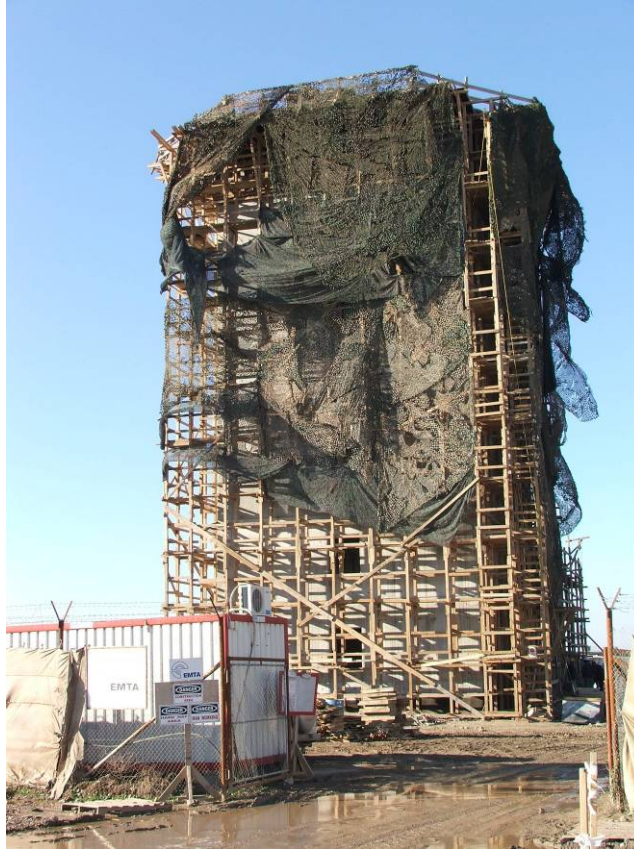
Site Photo 3. The ATC tower south elevation

The architectural design for the ground floor of the tower included a mechanical equipment room, an electrical equipment room, an elevator, mechanical and electrical chases, and a foyer with enough space for an installed metal detector. In addition, the floor plan included interior stairs to access all levels of the tower building. The design required concrete masonry unit (CMU) interior walls to be covered with gypsum wallboard, then taped, finished, and painted.