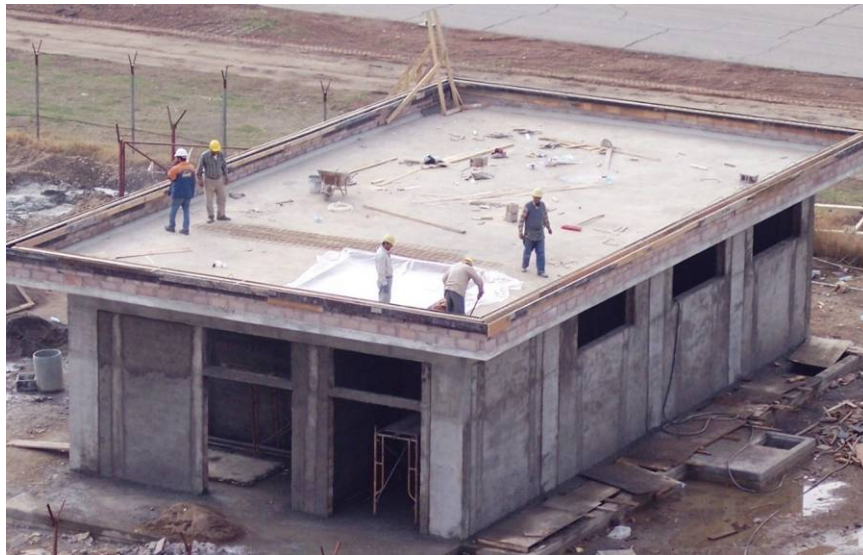
Site Photo 11. Substation 1 during construction

The same building design was utilized for each substation. The substations were designed as a single level, 8.8 m by 16.5 m rectangular reinforced concrete structure with exterior and interior concrete block walls as shown in Site Photo 11.