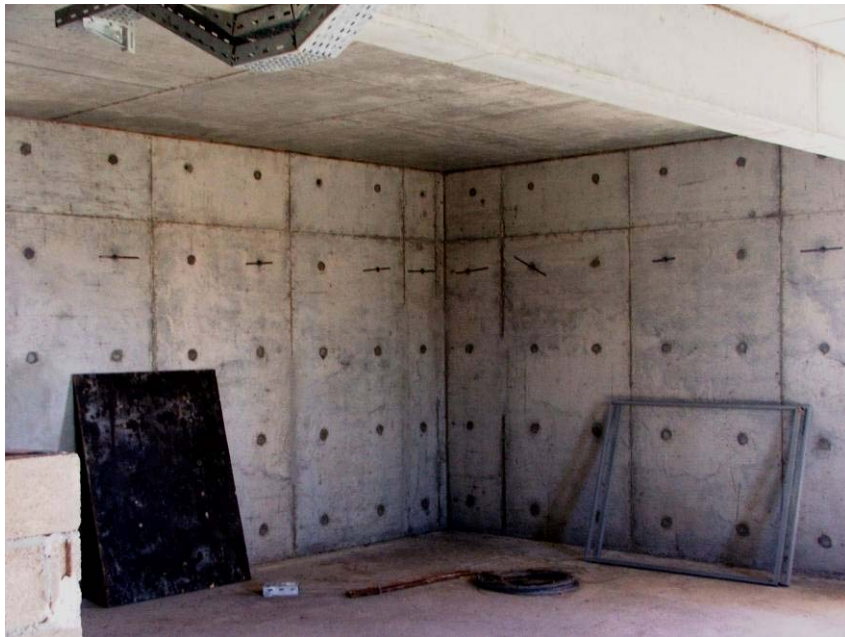
Site Photo 5. Reinforced concrete walls, floor, and ceiling in the ATC tower

Site Photo 5 is representative of the high quality of workmanship of the reinforced concrete work in the ATC tower facility. The finish of the concrete surfaces was smooth and devoid of any noticeable defects such as segregation or honeycombing.