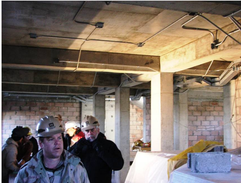
Site Photo 9. Ground floor in the ATC tower administration building

a plaster coating and painted. At the time of our site visit, the structural frame and exterior walls had been constructed and the contractor was working on plastering the exterior. Electrical conduit and cable raceways were being installed in the interior. Site Photo 9 shows the CMU walls, reinforced concrete columns, beams and roof slab in the ground floor area. The photo also shows electrical conduit and cable raceways being installed and anchored to the concrete.