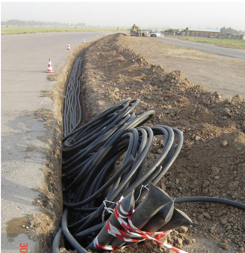
Site Photo 15. Conduit installation for NavAids – Photo provided by USACE

The luminaries for taxiway and runway edge lighting were required to be installed onto breakaway mountings. The design also required the electrical cable connecting the lights and other NavAids to the power source to be encased in PVC conduit. Site Photo 15, provided by the USACE, shows the trenching and PVC conduit installation for various NavAids, including taxiway edge lighting.