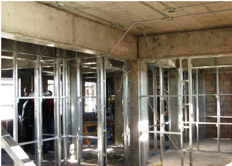
Site Photo 10. Interior wall construction in the ATC tower administration building

We also observed interior wall construction during the site visit. Site Photo 10 shows the metal studs in place for office walls located in the first floor.