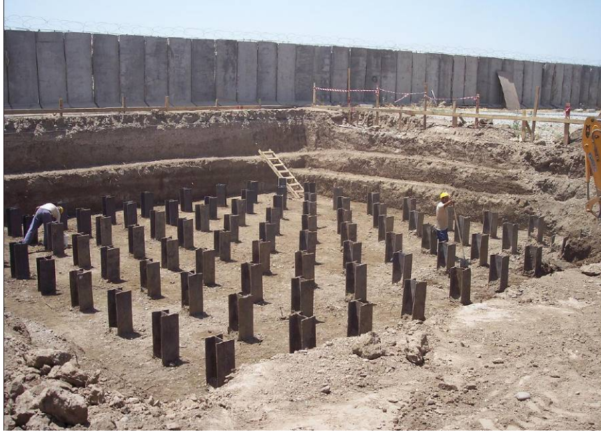
Site Photo 1. Foundation construction with steel piles - Photo provided by USACE