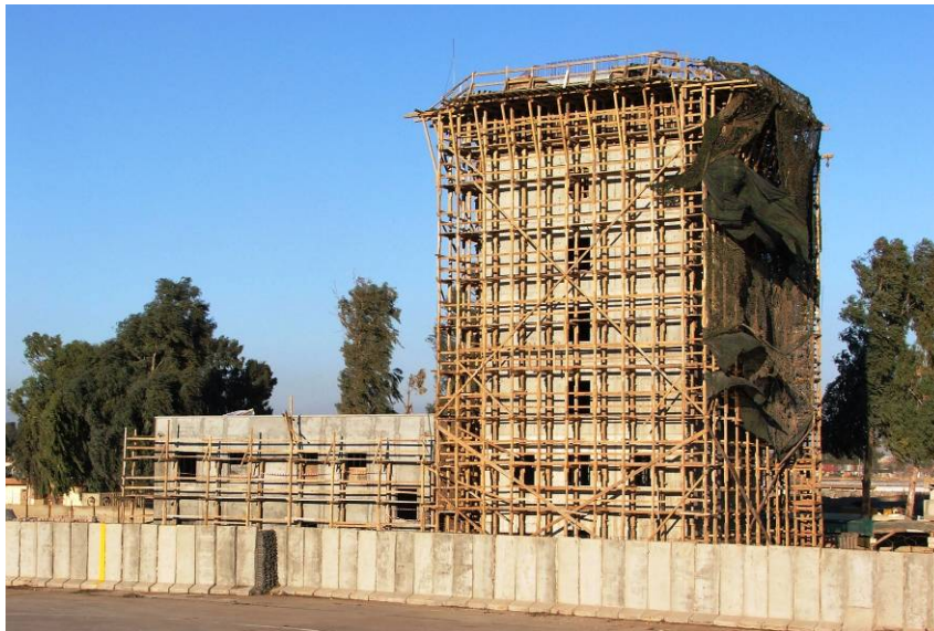
Site Photo 8. The exterior of the ATC tower facility

The administration building consisted of two floors of administrative space within a 16.4 m by 10 m structure to support 30 people. The ground level floor plan included a conference room and work shops, as well as bathrooms. The first floor consisted of office space for the staff supporting air operations. Site Photo 8 shows an exterior view of the ATC tower facility, with the administration building on the left.