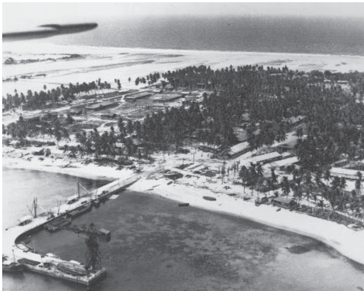
Naval Historical Center

JICAs performed three primary tasks. First, they collected, screened, and transmitted to Washington “all information, exclusive of combat intelligence, within the theater” desired by the War and Navy Departments. As theater collection coordinators, JICAs provided logistical support, tasking, and guidance to all human intelligence (HUMINT) sources, including OSS agents, in the JICA area of responsibility. Lastly, JICAs ensured lateral dissemination of pertinent intelligence among various agencies, military and civilian, within each theater.