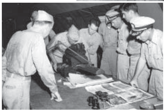
Nimitz visiting fleet air photo squadron on Guam, May 1945.

create a joint organization in SWPA were unlikely to succeed: "I am fully aware of the fact that politics and personalities make any such reorganization impossible."