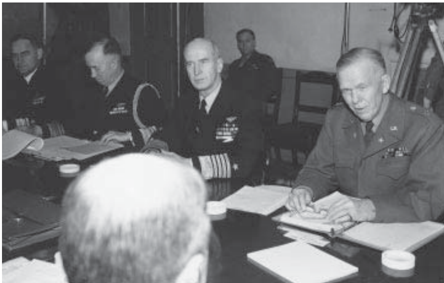
Naval Historical Center

Powerful supporters of joint intelligence.