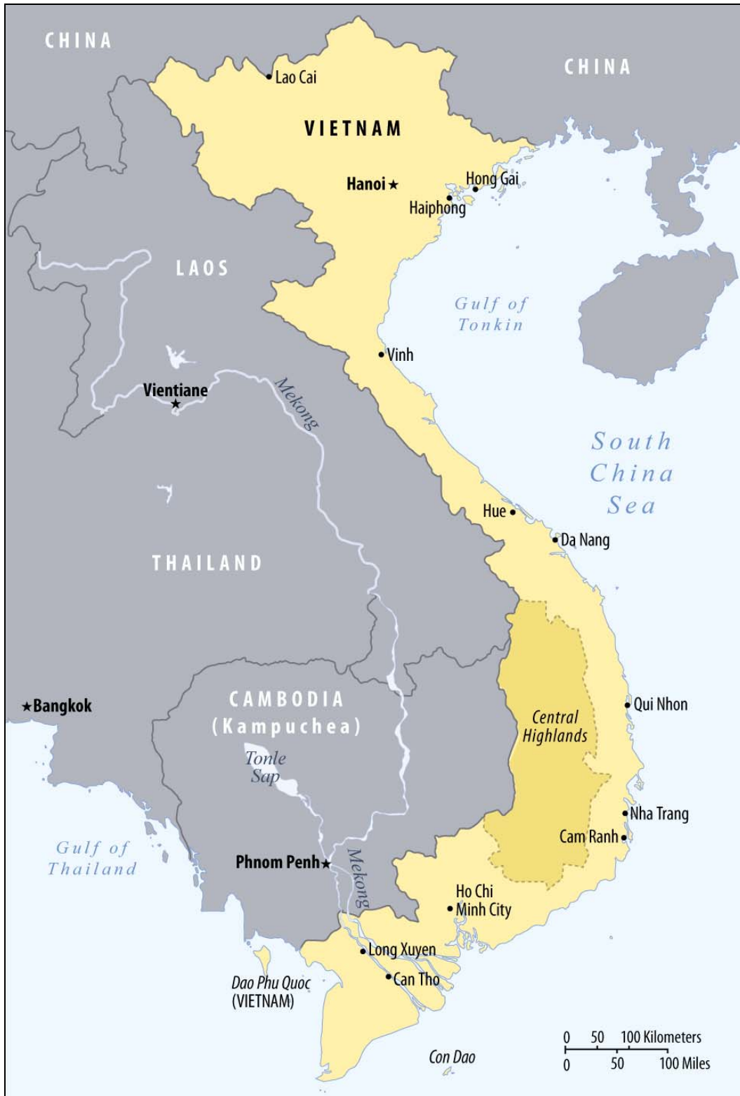
Figure 2. Map of Vietnam