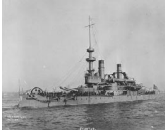
Geography and sea power. The battleship USS Oregon made an epic voyage around South America during the Spanish-American War. She reached Cuba in time to participate in the battle of Santiago. The year was 1898, and the Panama Canal did not exist.

The strategic logic is altogether inextinguishable. With respect to politics, technology, tactics, costs, and organization, just about everything pertaining to space warfare is eminently debatable. What is not debatable is a strategic logic that requires an irreversible trend towards military space exploitation to trigger programs to try to deny effectiveness to that exploitation. We are utterly unimpressed by (largely) accurate caveats that point to the contemporary high costs of access to orbit, the slowness of orbital transfer, and the distinctive political-ethical-(quasi)-legal regime that renders outer space different as the last “wide common” of mankind. 27 Space power and space warfare are coming. The only issues are how and when. This unpromising prediction could be upset only in the unlikely circumstance that a truly political peace broke out and was sustained, on Earth. Even in that improbable event, still one might