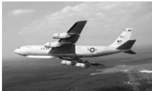
The changing face of battlefield air reconnaissance: a World War I observation balloon, a World War II spotter airplane, and the E-8C JSTARS. The authors note that development for military technologies in all environments has followed a similar progression of vision followed by experimentation, exploration, and correction.

need is lurking, in different guise, somewhere in the writings of Baron Antoine Henri de Jomini, Adm Alfred Thayer Mahan, Sir Julian Corbett, or perhaps Albert Wohlstetter. We elect not to pass judgment on that possibility. Instead, we recommend that—in addition to historical education in actual military experience, to inspiration from the classics of strategic theory, and to more mundane borrowing