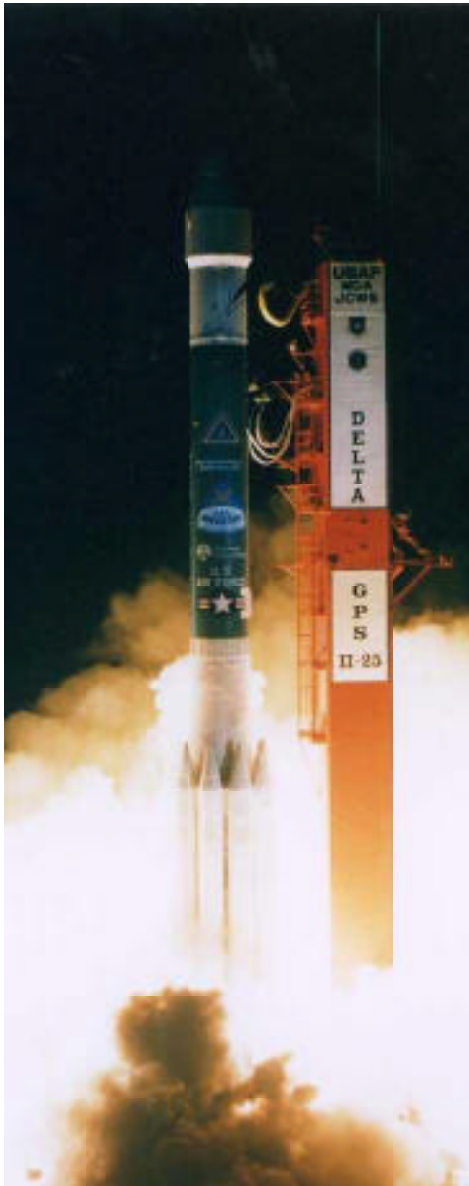
A Delta II carries a Global Positioning System (GPS) Satellite into orbit in 1996. Security concerns over the proliferation of GPS receivers around the world offer a thought-provoking corollary to the questions raised by the emergence of high-resolution commercial imagery satellites.

doubtedly elevate the “noise” level with respect to compliance assessments. A 1996 study prepared by Science Applications International Corporation concluded that with a new cast of players and attendant increase in noise, the compliance process will be affected by premature revelations, false alarms, increased ambiguity, use of stalling tactics, and self-serving political agendas. 39 By increasing the noise level, differentiating between proscribed and permitted activities may become even more difficult since assessing compliance invariably requires attempting to prove a negative (i.e., that a certain proscribed activity is not taking place). 40