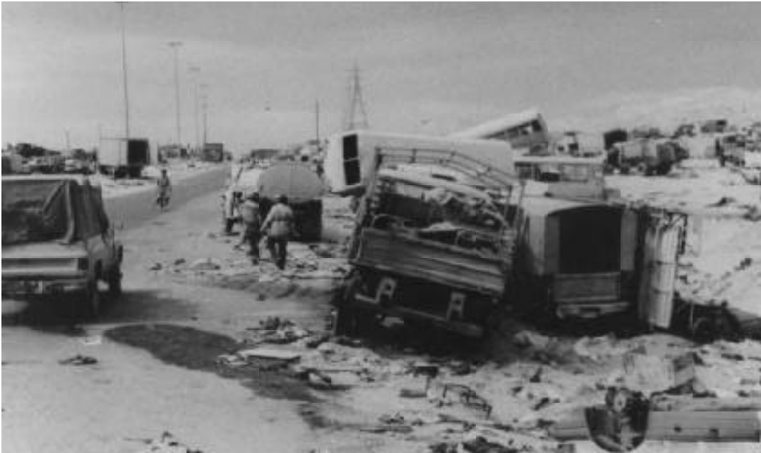
The “highway of death.” Even lawful combat operations can endanger the potentially fragile nature of consensus for military action.

ensure that the military may execute each proposal without violating the Standing Rules of Engagement, the law, and international agreements. If the course of action requires supplemental rules of engagement, a judge advocate at either the component or CINC level should begin the effort to get those measures drafted and later approved by the NCA. After the NCA receives the CINC’s courses of action, the CJCS may issue a planning order to begin execution planning even before formal selection of a course of action. After selection of a course of action in phase four—course of action selection—an alert order is issued, advising the CINC of the chosen course of action. 72 Although this may be possible to do beforehand—after issuing a planning or alert order—the judge advocates at the component, joint task force, and CINC levels should begin to consider targets for inclusion in a “no hit” or “restricted” target list. They must also advocate approval of supplemental measures to the rules of engagement necessary to execute