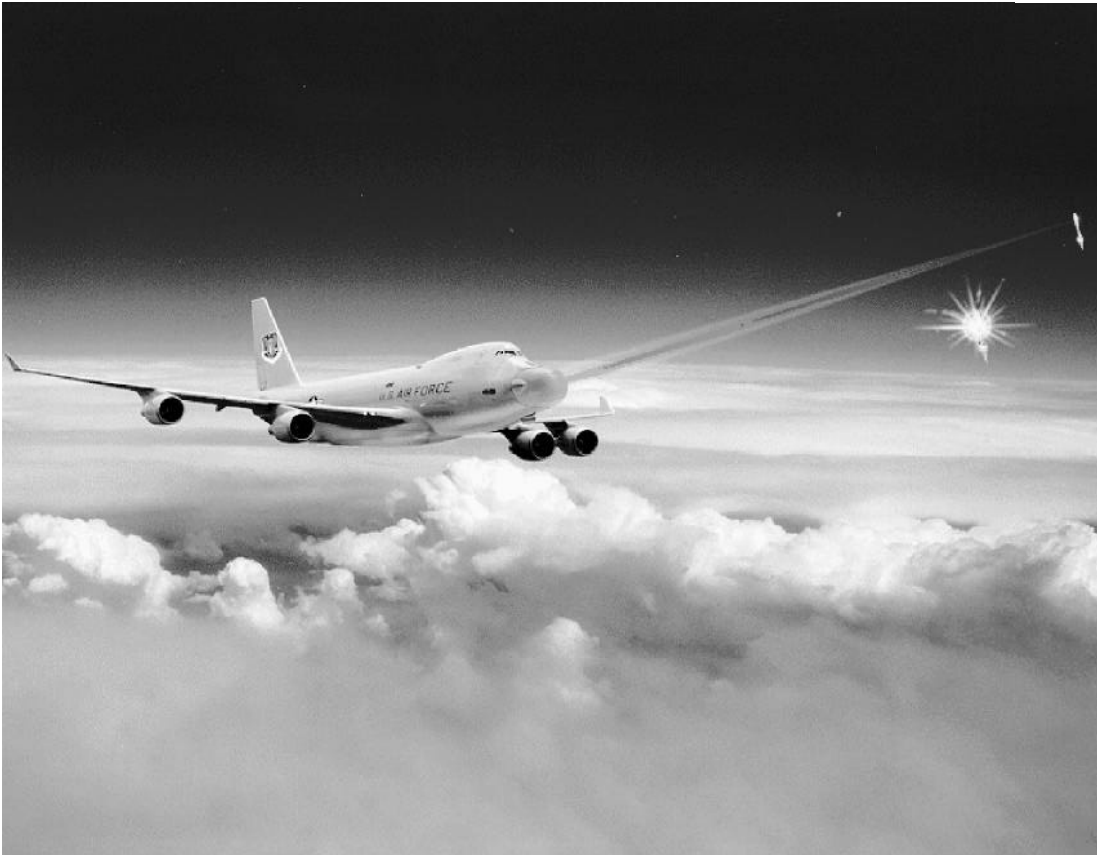
Depiction of the airborne laser (ABL) engaging theater ballistic missiles in the boost phase of flight. "[One cannot] see the Air Force building the material, cultural, and organizational foundations of a service dedicated to space power." Do Air Force plans and programs reflect cultural bias or realistic solutions to technical, fiscal, and political constraints?

to smother those people who would offer us the most innovative and revolutionary visions for exploiting space. The emergence of a real space-power force will require the creation of a highly skilled, dedicated cadre of space warriors clearly focused on space-power applications—not merely on helping air, sea, and ground units do their job better.