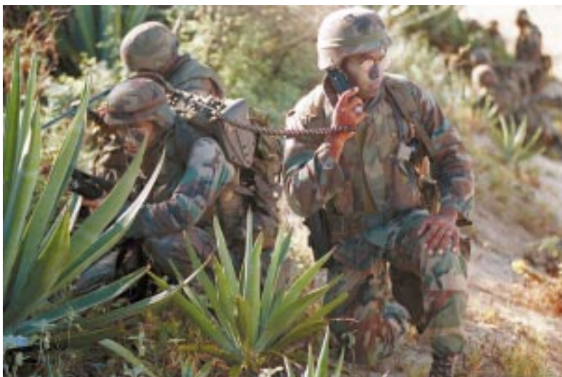
U.S. Navy (Jeffrey Viano)