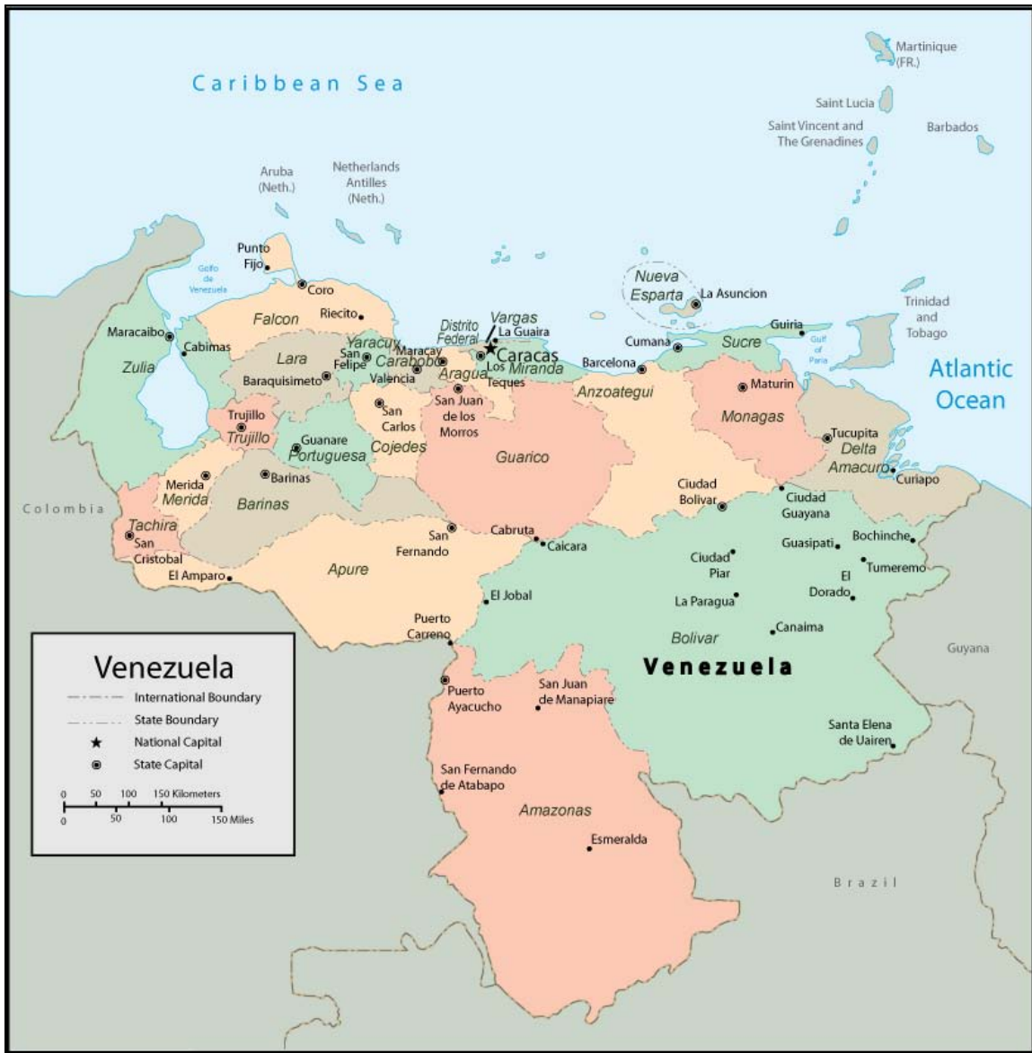
Figure I. Map of Venezuela