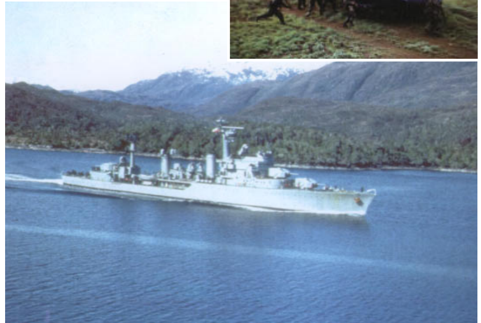
Chilean vessel Almirante Williams during Unitas 32-91 .