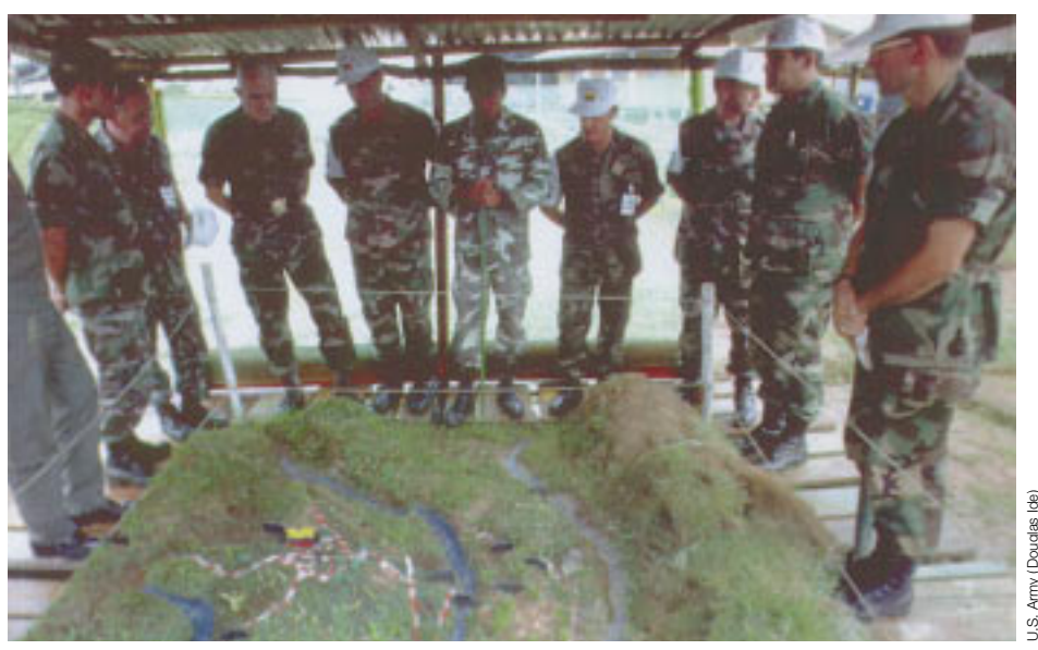
Briefing visitors at Coangos.

zone and around isolated outposts along the demarcated border some 60 kilometers to the northeast.