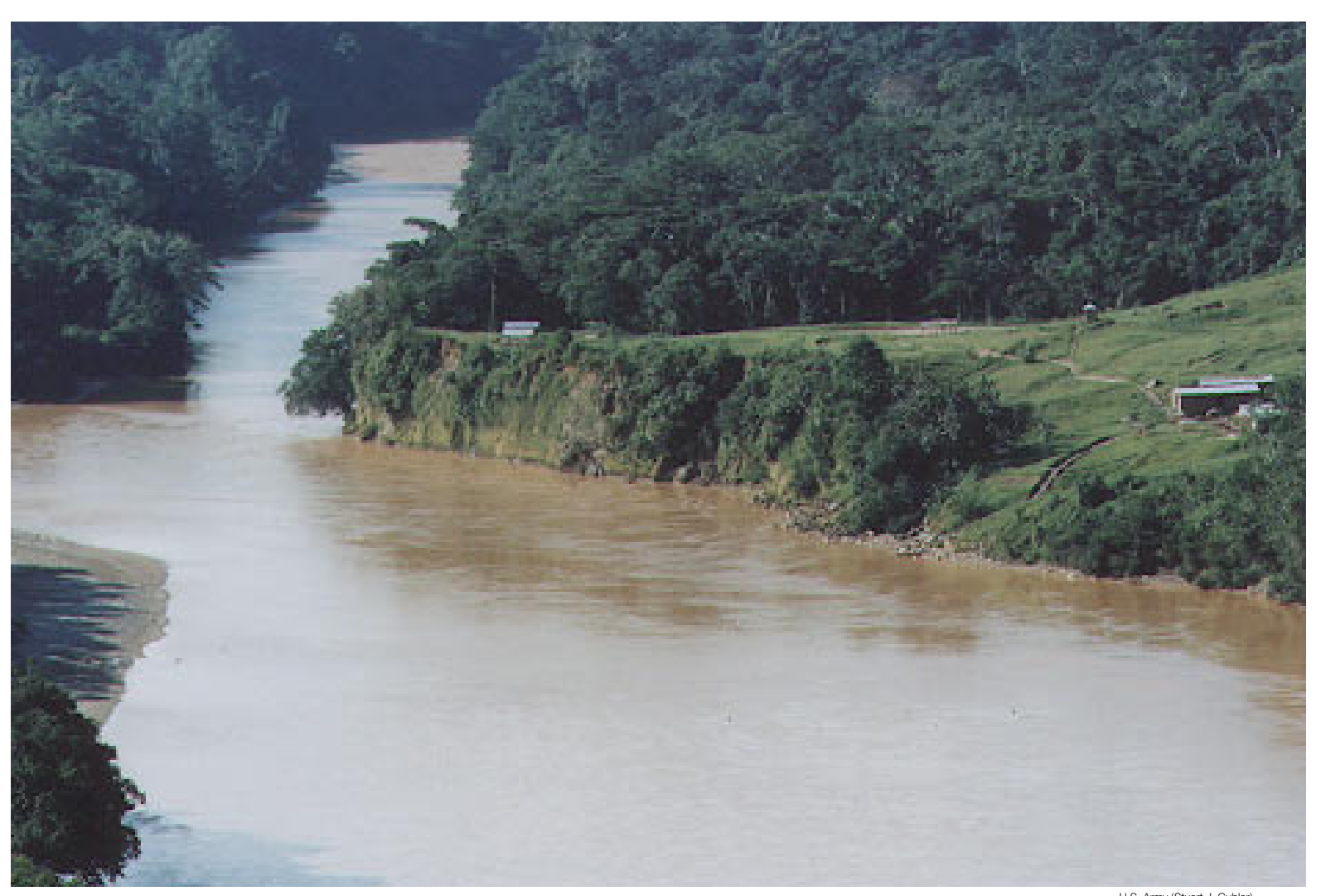
Santiago River (foreground) and Yaupi River on Ecuador-Peru border.