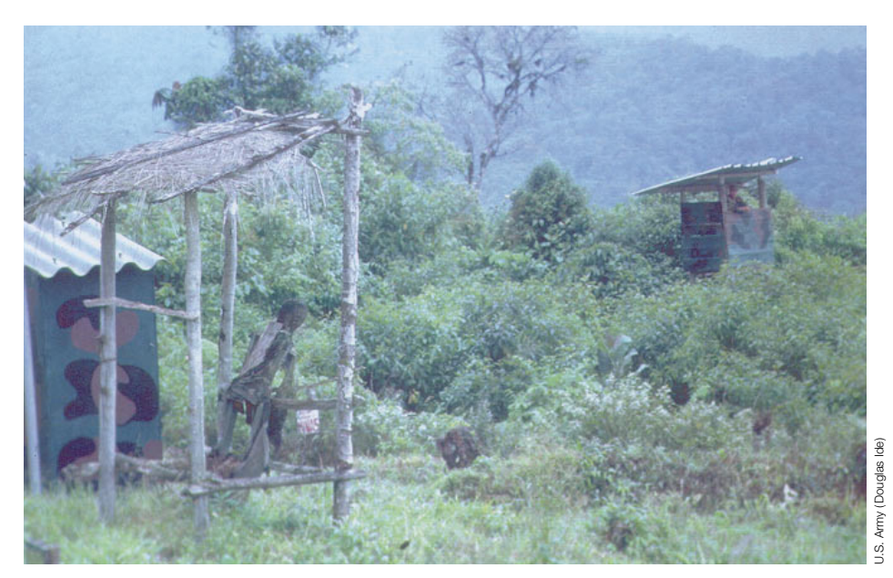
A corner of disputed territory.

Unfortunately, the demarcation was never completed because of a geophysical anomaly that was discovered in the upper Cenepa Valley in 1946. Since 1960, Ecuador has insisted that the protocol is not executable in that area and is suggesting a claim to extensive territory in the Amazon Basin. Peru, on the other hand, asserted that the protocol is valid and has considered the disputed territory to be sovereign. As a result, numerous small-scale clashes have erupted in the area over