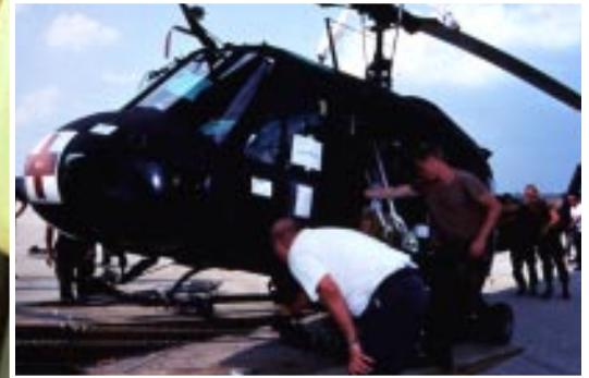
UH-1 being winched into C-5 Galaxy for Vigilant Warrior.