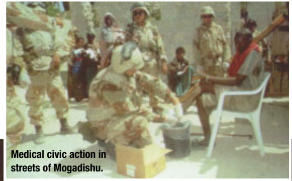
Medical civic action in streets of Mogadishu.