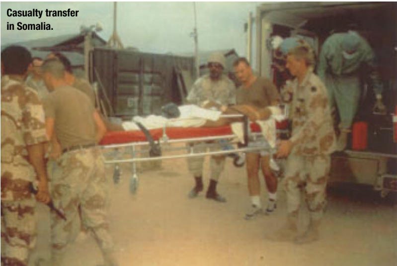
Casualty transfer in Somalia.