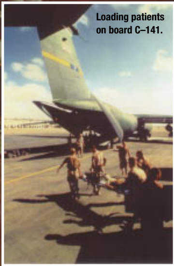
Loading patients on board C-141.