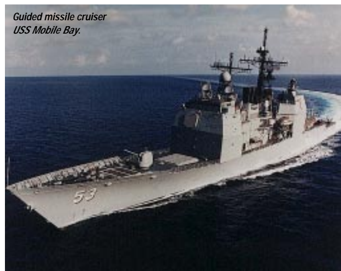
Guided missile cruiser USS Mobile Bay.

An array of service programs reinforces the joint and combined nature of the TMD mission. The TMD Initiative (TMDI) involves the Army, Navy, and Air Force. 10 The