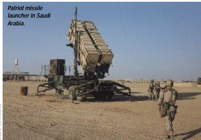
Patriot missile launcher in Saudi Arabia.

American strategy has shifted significantly with the end of the Cold War and demise of the Soviet Union. It is no longer based primarily on a global threat to U.S. interests, but instead on unpredictable and ambiguous regional threats. This shift occurred as a significant proliferation of ballistic missiles with ranges that could seriously threaten regional stability spread to a number of potentially hostile states. As a result, the significance of TMD requirements in the