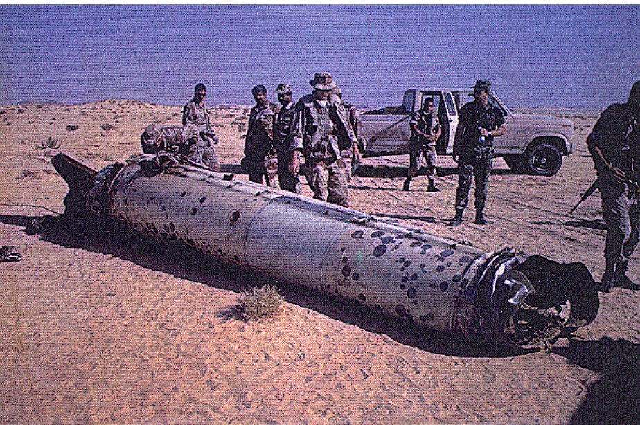
U.S. Air Force (Pietro Ybanez)