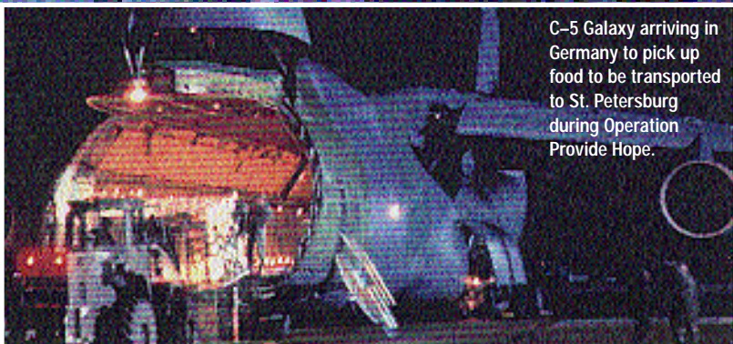
C-5 Galaxy arriving in Germany to pick up food to be transported to St. Petersburg during Operation Provide Hope.

Abrams tank rolling onto Cape Isabel during a deployment exercise.