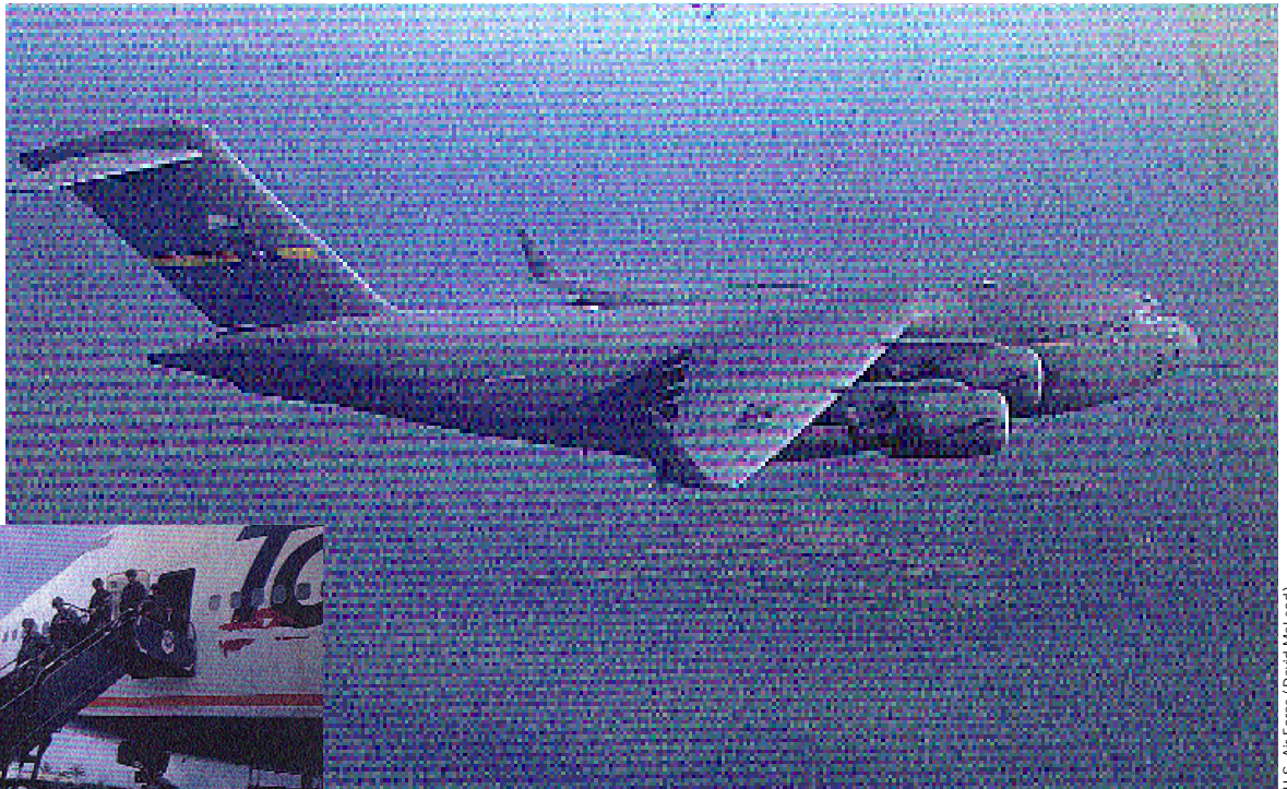
U.S. Air Force (David McLeod)