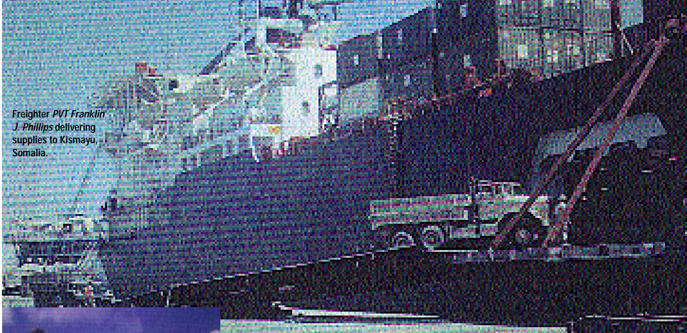
Freighter PVT Franklin J. Phillips delivering supplies to Kismayu, Somalia.