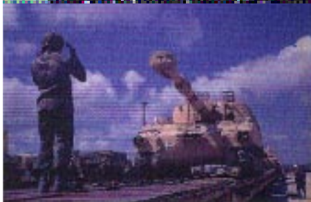
M109 howitzer moving onto a rail car at port of Beaumont, Texas.