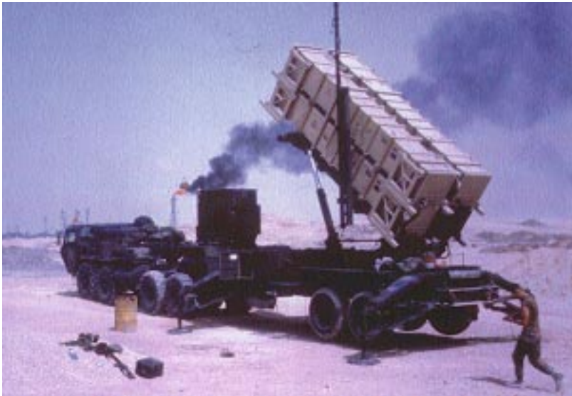
U.S. Army (Robert Reeve)