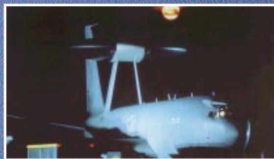
NATO Airborne Early Warning Aircraft.