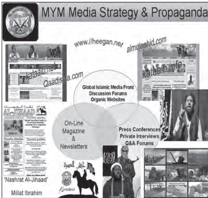
Figure 2. Media and Propaganda Strategies.

3. News Conferences, Interviews, and Online Chat Sessions with Senior MYM Leadership: Sheikh Mukhtar Robow, who was the former official spokesman for the MYM, has given multiple interviews over Al-Jazeera and other Arab networks; however, other senior and mid-level MYM leaders have also taken advantage of the availability of news reporters in Somalia. Whether at press conferences or private interviews, since January 2009 MYM leaders have addressed the need for support in Somalia as well as the need to change TFG leadership by ousting President Shaykh Sharif Sheikh Ahmed. They have also praised AQC leadership and supporting media infrastructure for their role in publicizing the struggle in Somalia. Figure 2 depicts media strategy and propaganda of the MYM.