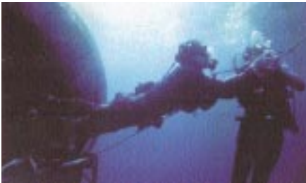
SEALs exiting an underwater delivery unit.