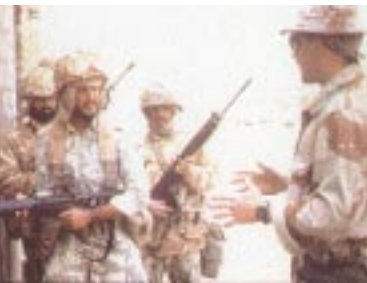
Liaising with coalition forces during Operation Desert Storm.

SOF have performed admirably during recent years, despite residual problems like those just discussed. Peacetime engagement is