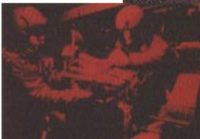
AC-130 Spectre crew loading a 40mm Bofors cannon.

SOF often are employable where high-profile conventional forces are politically, militarily, and/or economically inappropriate