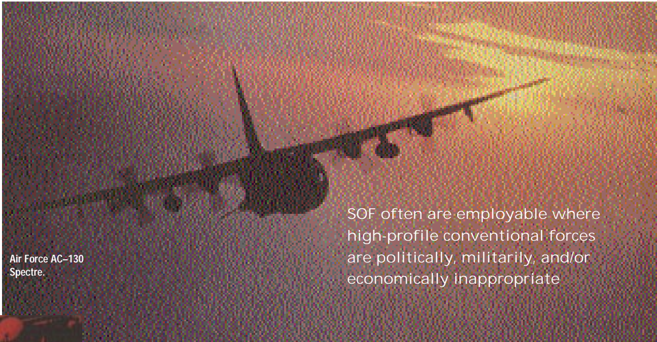
Air Force AC-130 Spectre.

SOF often are employable where high-profile conventional forces are politically, militarily, and/or economically inappropriate