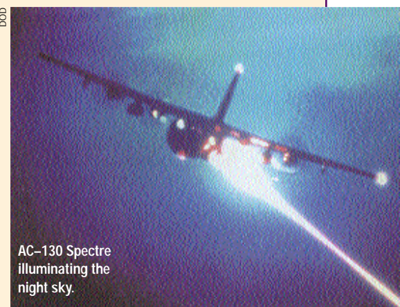
AC-130 Spectre illuminating the night sky.