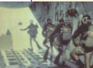
SEALs jumping from an Air Force AC-130.