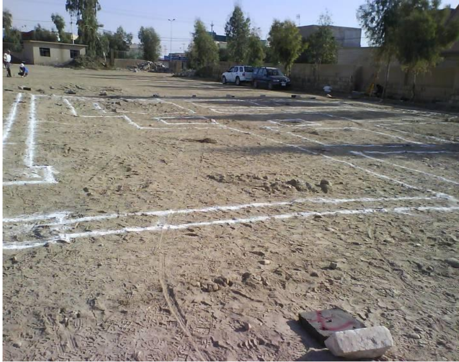
Site Photo 2. Layout of project site