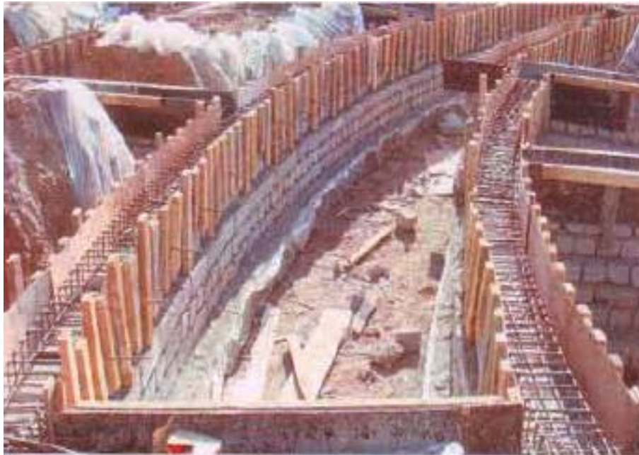
Site Photo 3. Administrative building -- rebar and form work