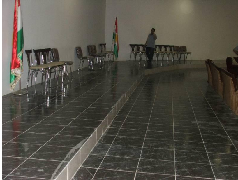
Site Photo 8. Multi-purpose building auditorium

The cafeteria incorporates a floor to ceiling glass exterior wall as an architectural feature that permits ambient light and creates a pleasant atmosphere in the cafeteria (Site Photo 9). The cafeteria was finished with plaster walls and ceramic tile flooring. The placement and quality of the tile was similar to the construction seen in the auditorium. The cafeteria was furnished by MOSA with commercial grade furniture.