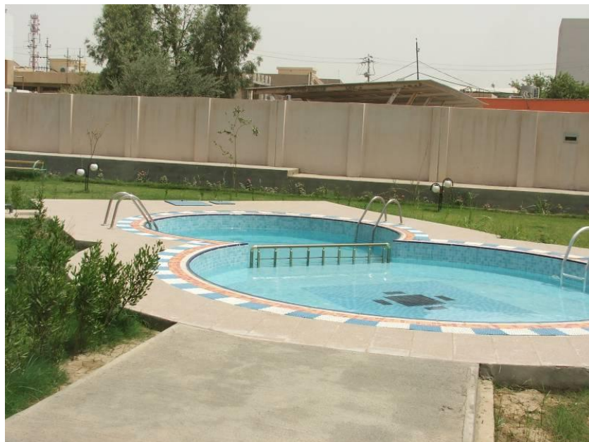
Site Photo 17. Swimming pool