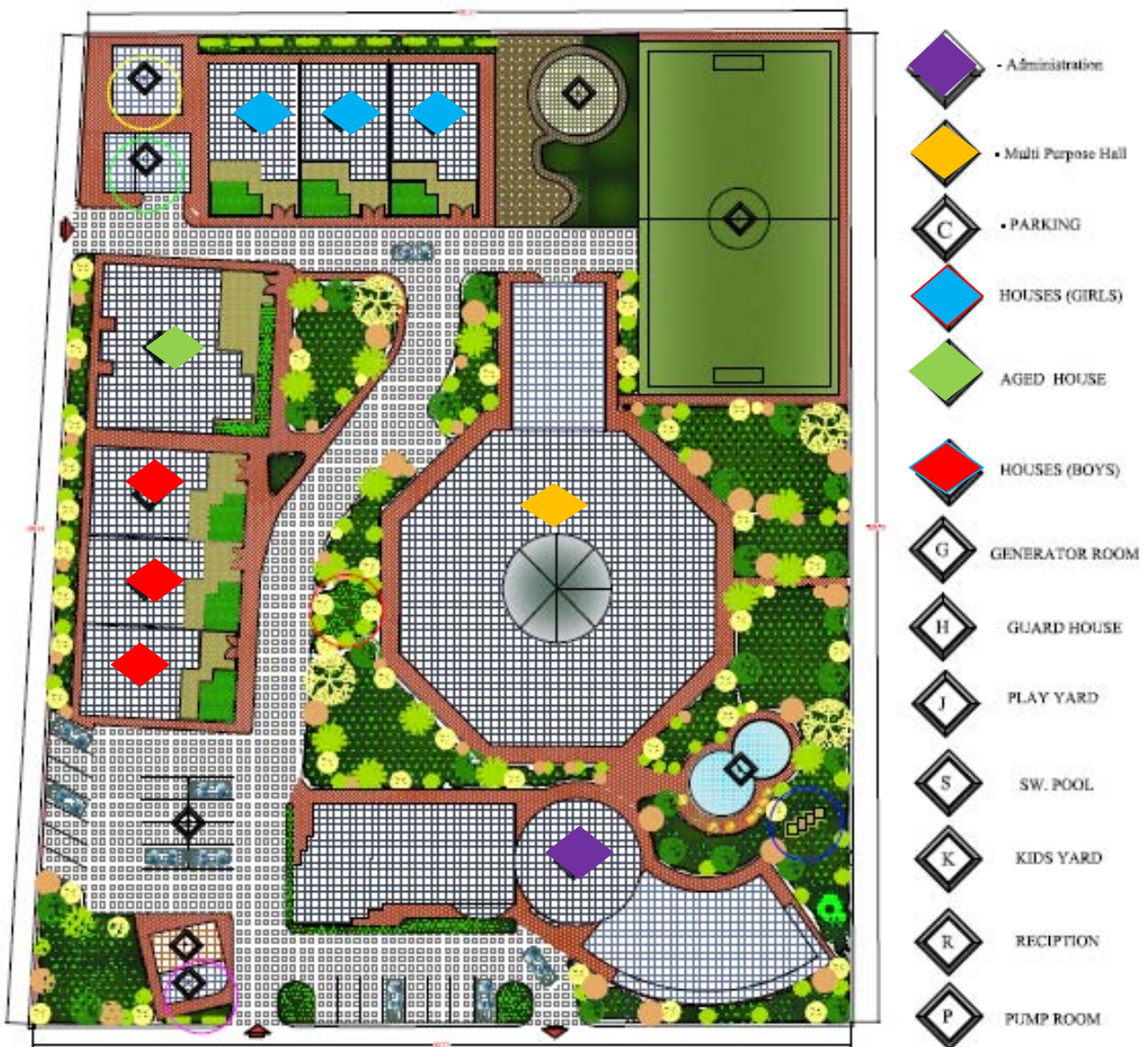
Figure 1. General site plan

The contractor-furnished site plan appeared well-planned and maximized the use of the limited space available. Landscaping and walkways were indicated on the site plan; the walkways provided good internal circulation around the buildings, and the landscape provided a buffer from the main and side streets, allowing the residents some privacy.