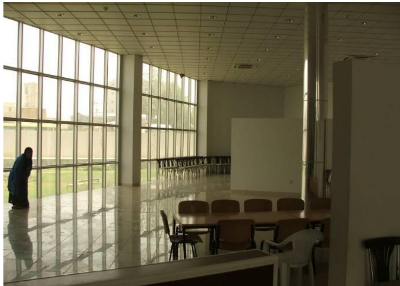
Site Photo 9. Multi-purpose building cafeteria

A single-story kitchen was annexed to the multi-purpose building. The kitchen consisted of commercial grade appliances, which included large gas cooking surfaces and deep fryers with stainless steel ventilation hoods (Site Photo 10). At the time of the site assessment, cafeteria personnel were preparing the noon meal.