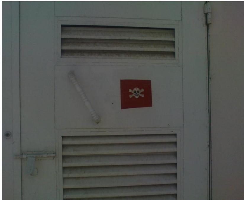
Site Photo 18. Warning sign on generator building

However, since the site assessment, the Erbil Resident Office worked with the contractor to have warning emblems installed on the generator building (Site Photo 18) who will also supplement the symbols with warning text.