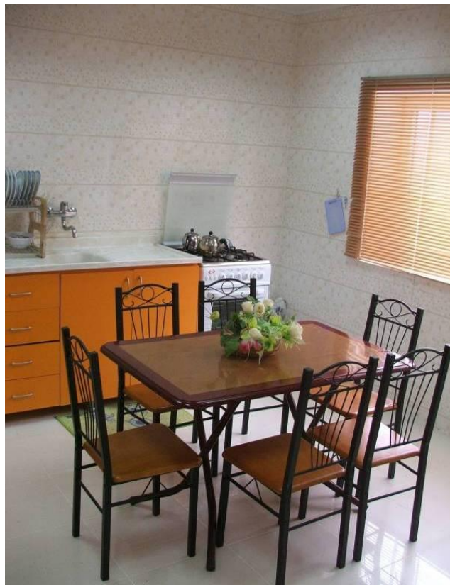
Site Photo 15. Senior citizen's living suite

Mobility and access issues for the senior citizens were addressed in the design. An automatic door was at the main entry to the building, and an elevator provided access to the individual suites. At the time of the site assessment, the automatic door was functioning; however, the elevator was out of service. The facility manager stated that the elevator was not operational but was still under warranty and that the contractor would repair the elevator.