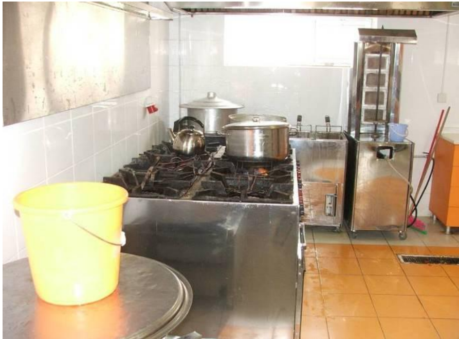
Site Photo 10. Commercial grade kitchen appliances

The kitchen area provided a significant amount of space for food preparation. The contractor installed cabinets and countertops in the kitchen for storage and work areas.