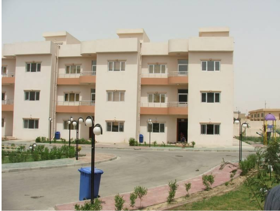
Site Photo 11. Exterior view of residential house for boys