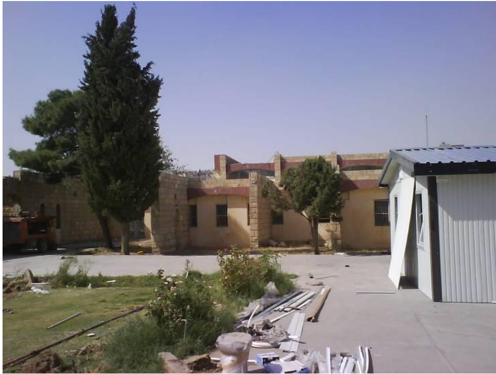
Site Photo 1. Pre-construction orphanage building site

(QA) report on 22 October 2007 shows the original orphanage building in disrepair (Site Photo 1).