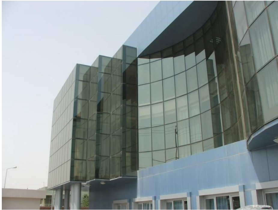
Site Photo 4. Exterior view of administration building

The construction was reinforced concrete beams and floor slabs with what are assumed to be reinforced concrete columns covered with stainless steel. The structure was configured to cantilever 5 from the interior column line over the rotunda floor.