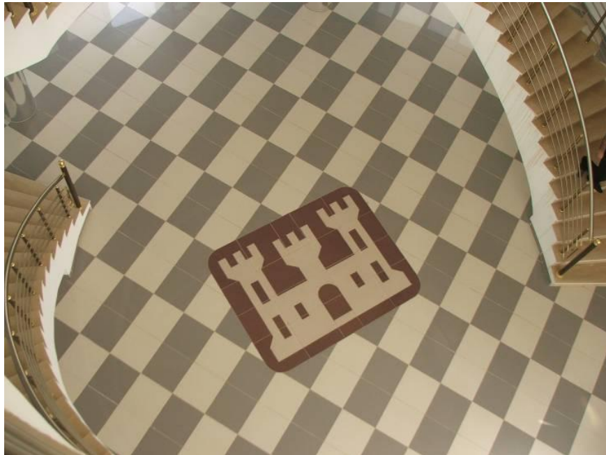
Site Photo 6. Decorative inlay in rotunda tile flooring