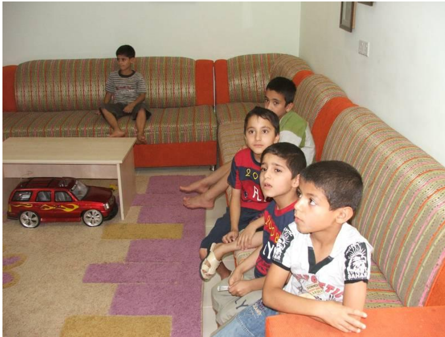
Site Photo 12. Male residential house common area

The bedrooms were arranged to accommodate three younger children or two older children. During the assessment, SIGIR noted that the bedrooms were satisfactorily furnished and maintained (Site Photo 13).