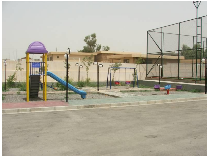
Site Photo 16. Playground

The swimming pool was located on the opposite side of the administration building, away from the dormitories (Site Photo 17). The facility's manager stated that the pool was located there to prevent unauthorized access by the children. Also, the swimming pool was surrounded by a security fence with a gate to limit access by unauthorized individuals.