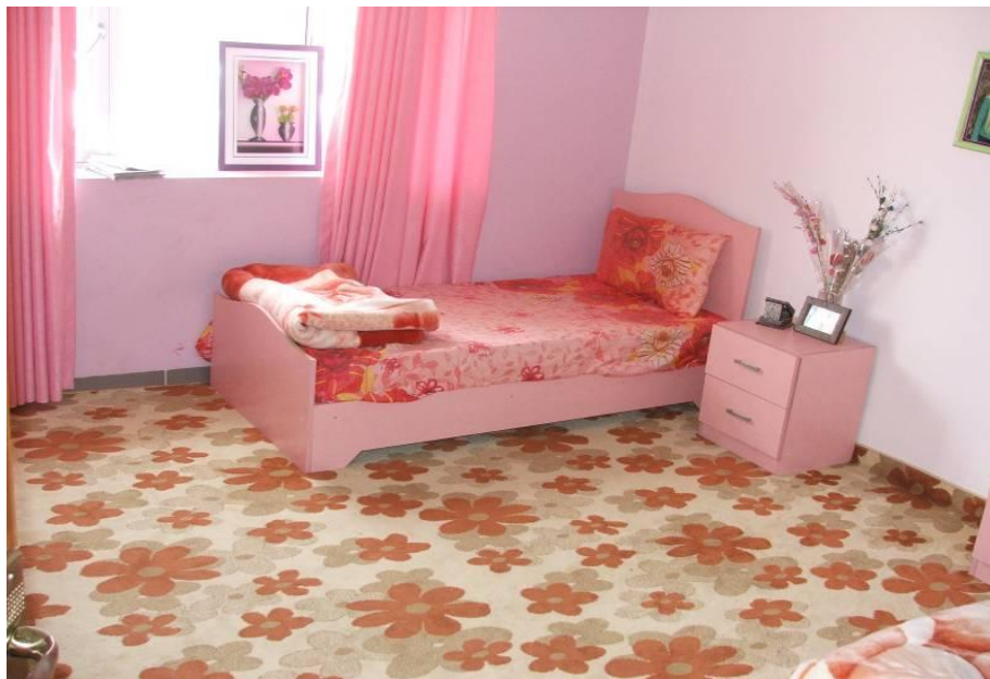
Site Photo 13. Female residential house bedroom

The utilities for the children's residential houses were functioning at the time of the site assessment. The ambient temperature was low enough that the air conditioning was not in use; however, the room ceiling fans were operating.