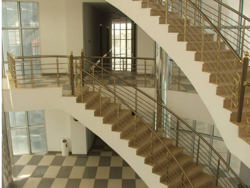
Site Photo 5. Central rotunda primary stairwell