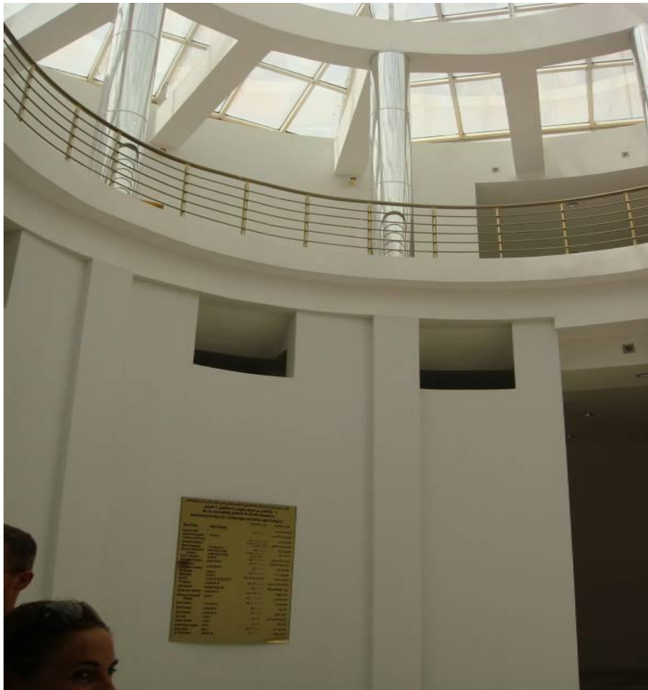
Site Photo 7. Rotunda of the multi-purpose building

A balcony surrounds the rotunda at the second level. Decorative brass and stainless steel handrails, similar to that used in the administration building, were constructed at the edge of the balcony. The columns are covered in stainless steel (Site Photo 7).