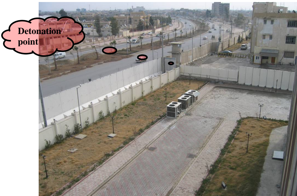
Site Photo 7: Repaired wall, installed T-walls and reconstructed guard shack. Photo taken from the roof of the services building.

The MOI main entrance is located at the southwest part of the complex. The blast carried through the building interior and blew out the entrance doors, windows, and ceiling. The