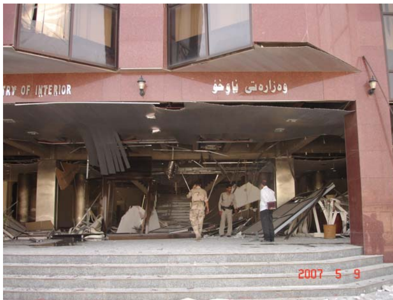
Site Photo 3: Entryway to MOI building

Engineers from the U.S. Army Corps of Engineers' (USACE) Gulf Region Division-North (GRN) Erbil Resident Office, the contractor, and KRG assessed the structural integrity of the buildings after the bomb-blast. They evaluated the load bearing columns, beams and walls as well as the non-loading bearing elements. There was significant damage to the ceiling, finishes, doors, and windows. Some of the partition walls in the buildings were moved from their original position. The engineering team concluded the building structural frames were not damaged and did not need to be replaced. All windows were replaced with higher grade shatter proof materials and interior doors were replaced with industrial grade materials.