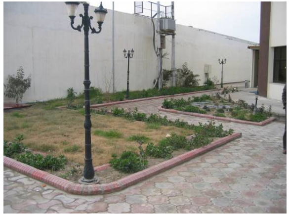
Site Photo 13. 250-kVA Transformer

The contractor assessed circuit breakers, electrical fixtures, and lights for damage and made necessary replacements. Our observation showed that circuit breaker panels, electrical outlets, and light fixtures were operating, in good repair and constructed with adequate materials. Site Photos 14 through 18 show the condition of the electrical components.