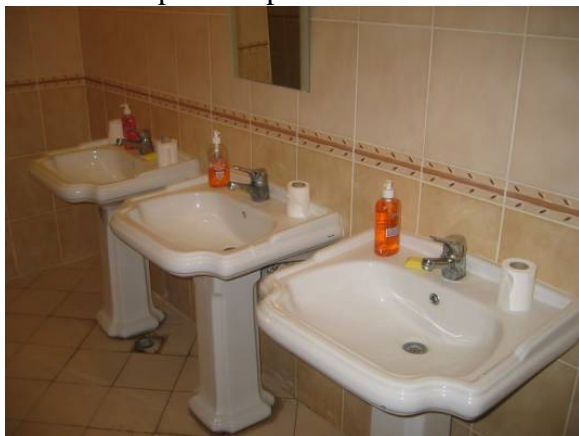
Site Photo 28. New sinks and tile in a MOI bathroom

We observed and photographed the plumbing in a number of bathrooms including the basement of the ministry and services buildings. The plumbing and fixtures were of good quality and functioned properly. Site Photos 28 and 29 show the material quality and workmanship in sample bathrooms.