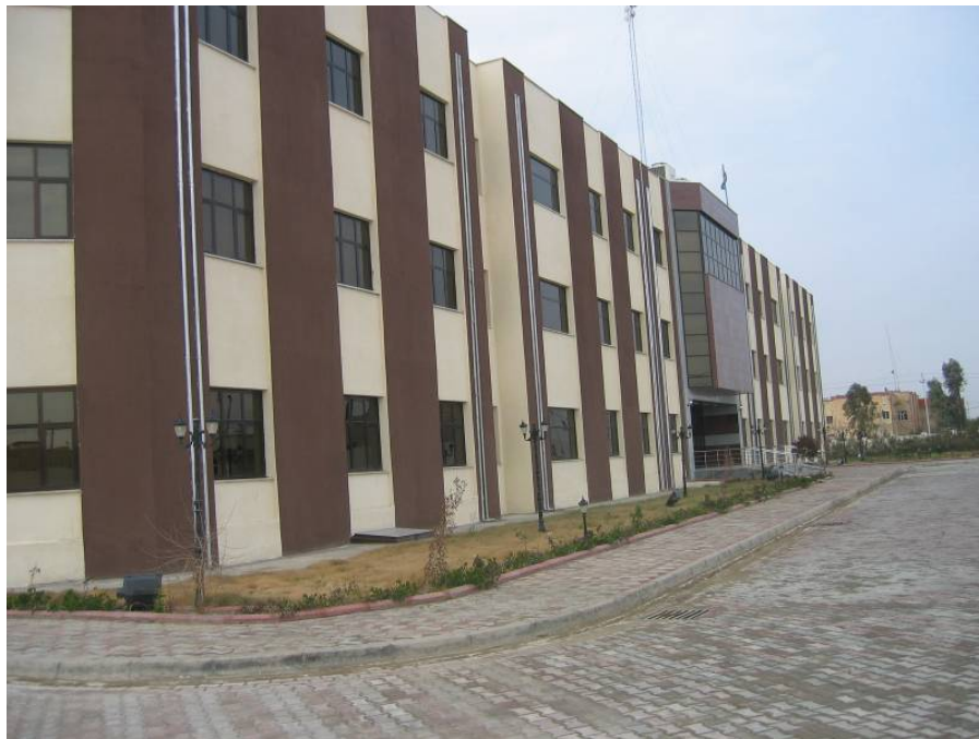
Site Photo 5: Refurbished services building

The VBIED detonated at the northeast entry gate, destroying the guard shack and severely damaging the perimeter wall. The guard shack was rebuilt, the perimeter wall repaired, and T-walls were erected along the “60-Meter” road that passes the complex. Site Photos 6 and 7, taken from the roof of the services building show the destruction and completed repairs.