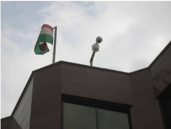
Site Photo 21. 360° Camera located on the services building

We observed and photographed a number of security cameras around the facility perimeter and visited the security control room to observe the camera monitors. Twelve newly installed Sony monitors provide good resolution and coverage of the entire complex. The system includes telephoto capability that allows close-ups adequate to read license plates on vehicles traveling along the perimeter roads. We also observed and photographed the backup system of batteries and uninterrupted power supply systems located in the room. Site Photos 21 through 23 show a security camera and control room equipment.