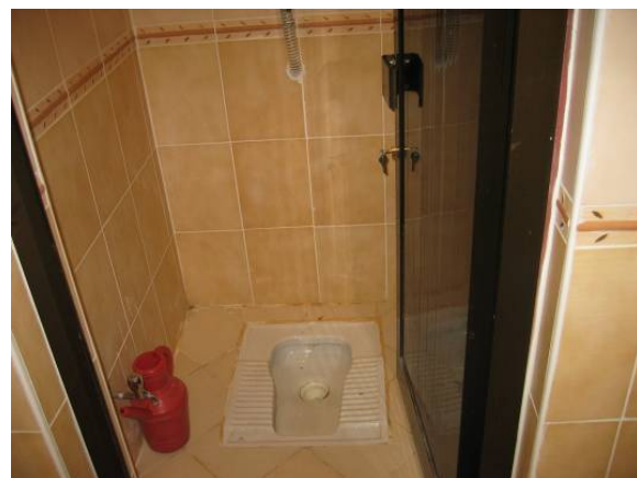
Site Photo 29. New eastern toilet in a MOI bathroom