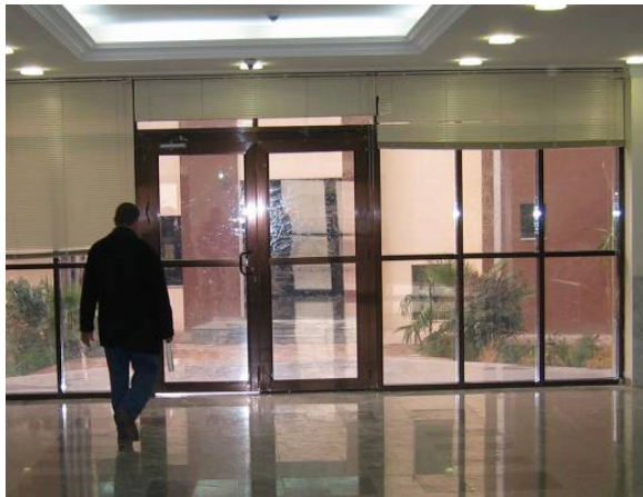
Site Photo 35. Aluminum entry door

Aluminum doors were installed at the building entrances and bathrooms. The new materials were 30 percent thicker (2 centimeters (cm) vs. 1.5-cm) than those used in the previous construction. Handrails were repaired or replaced with the same quality material as before. We observed, photographed, and tested the operations of a sample of doors in the ministry and services buildings and found them to function properly. The handrails were stable and well anchored. Site Photos 35 through 37 show examples of the new aluminum doors and refurbished handrails.