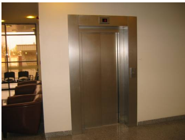
Site Photo 24. Elevator in MOI building

We rode one elevator in the MOI building to the third floor. The ride was smooth and the elevator started and stopped, level with the floor, without jerking. Site Photo 24 shows the elevator condition at the time of our site visit.