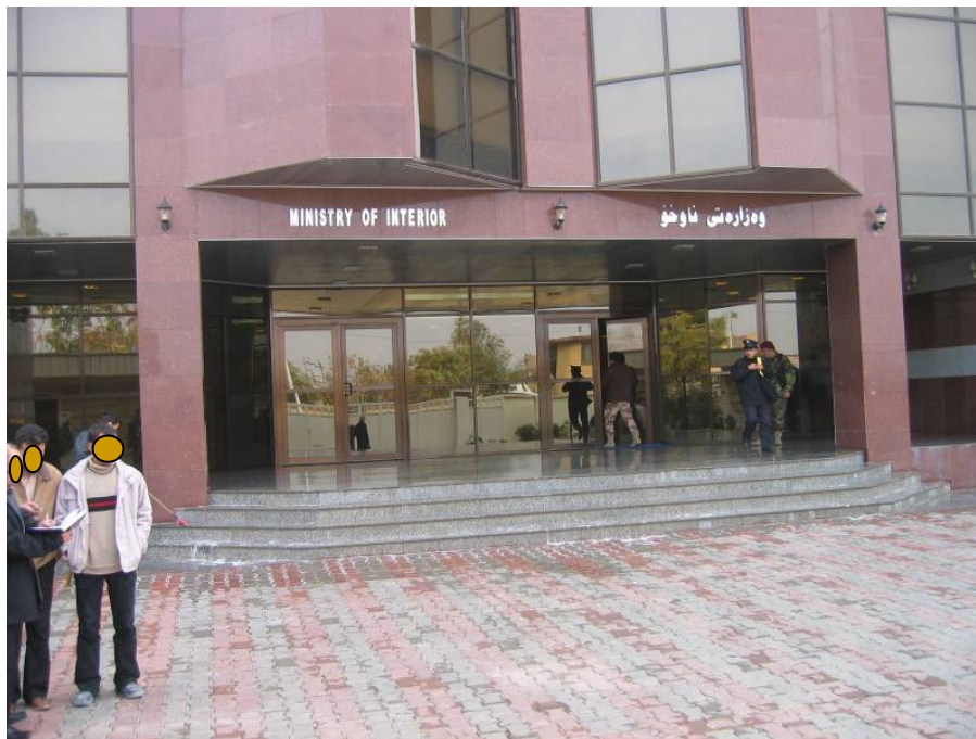
Site Photo 9: Repaired MOI entrance

The contract required that the site be properly graded to allow for positive drainage toward any adjacent roads. As we moved about the grounds of the complex, we