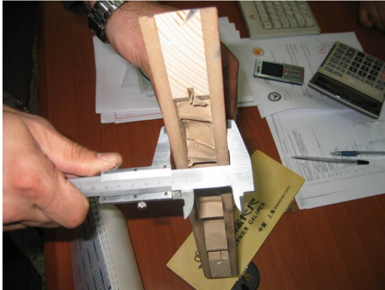
Site Photo 34. Cross section of an upgraded interior wooden door

We observed and photographed a crosscut section of a new door (Site Photo 34) and tested a sample of doors which operated properly.