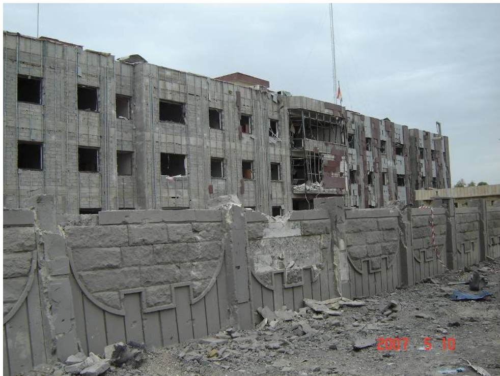
Site Photo 1. Damage to the north side of the services building & perimeter wall.