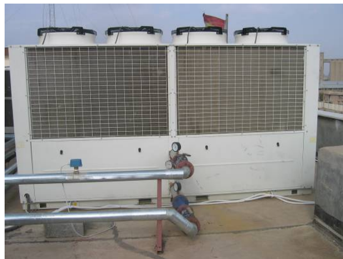
Site Photo 27. New boiler located on the roof of the services building

We observed and photographed the plumbing in a number of bathrooms including the basement of the ministry and services buildings. The plumbing and fixtures were of good quality and functioned properly. Site Photos 28 and 29 show the material quality and workmanship in sample bathrooms.