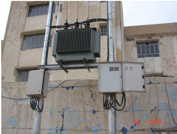
Site Photo 12. 400-kVA Transformer

The contract required installation of one 250 kilovolt amp (kVA) and one 400-kVA transformer. The work included providing poles for 11-kV high-voltage lines with all accessories to be energized. Site Photos 12 and 13 show both transformers were installed and connected to power lines adjacent to the complex.