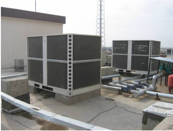
Site Photo 25. New chiller units located on the roof of the services building