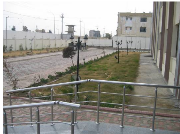
Site Photo 36. Hand rails at services building entrance