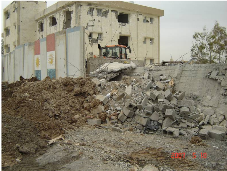
Site Photo 2. Security building damage