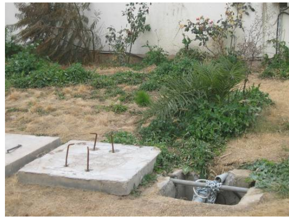
Site Photo 33. Septic tanks located near the south side perimeter wall

The contractor's assessment concluded that stronger doors and shatter proof windows would have significantly mitigated damage from the blast. The current contract required industrial grade doors and hardware installed throughout the facility to prevent the level of destruction experienced when the other doors and windows collapsed from the blast.