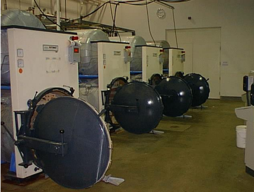
Stock Retorts (GFE)