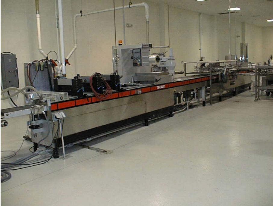
Tiromat Horizontal Form Fill Seal (GFE)