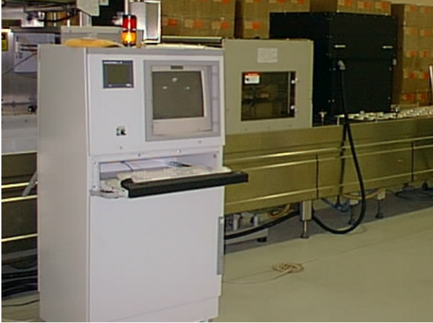
Machine Vision System MRE pouches (GFE)