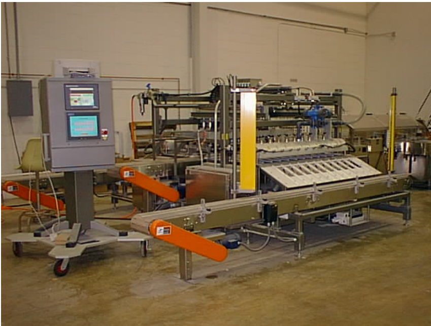
Multi Unit Leak Detector (GFE)