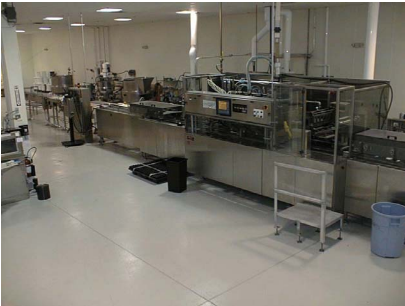
Raque Heat Sealer (GFE)