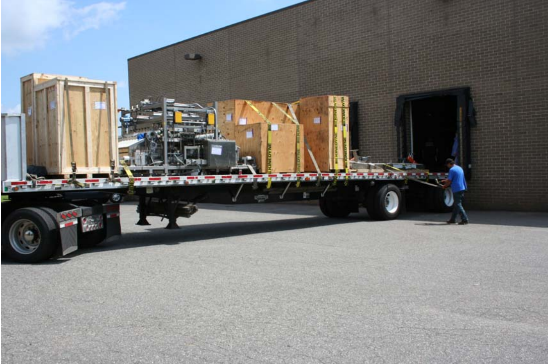
Shipment to DSMO warehouse