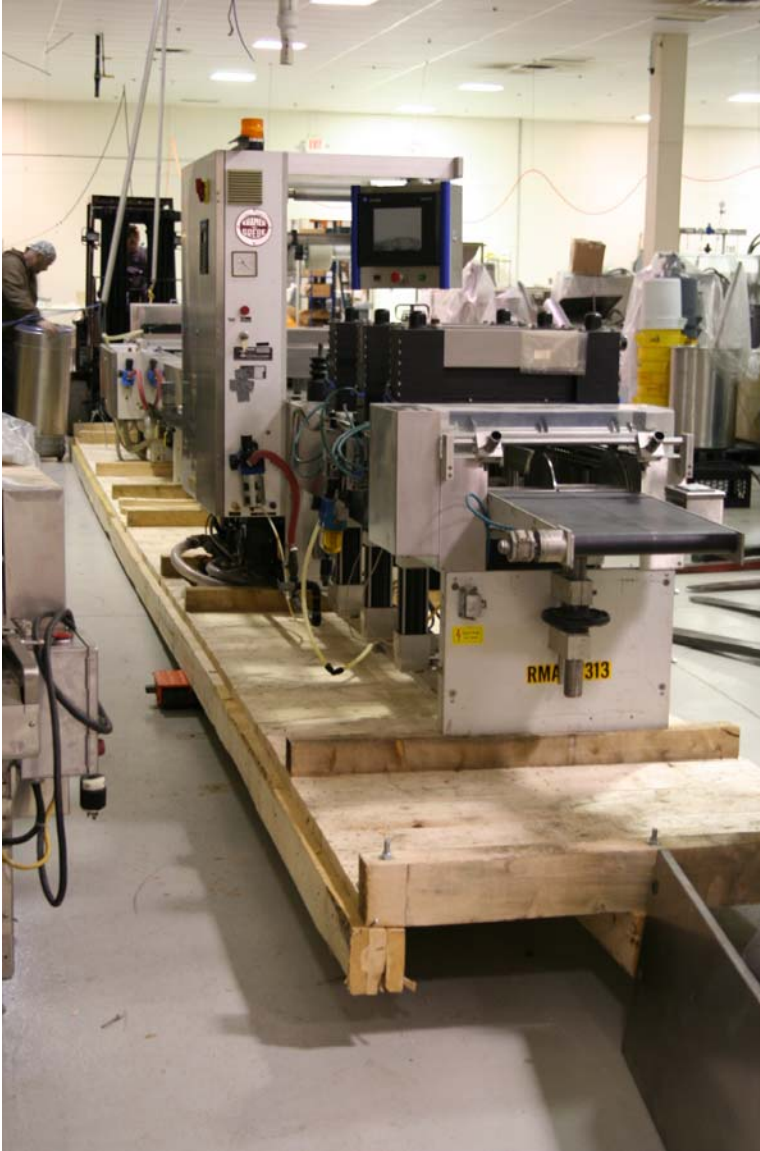
Tiromat, Horizontal Form Fill and Sealer