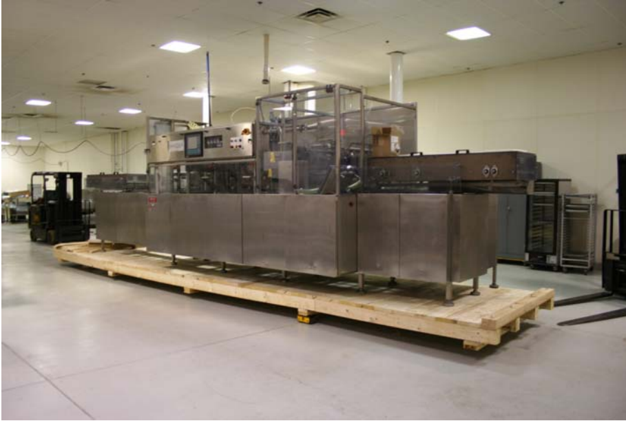
Raque Heat Sealer