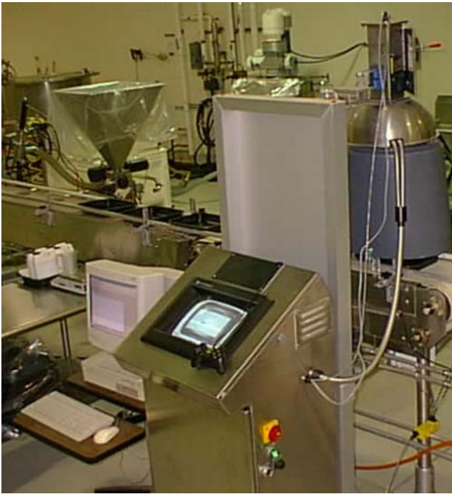
Machine Vision System Half Steam table Tray (GFE)