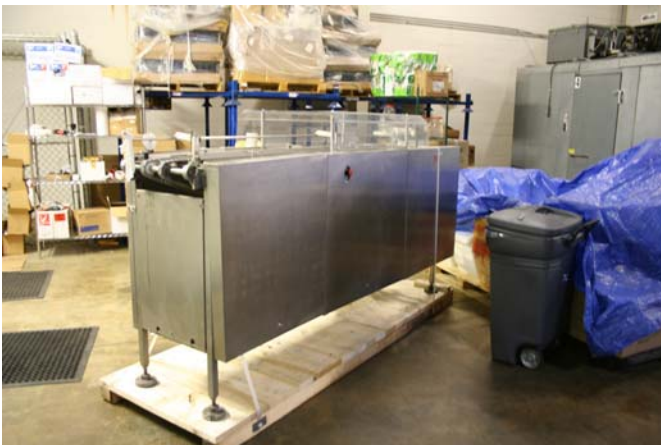
Raque Infeed Conveyor