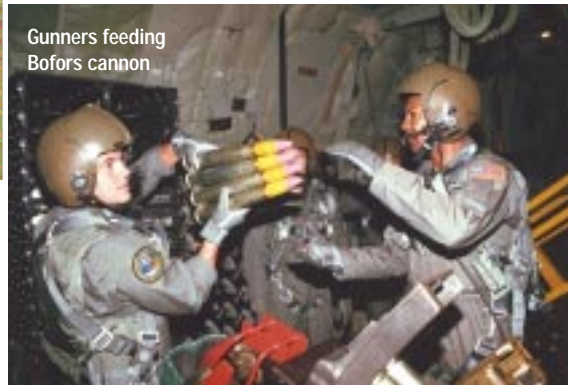
Gunners feeding Bofors cannon