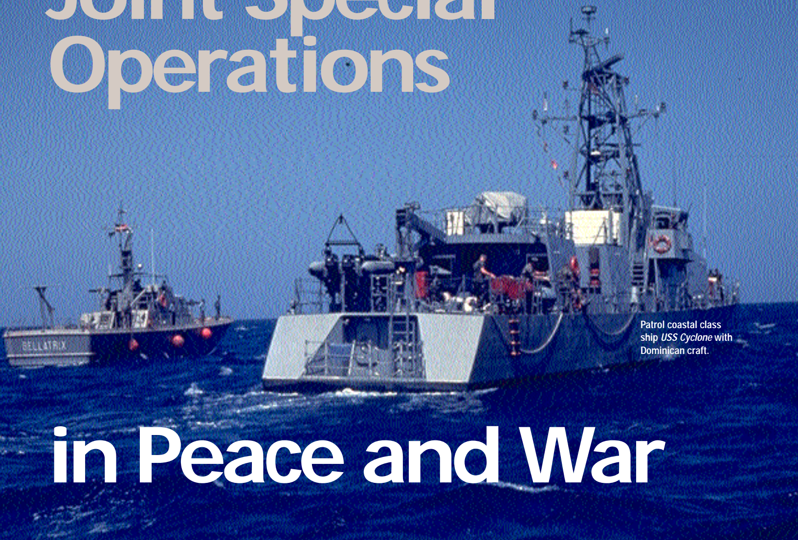
Patrol coastal class ship USS Cyclone with Dominican craft.